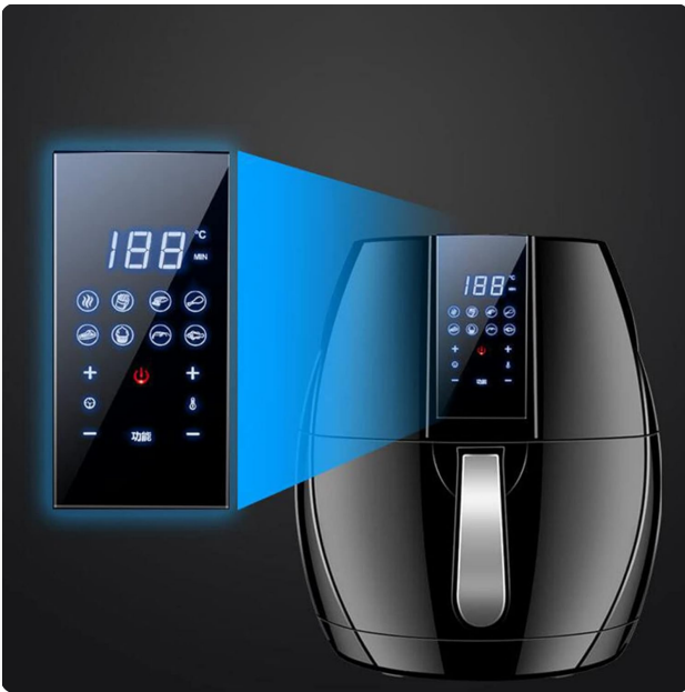
Figure 3: Detailed view of the LED touch screen control panel, showing temperature and time displays, along with various preset icons and manual control buttons.