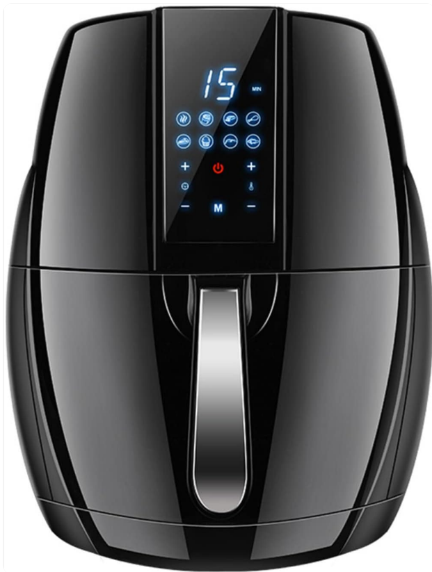
Figure 1: Front view of the Digital Air Fryer, showcasing its sleek black design and the prominent LED touch screen display.