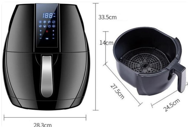
Figure 2: Diagram illustrating the dimensions of the air fryer (approximately 28.3cm width, 33.5cm height) and its nonstick basket (approximately 27.5cm length, 24.5cm width, 14cm depth).