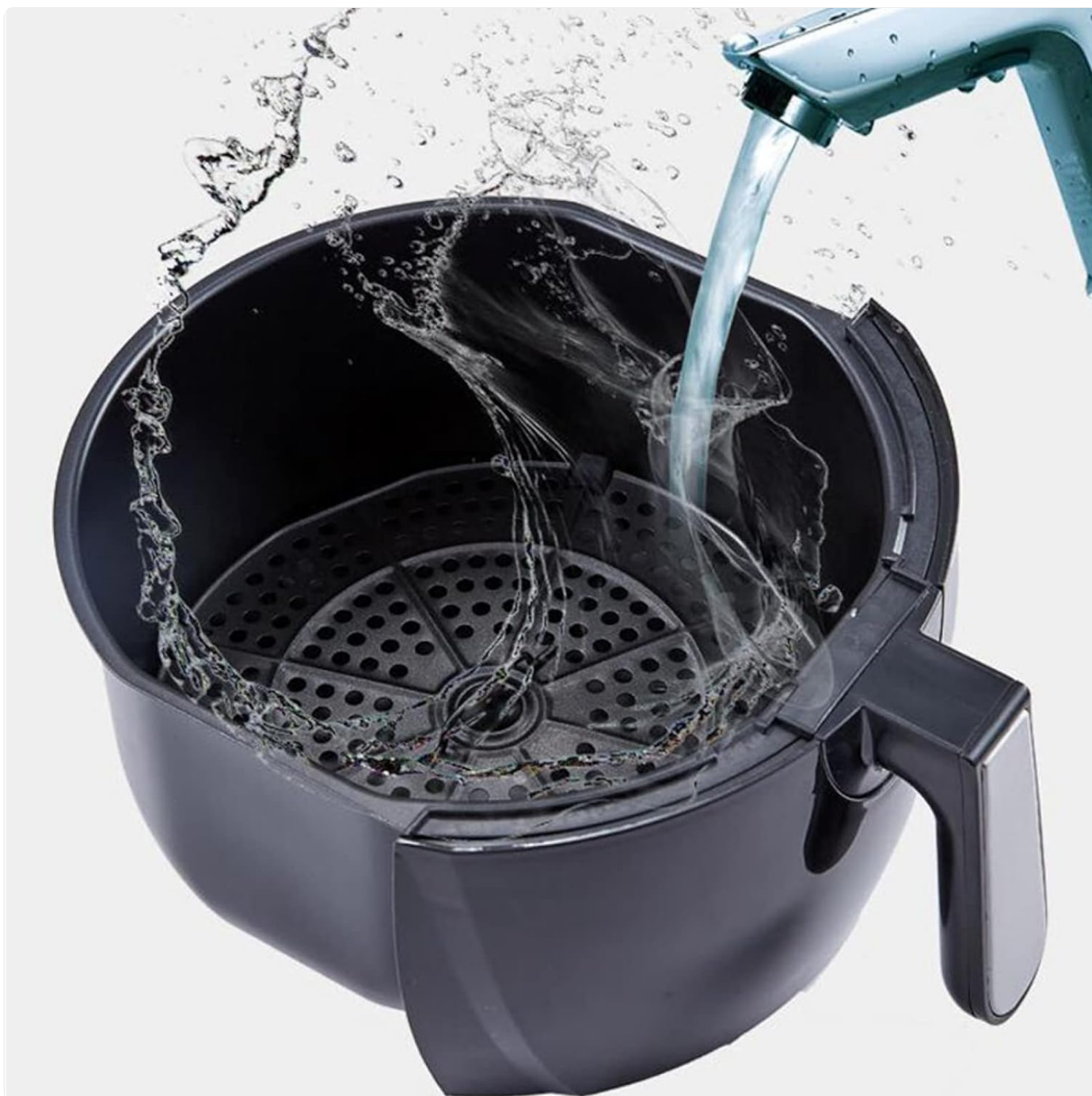
Figure 7: Image demonstrating the ease of cleaning the nonstick air fryer basket, with water being poured into it.