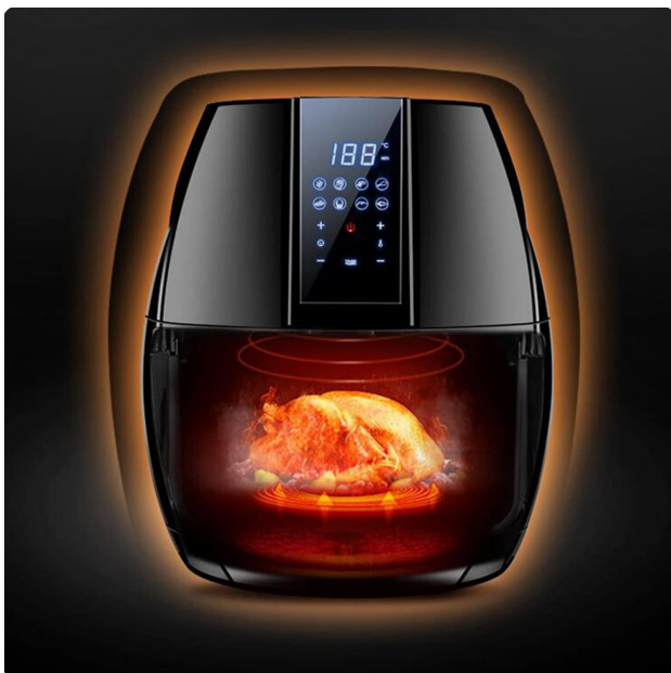
Figure 5: Illustration of food, such as a whole chicken, being