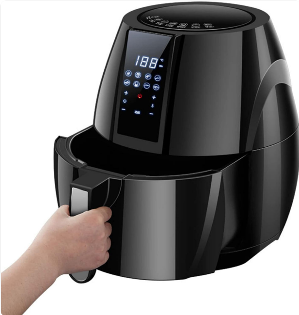
Figure 4: A hand demonstrating the easy removal of the air fryer's nonstick basket using its cool-touch handle.