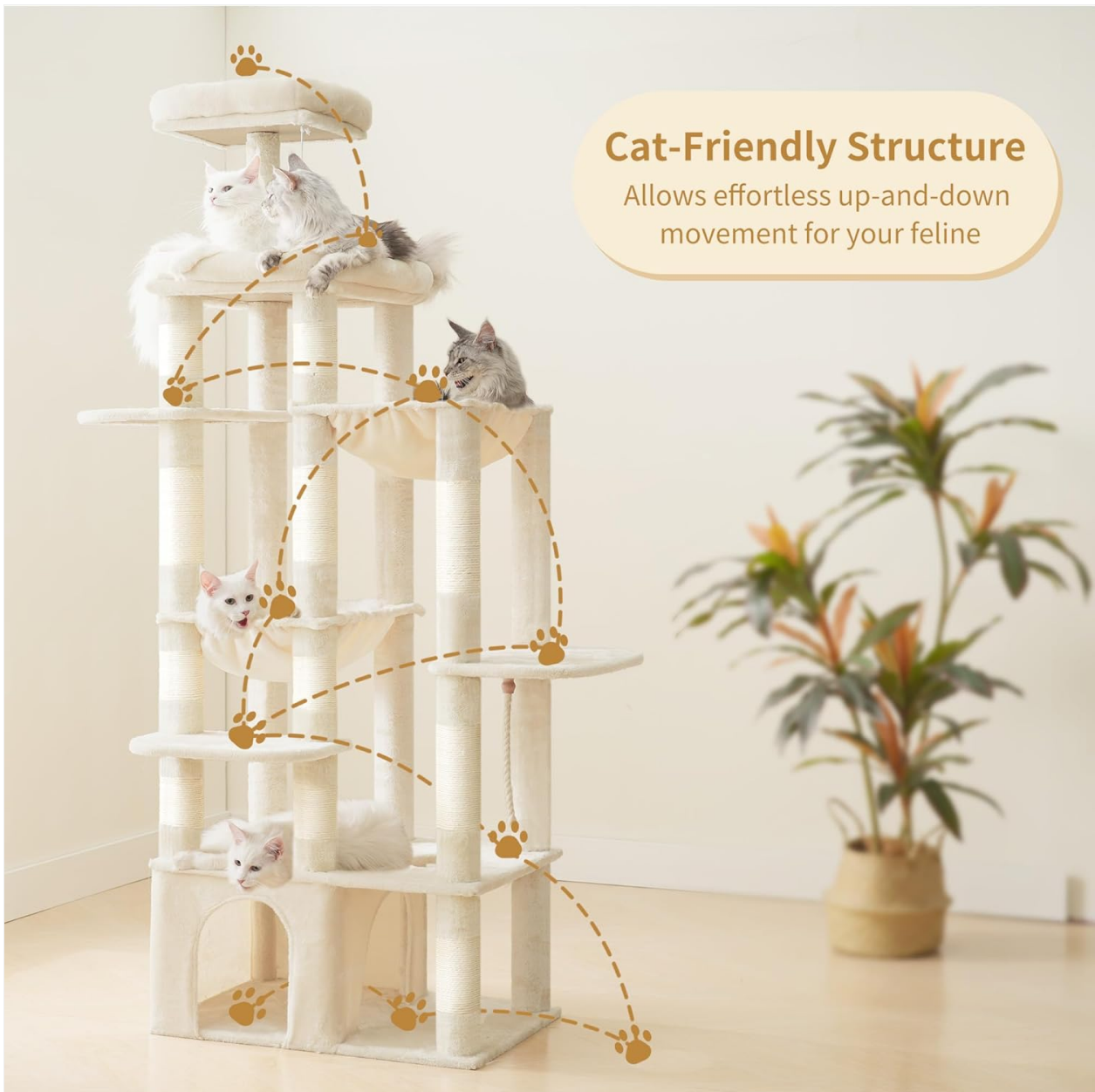
Image: The Heybly HCT037M cat tree showcasing its multi-level design and various features, with paw prints indicating easy movement for cats.