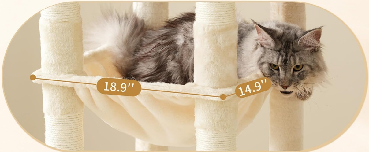
Image: The dual cat baskets, each measuring 18.9 inches by 14.9 inches, providing comfortable resting spots for multiple cats.