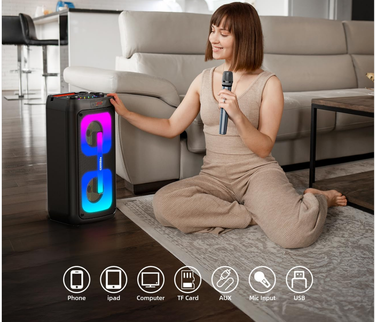
Image: The Gesnada K68 Portable Karaoke Machine, a black rectangular speaker with colorful LED lights on the front, accompanied by two wireless microphones.

Supports multiple connections, allowing you to enjoy joyful moments anytime