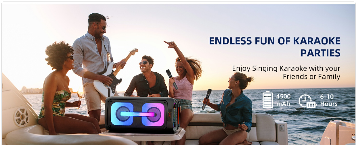
Image: The karaoke machine showcasing its RGB LED lights, with examples of different lighting patterns.

The speaker features multiple lighting modes that sync with the music rhythm. Use the dedicated light button on the control panel to cycle through the 9 dazzling lighting effects.