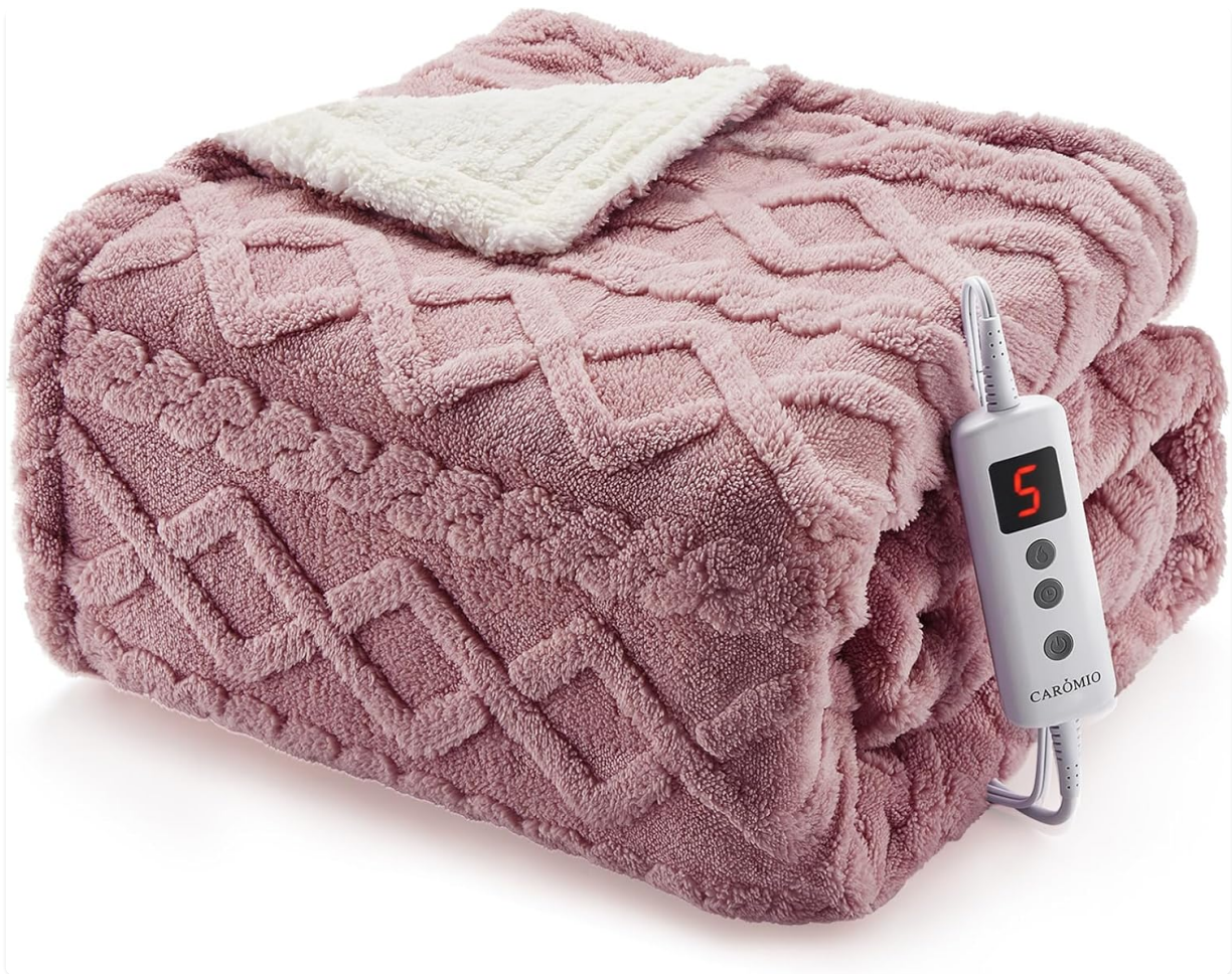
The CAROMIO Heated Throw Blanket in Dusty Pink, folded neatly with its digital controller displaying heat level 5.