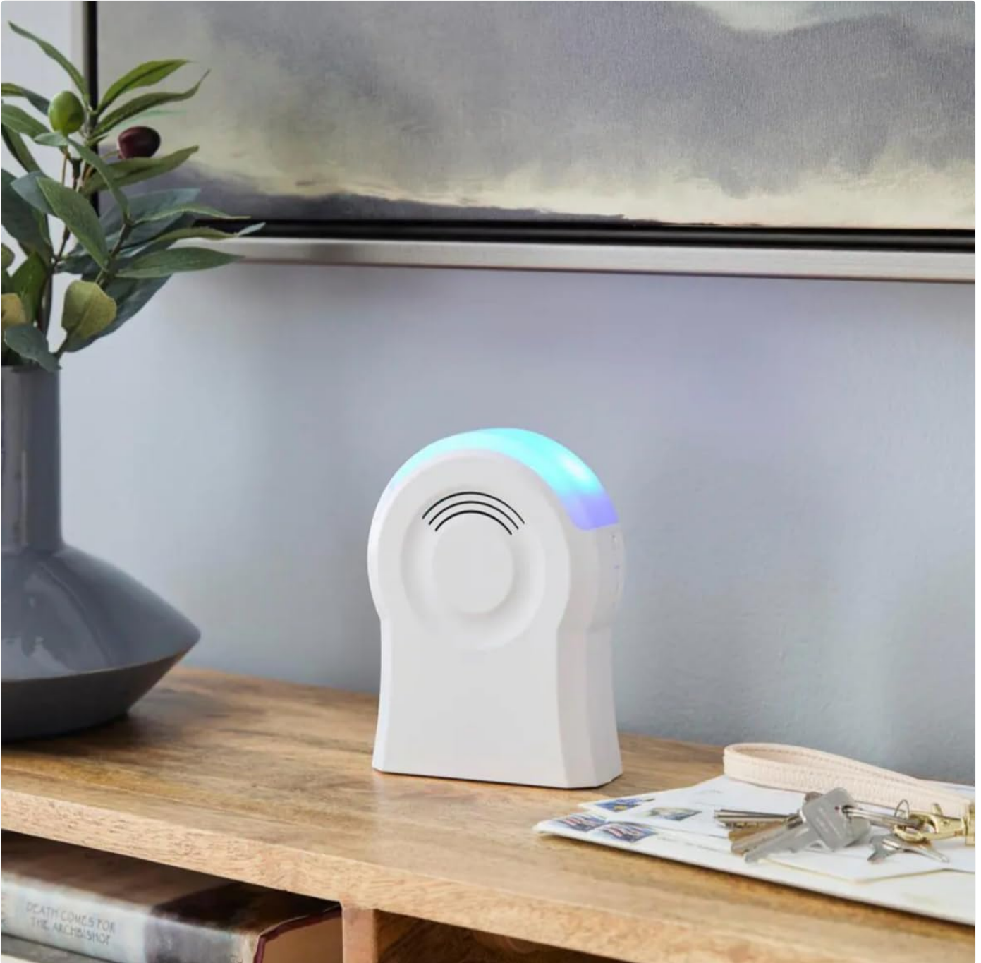
Figure 5: The chime unit in a home setting, demonstrating the blue strobe light alert.