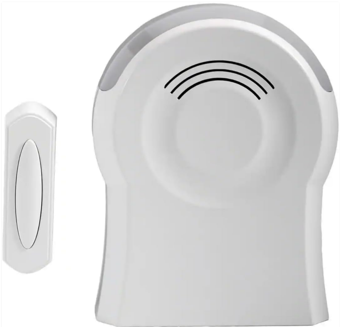
Figure 1: Defiant Wireless Doorbell Strobe Kit, showing the main chime unit and the wireless push button.