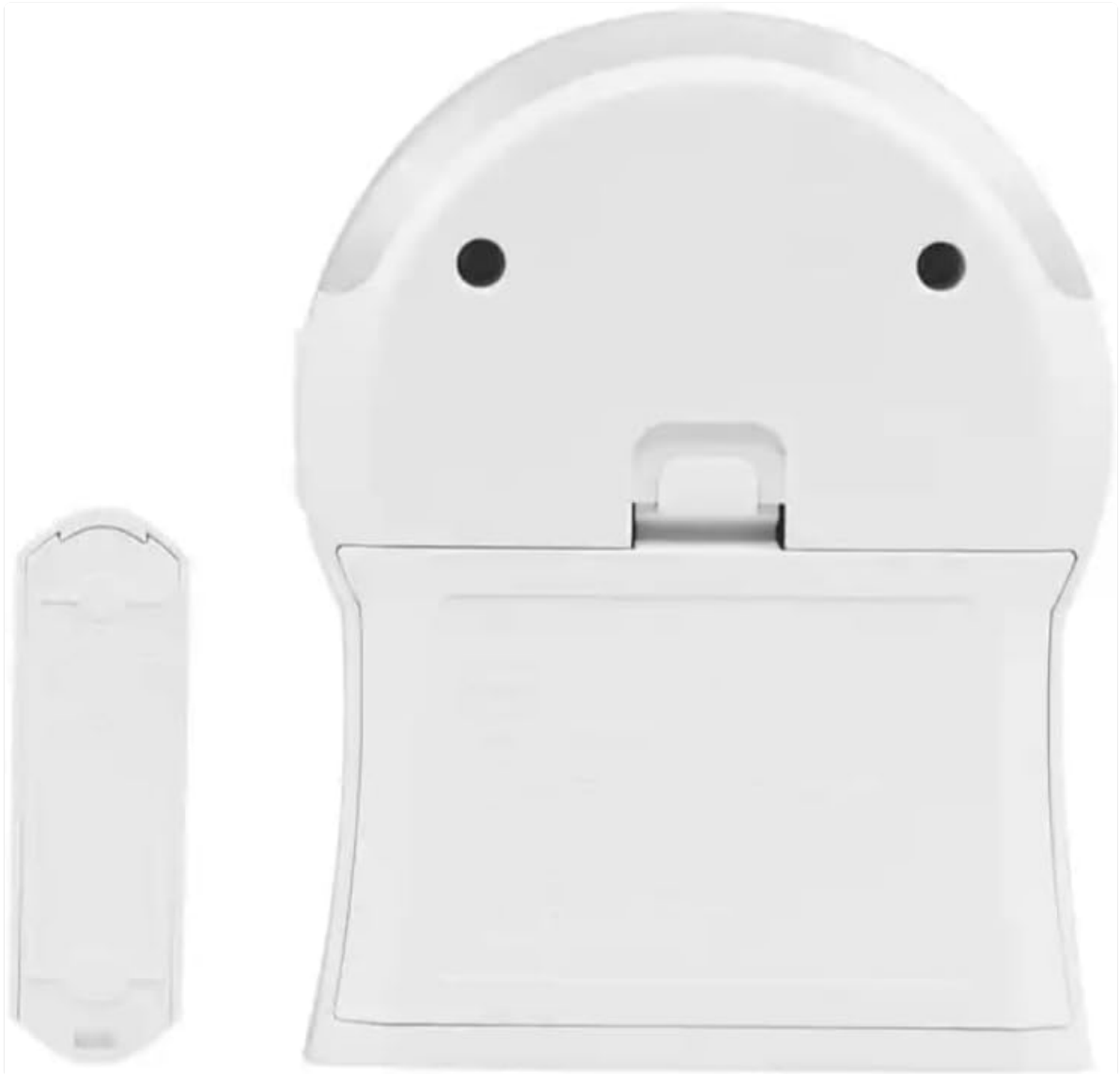
Figure 2: Rear view of the chime unit, illustrating the battery compartment. The push button is also shown from the back.