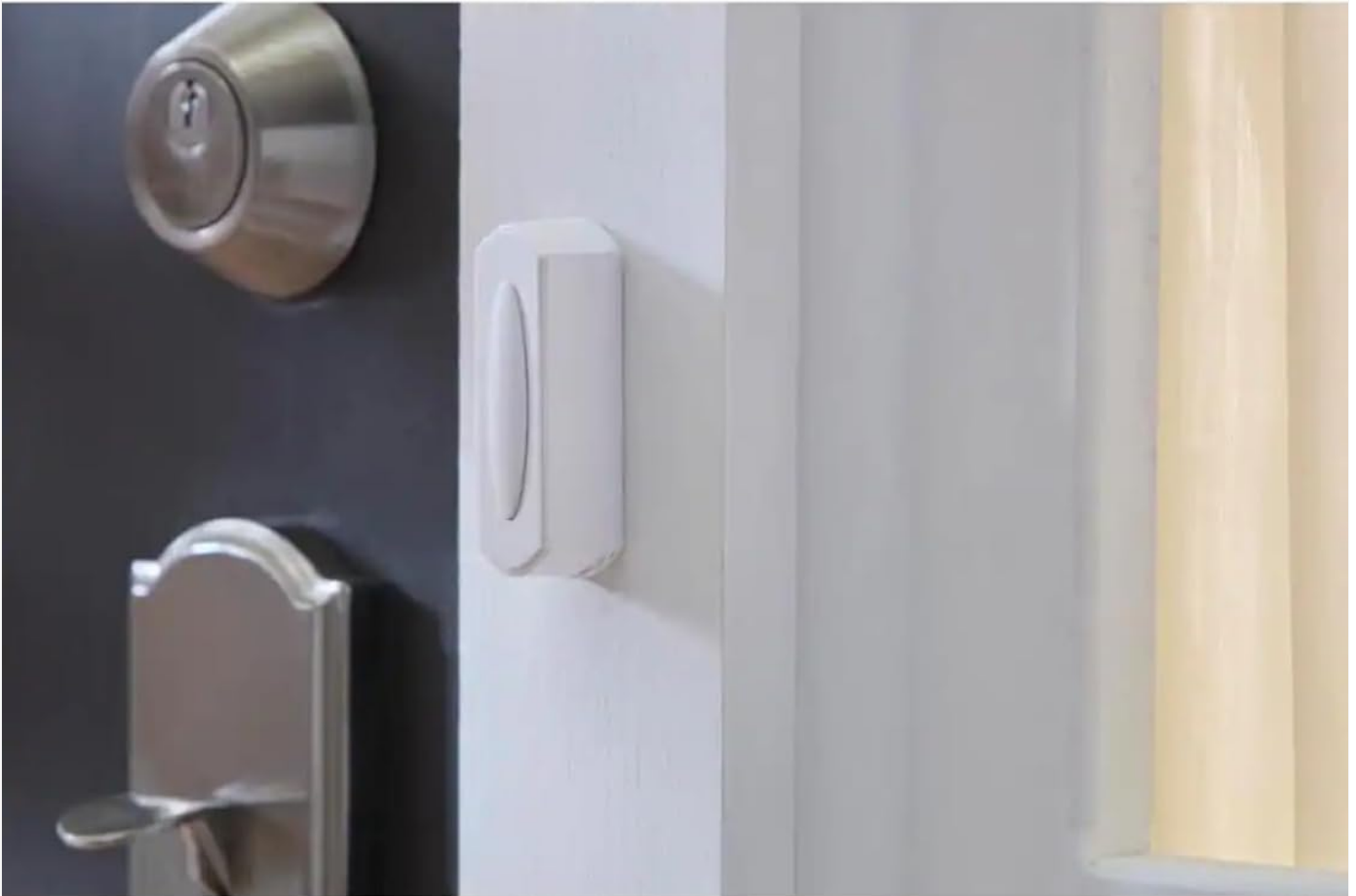
Figure 4: The wireless push button installed on a wall adjacent to a door.