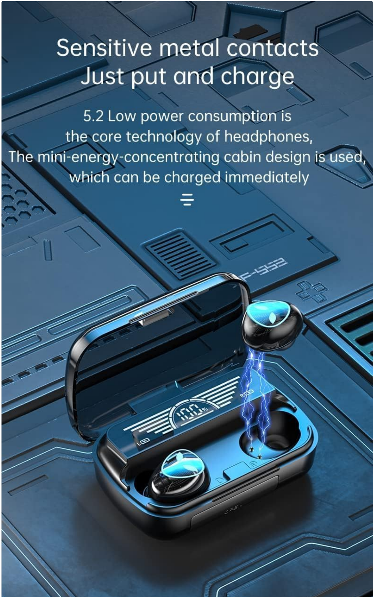
Image: The M20 charging case with earbuds, illustrating the sensitive metal contacts for charging and the digital display showing battery percentage.