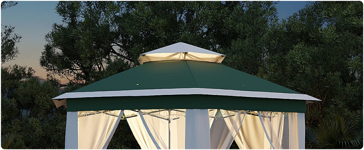
Image: The Garvee Hexagonal Pop Up Gazebo provides ample space for 4-5 people to enjoy outdoor activities comfortably.