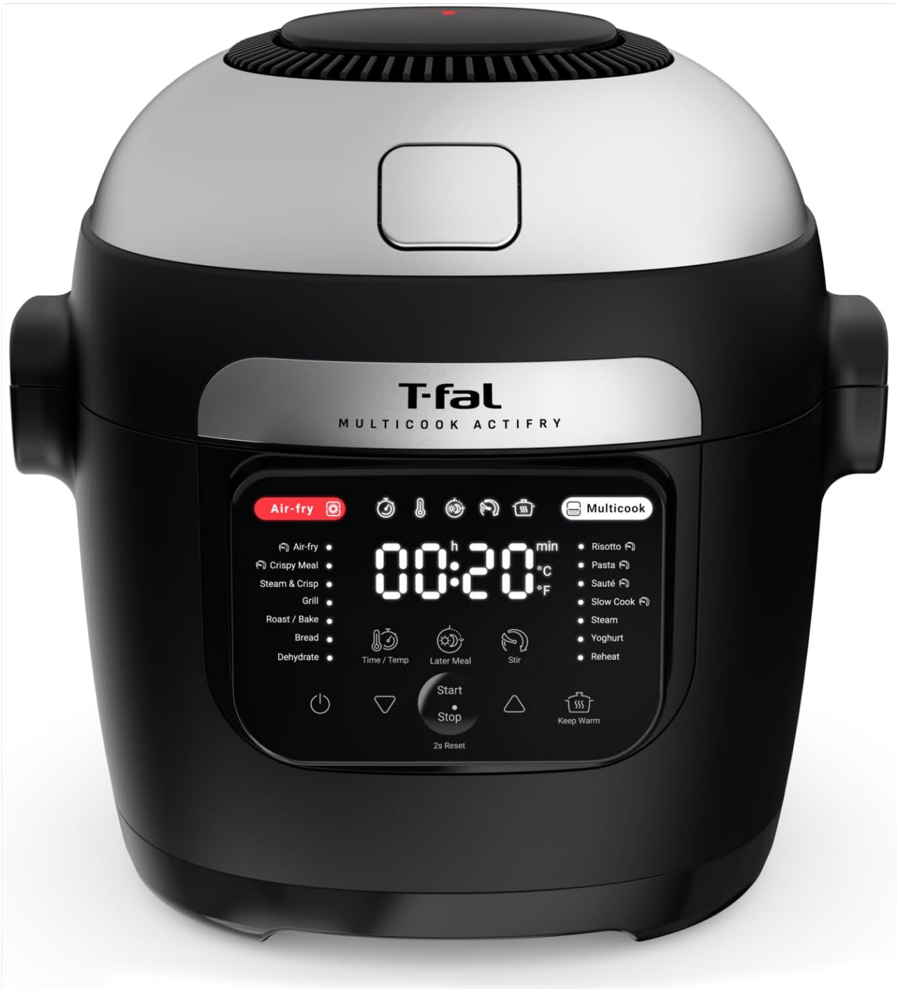
Figure 5: Detailed view of the control panel with program indicators.

The digital display shows cooking time, temperature, and selected program. Buttons allow for program selection, time/temperature adjustment, and start/stop functions.