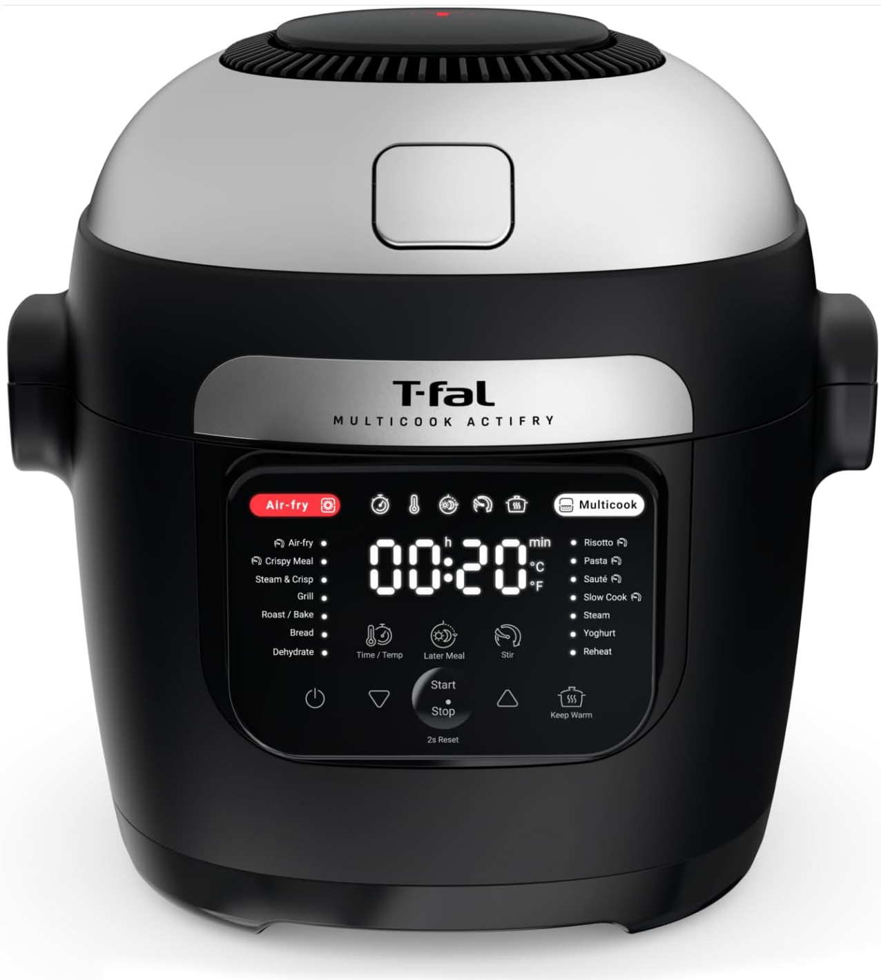
Figure 1: Front view of the T-fal Multicook Actifry, showcasing its digital display and control panel.