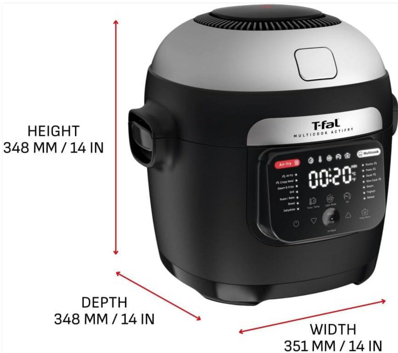
Figure 12: Product dimensions for the T-fal Multicook Actifry.