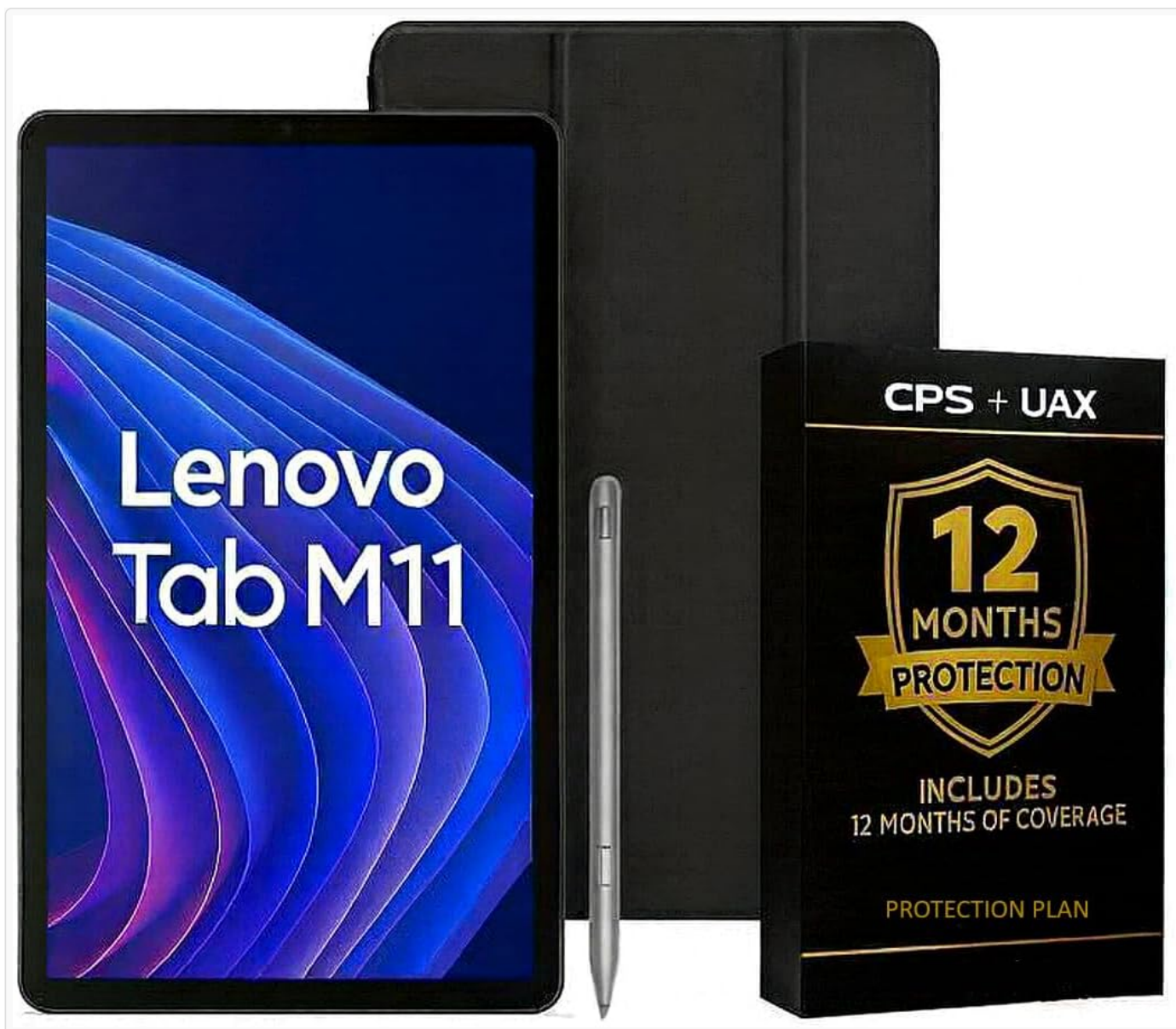
Figure 1.1: The Lenovo Tab M11 tablet bundle, showcasing the tablet, folio case, stylus pen, and the 12-month protection plan packaging.