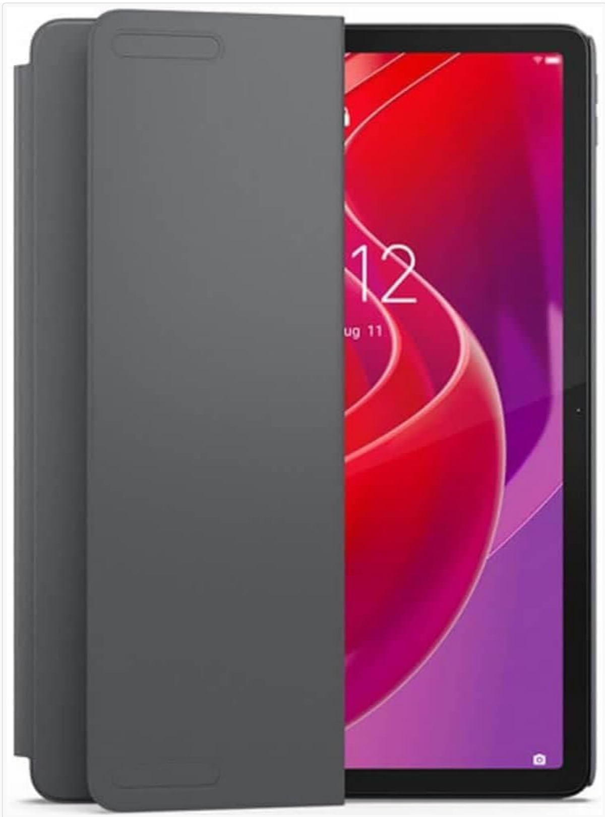
Figure 4.2: The Lenovo Tab M11 highlighting its durable, kid-proof design, the included Lenovo Tab Pen, and up to 10 hours of battery life.