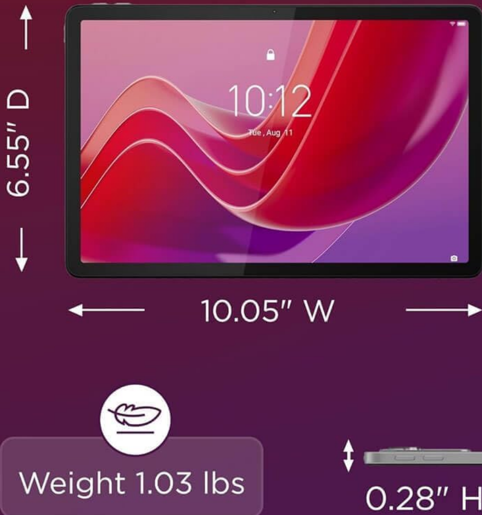
Figure 7.1: Visual representation of the Lenovo Tab M11's dimensions (width, depth, height) and weight.