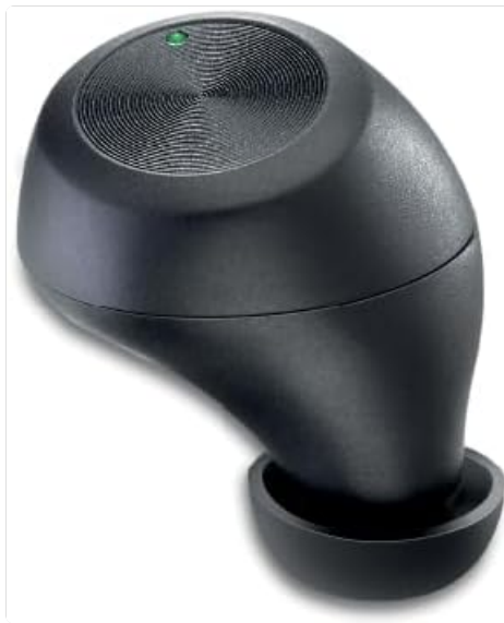
Image: A single InMotion True Wireless Earbud, showcasing its ergonomic design and the touch control surface.