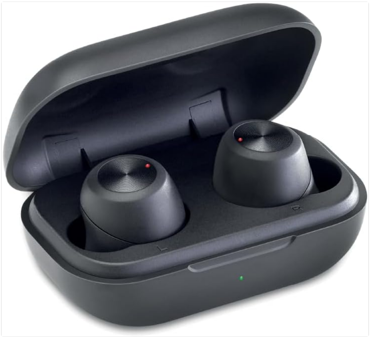
Image: The InMotion True Wireless Earbuds resting inside their open charging case, showing the compact design and charging indicators.