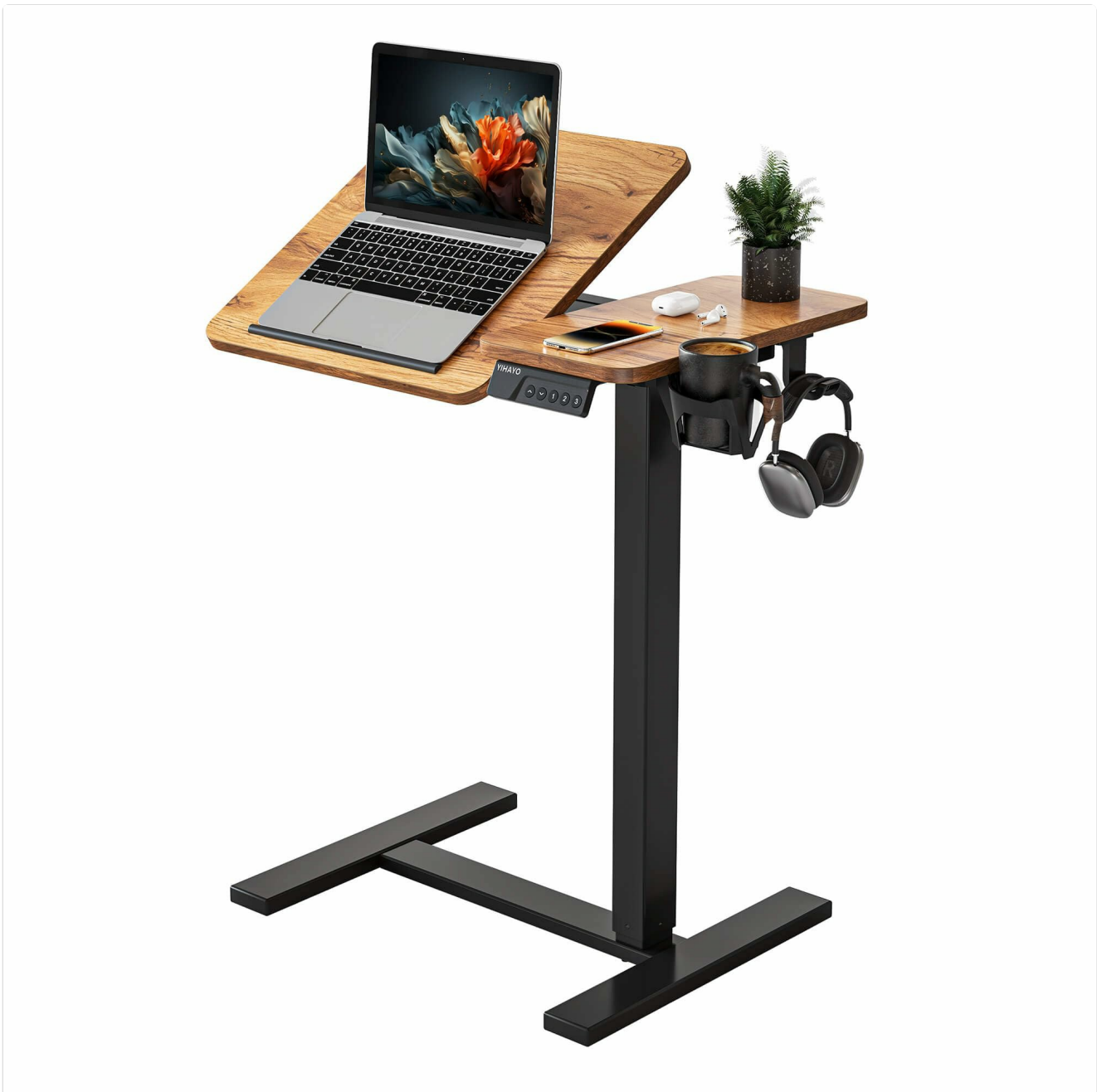
Image 1.1: YIHAYO Adjustable Electric Overbed Bedside Table in a living room setting.