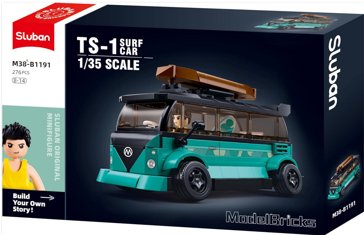
Image: The Sluban TS-1 Surf Car Model Kit showing the removable roof feature, a minifigure, and a surfboard, illustrating interactive play elements.