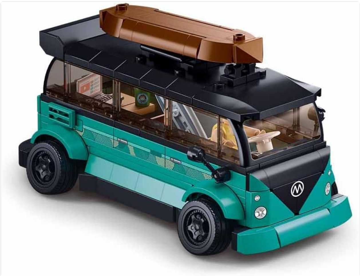
Image: Side view of the assembled Sluban TS-1 Surf Car Model Kit, highlighting the roof rack and tinted windows.