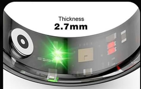
Image: The Yoidesu Smart Health Ring, highlighting its internal sensors and overall design.