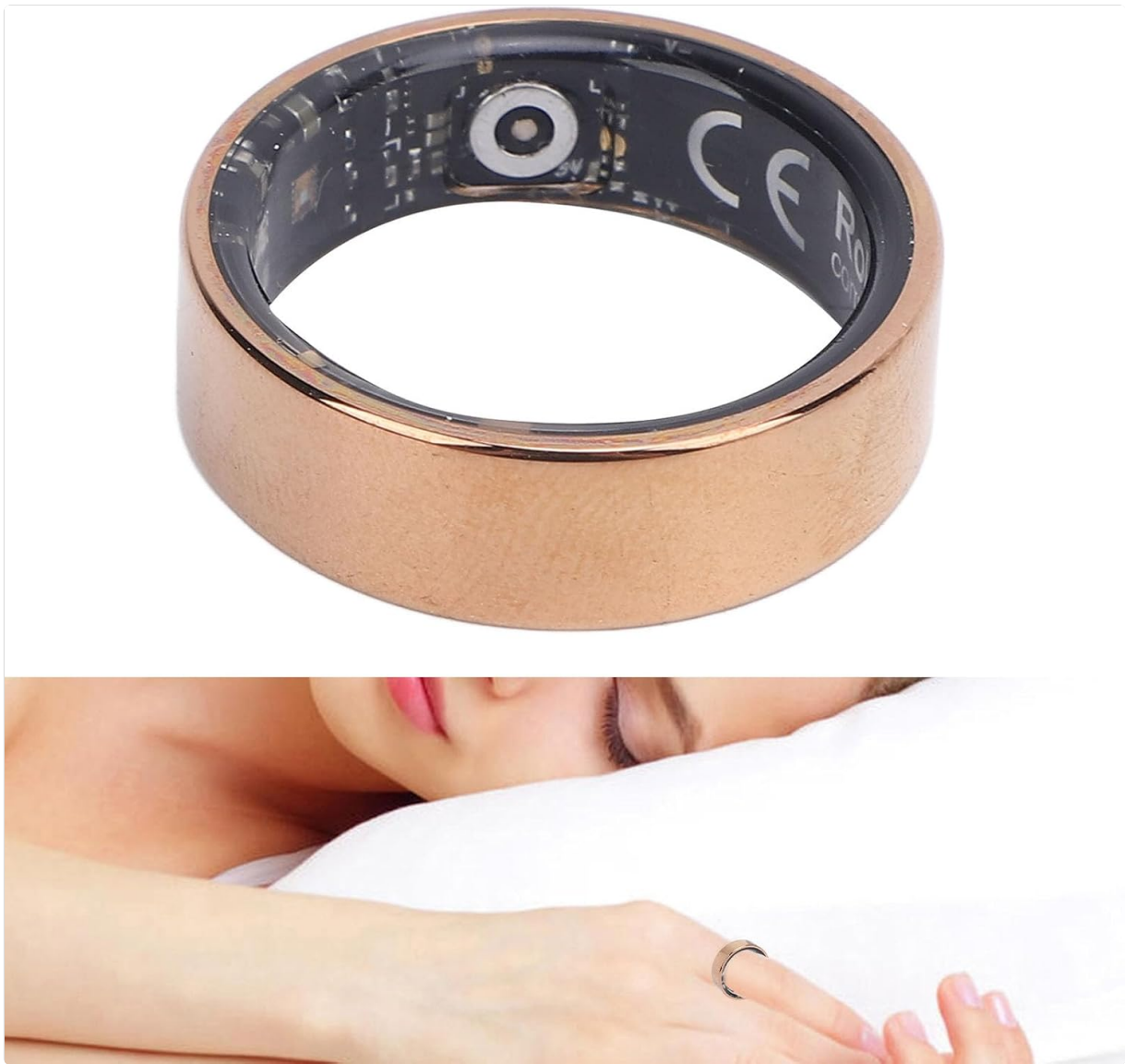
Image: The Smart Health Ring being worn during sleep for monitoring.