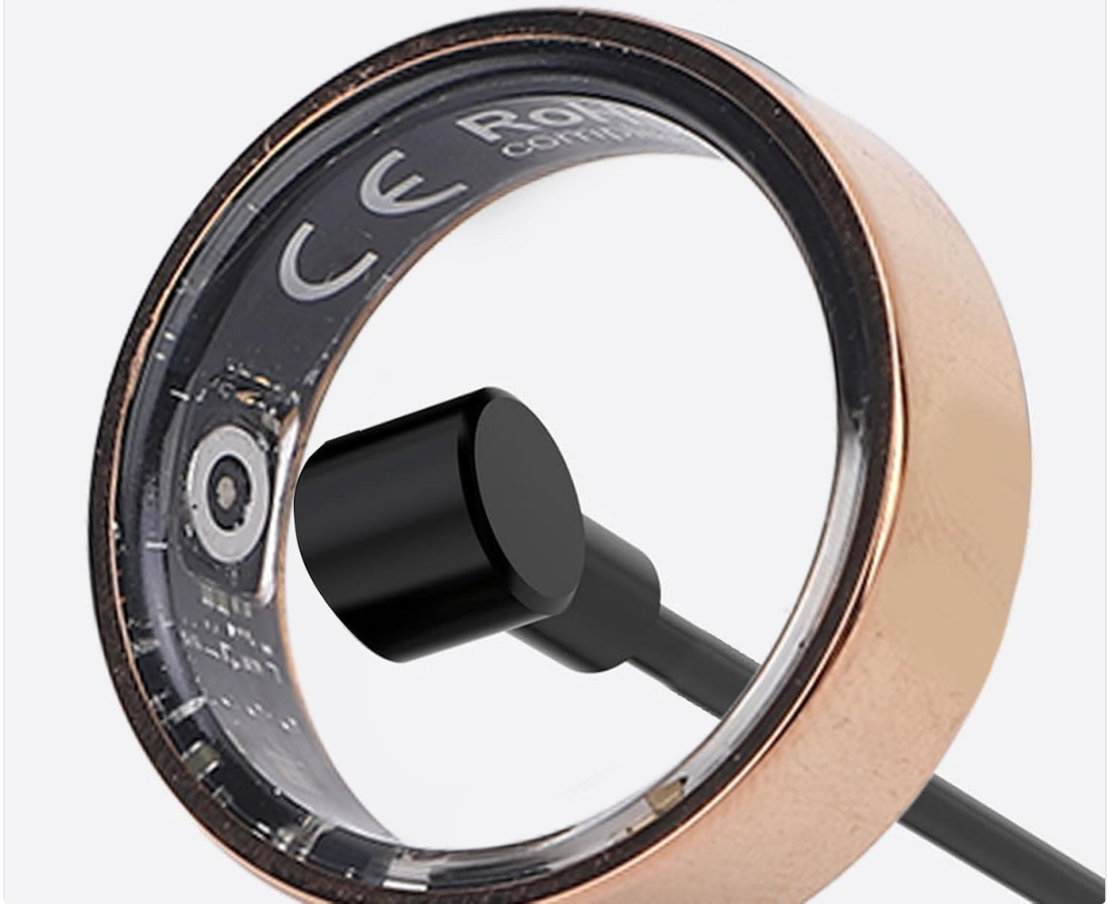
Image: The Smart Health Ring connected to its magnetic charging cable.