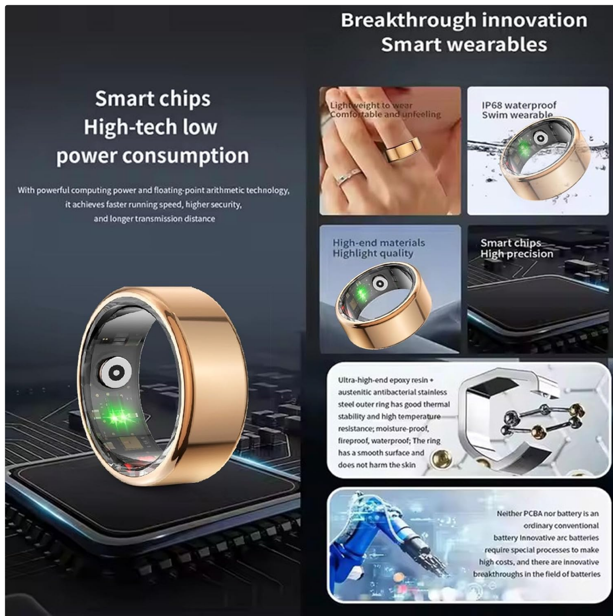
Image: Overview of the Smart Health Ring's features, including its smart chip technology, IP68 water resistance, and durable materials.