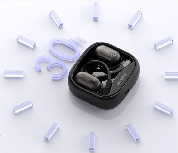
Image: An illustration detailing the battery performance, showing 1.5 hours for a full charge, 8 hours of listening time for the earbuds, and a total of 30 hours with the charging case.