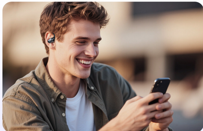
Image: Two individuals engaged in conversation, illustrating the Free Speak Mode where the earbuds automatically detect

With the same translation machine, each person click the mobile translation button to start speaking, one click speaks one sentence, automatically recognize the sentence, and the mobile phone speaker will output the translation sound.