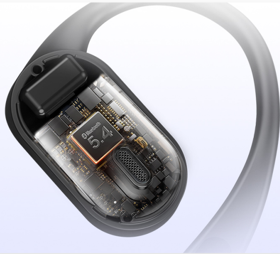
Image: A close-up view of the earbud's internal components, highlighting the Bluetooth 5.4 chip, indicating its role in providing a fast and stable wireless connection.

Uses advanced 5.4 Bluetooth technology to ensure ERAZER XF38 earbuds a low latency and stable connection.