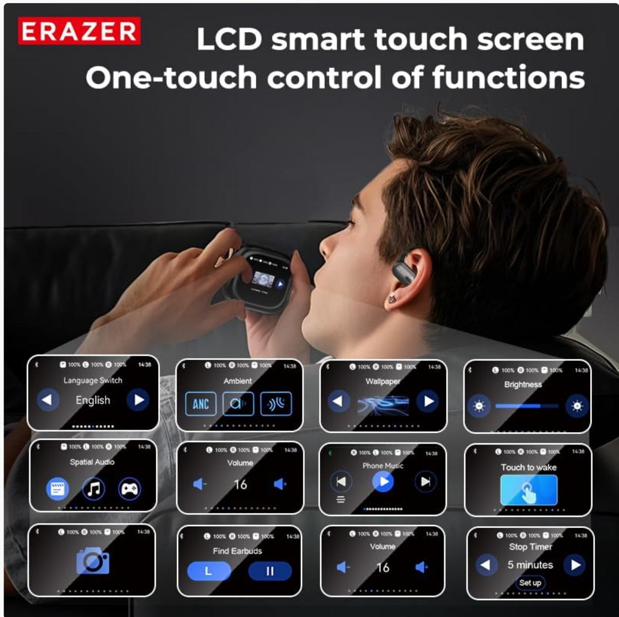
Image: A user interacting with the smart touchscreen charging case, demonstrating its various functions like language switching, ambient sound control, wallpaper selection, brightness adjustment, volume control, music playback, camera remote, and earbud location.