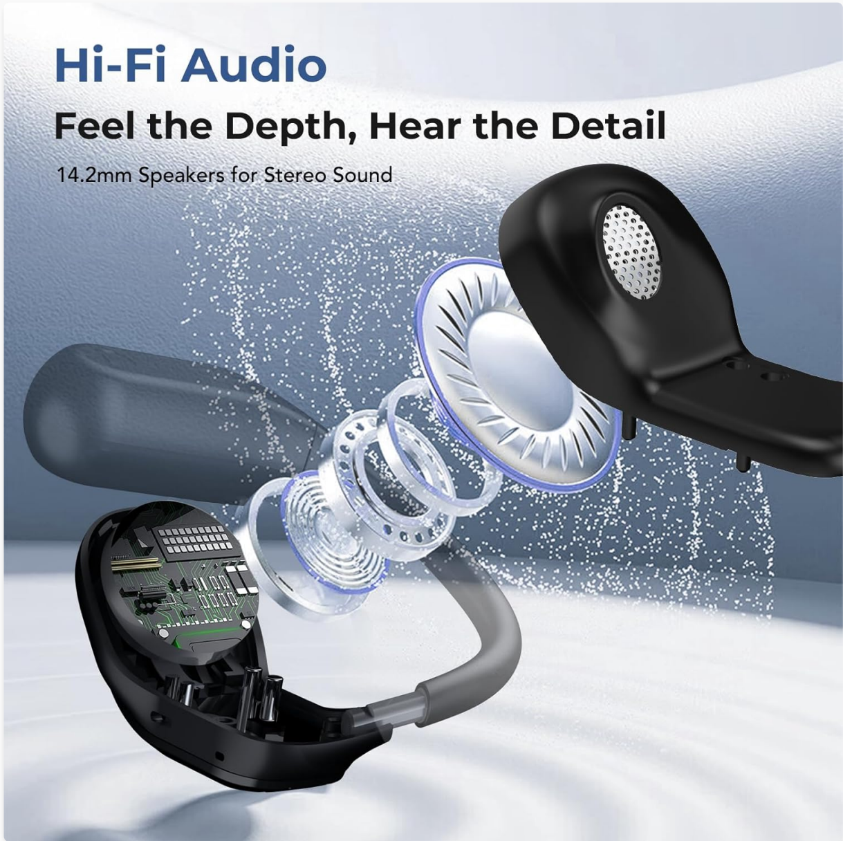
Image: An exploded diagram of an ERAZER XF38 earbud, revealing its internal Hi-Fi audio components, specifically highlighting the 14.2mm speakers designed for rich stereo sound.