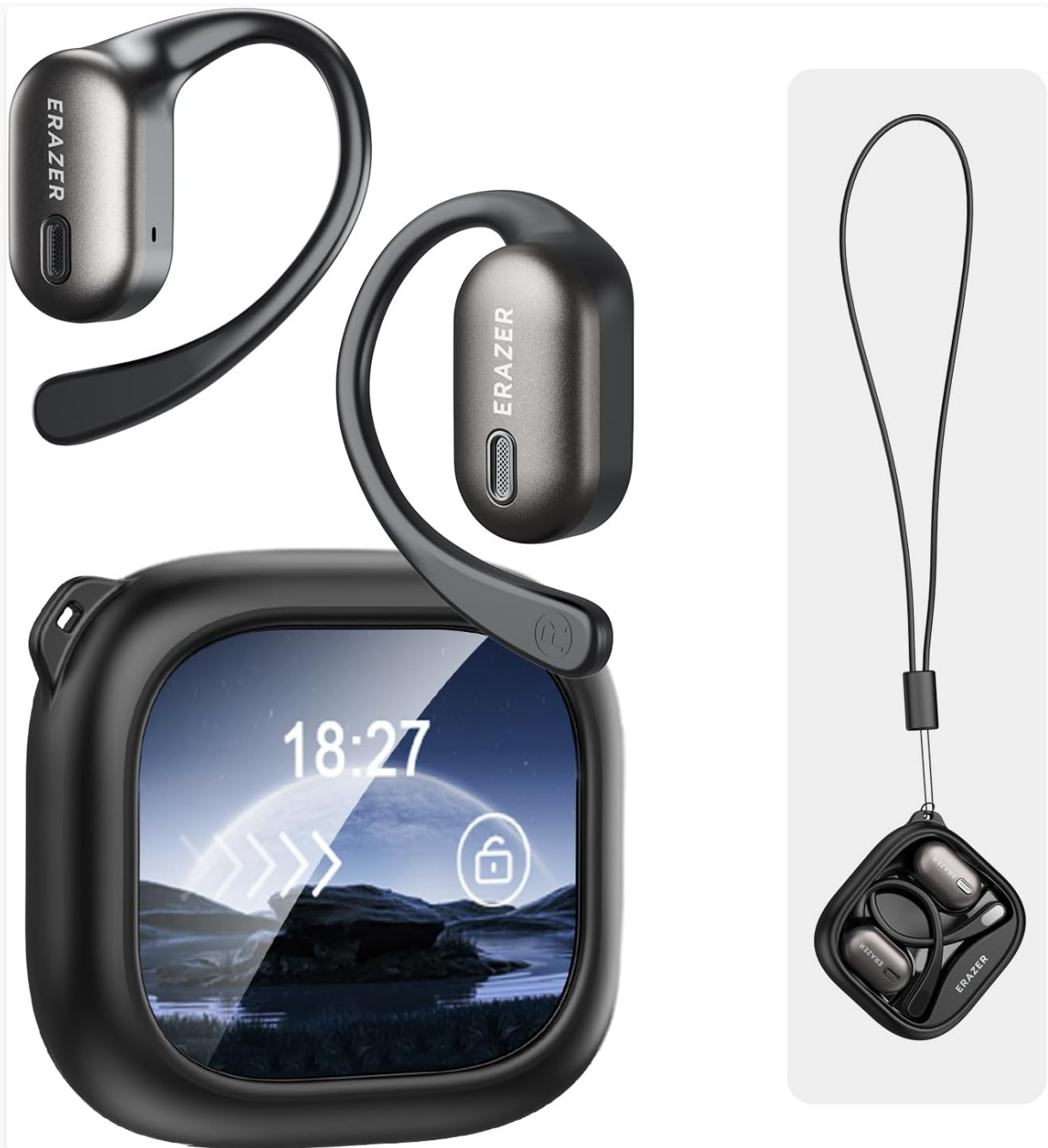
Image: The ERAZER XF38 AI Translation Earbuds, showcasing their over-the-ear design, alongside the smart touchscreen charging case and an attached lanyard.