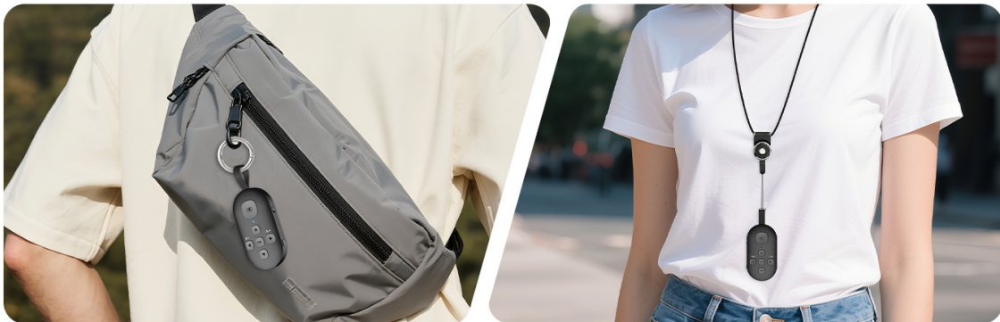
Image: The SEANCHEER R1 remote control demonstrated with its carabiner attached to a bag and worn with a lanyard around the neck, showcasing its portable design.