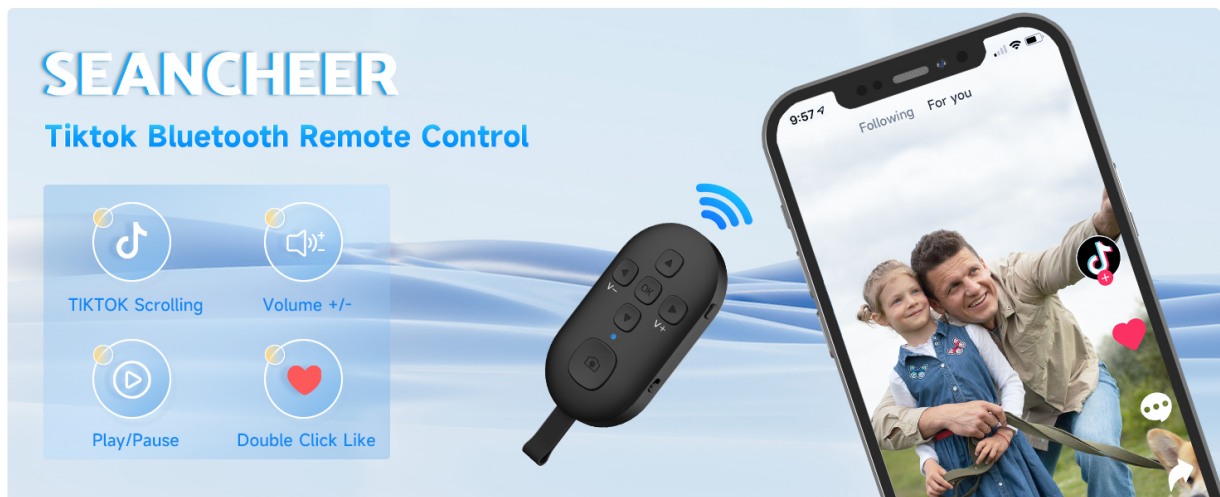
Image: A user comfortably scrolling through TikTok videos on their smartphone using the SEANCHEER R1 remote control, demonstrating hands-free operation.

This manual provides comprehensive instructions for the setup, operation, and maintenance of your SEANCHEER R1 Bluetooth Remote Control. This device is designed to enhance your mobile experience by offering remote control functionalities for TikTok scrolling, Kindle app page turning, and smartphone camera shutter activation. Please read this manual carefully before using the product to ensure optimal performance and longevity.