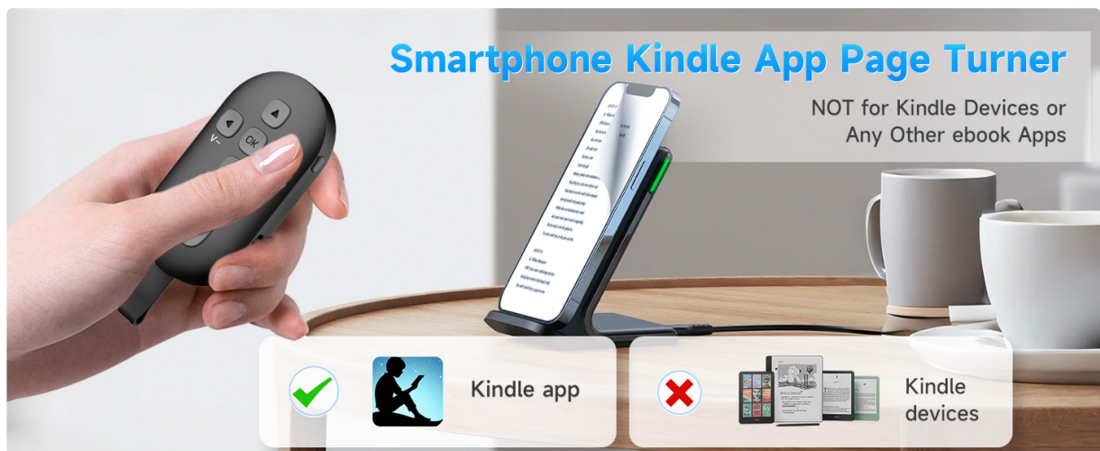
Image: The SEANCHEER R1 remote control shown alongside a smartphone displaying the Kindle app, indicating compatibility with the Kindle app but not with dedicated Kindle devices.

Use the remote to turn pages in the Kindle app on your smartphone.