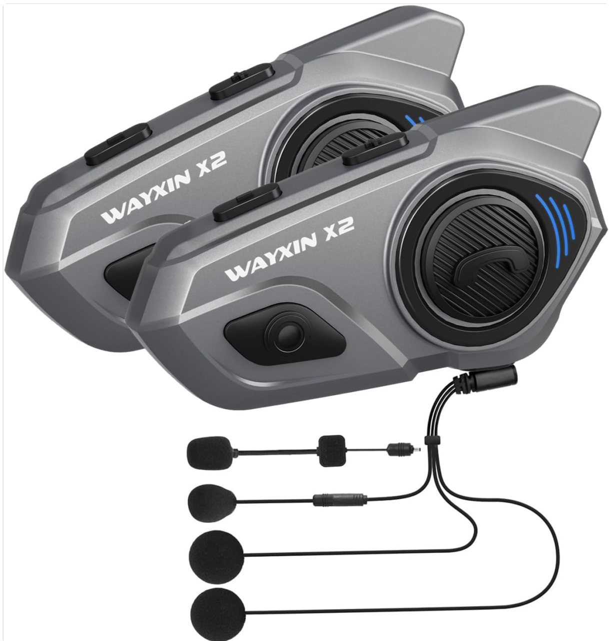
Image: Two WAYXIN X2 intercom units shown with attached speakers and microphones, illustrating the typical contents of a dual pack.