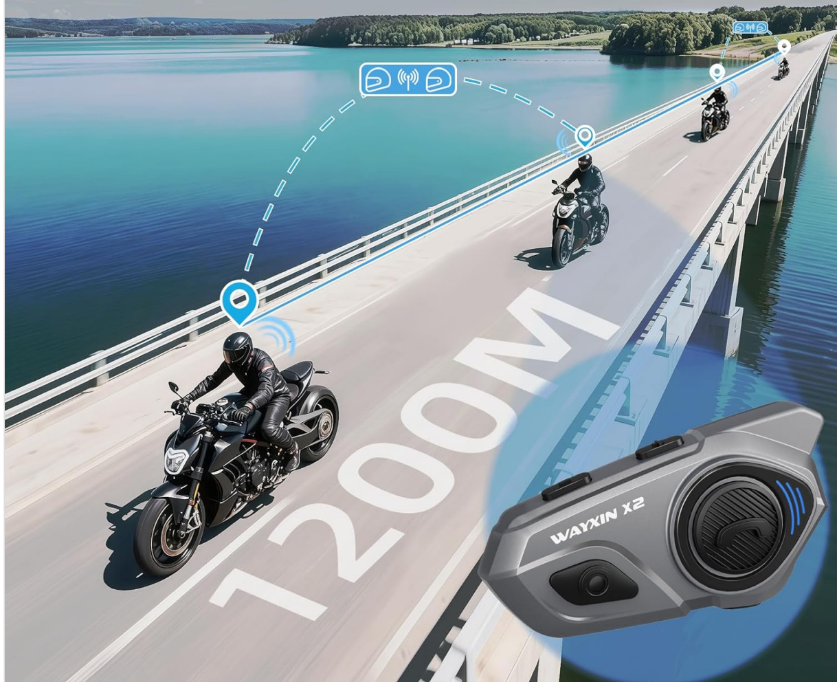
Image: Close-up view of the WAYXIN X2 intercom unit, highlighting its compact design and main control button.

Klare und stabile Anrufübertragung in komplexem Gelände