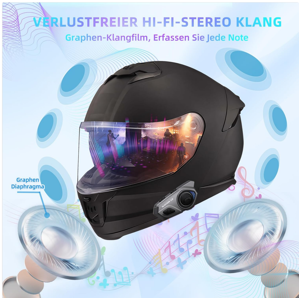
Image: A WAYXIN X2 intercom unit securely mounted on the side of a motorcycle helmet, demonstrating its low-profile design.