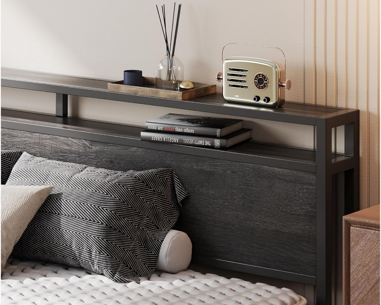
Image: The 2-tier storage headboard provides convenient shelving for personal items.