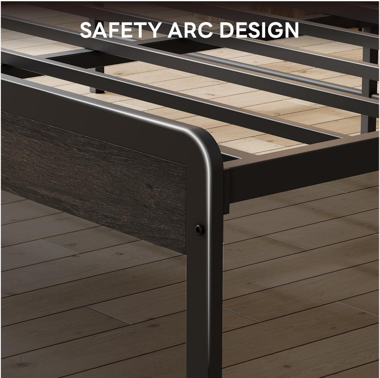
Image: The safety arc design on the frame corners for enhanced user safety.