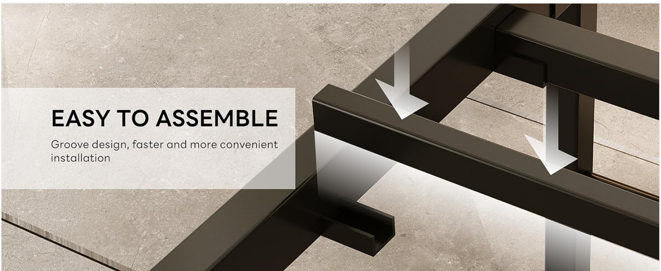
Image: Visual guide for the assembly process, highlighting ease of construction.