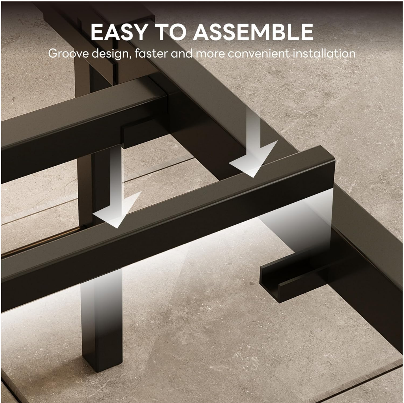
Image: The groove design facilitates faster and more convenient installation.