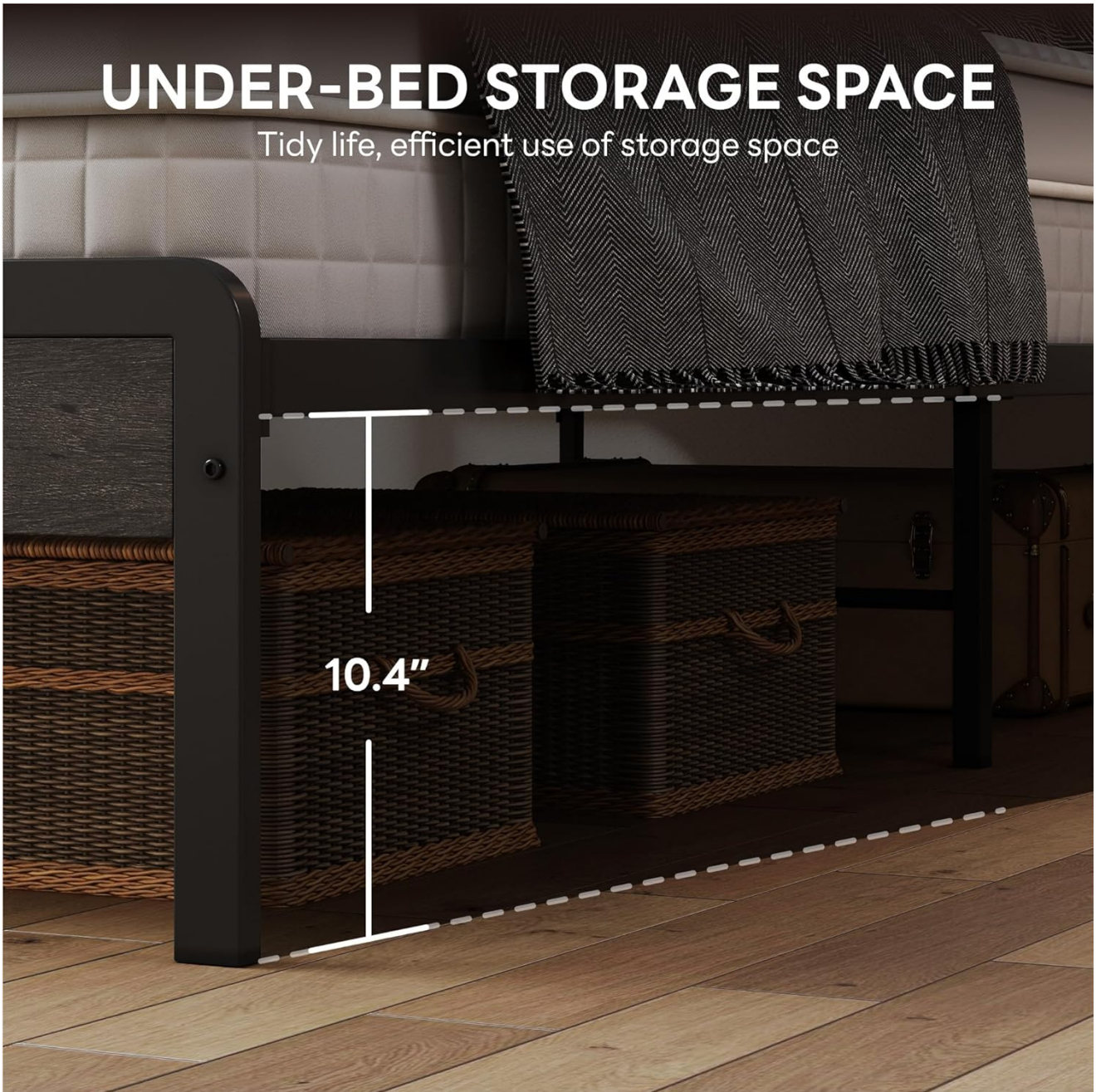
Image: Visual representation of the 10.4-inch under-bed clearance for storage.

Tidy life, efficient use of storage space