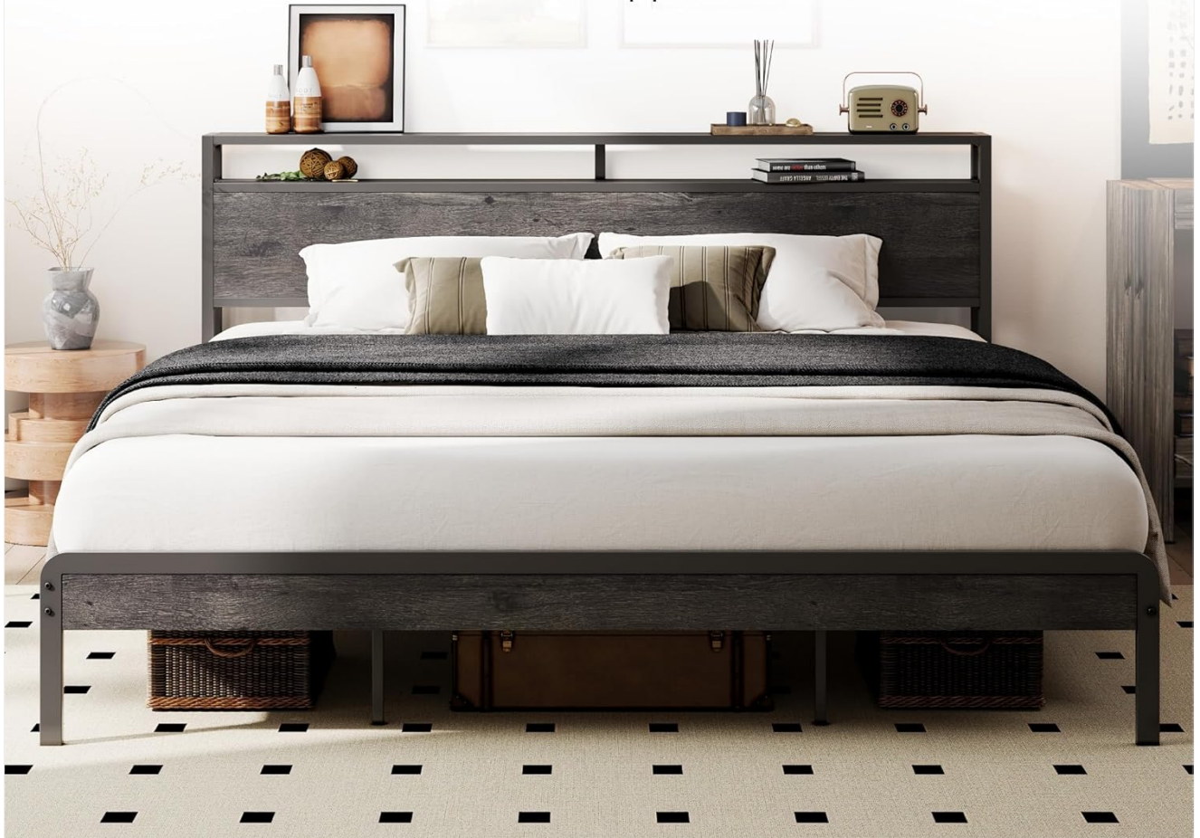
Image: Key features including the classic color, strong metal support, and arc protection.