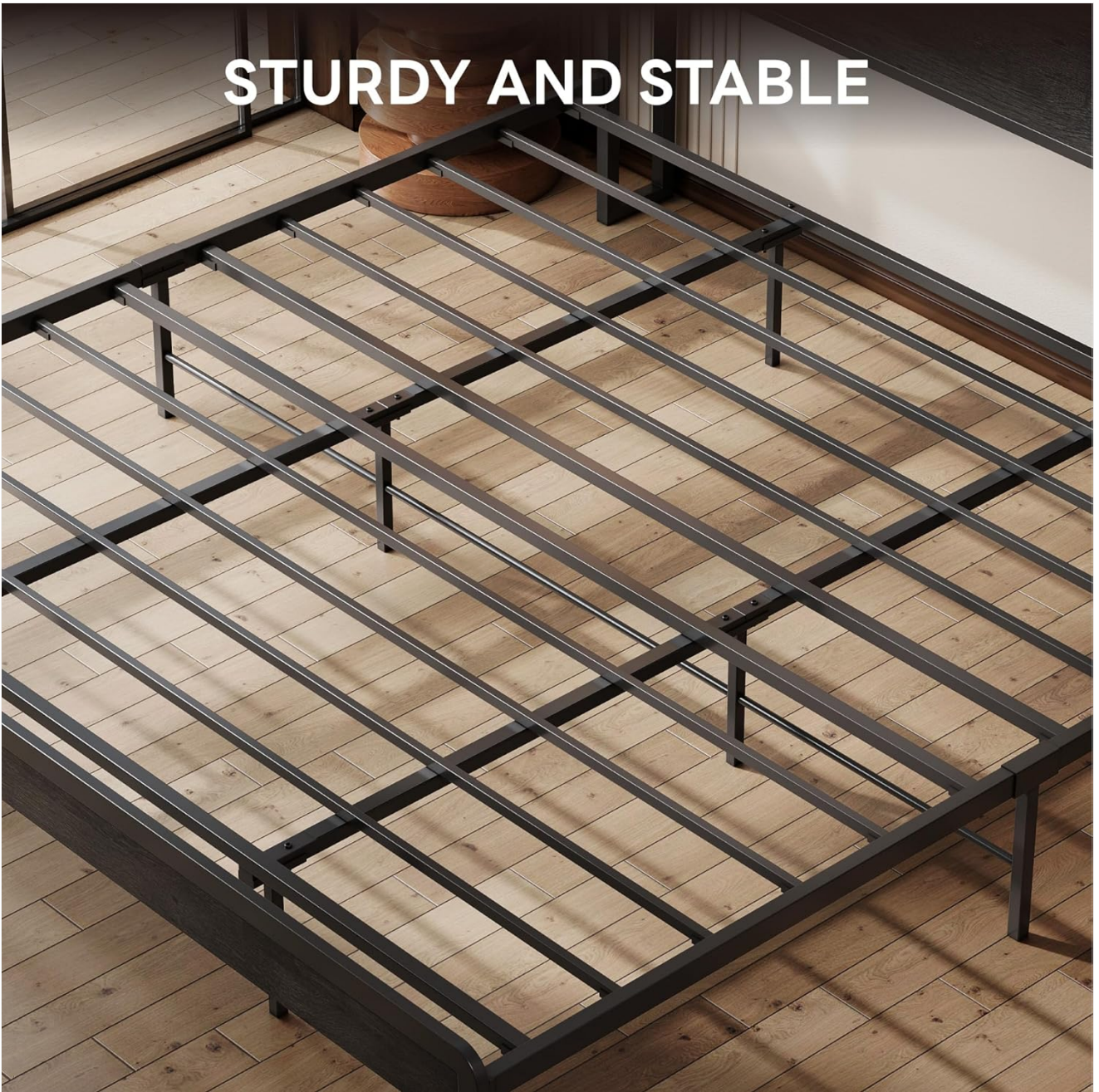
Image: The sturdy and stable metal slat system providing robust mattress support.