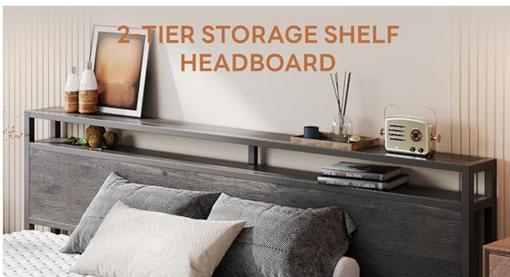
Image: A closer look at the functional 2-tier headboard design.