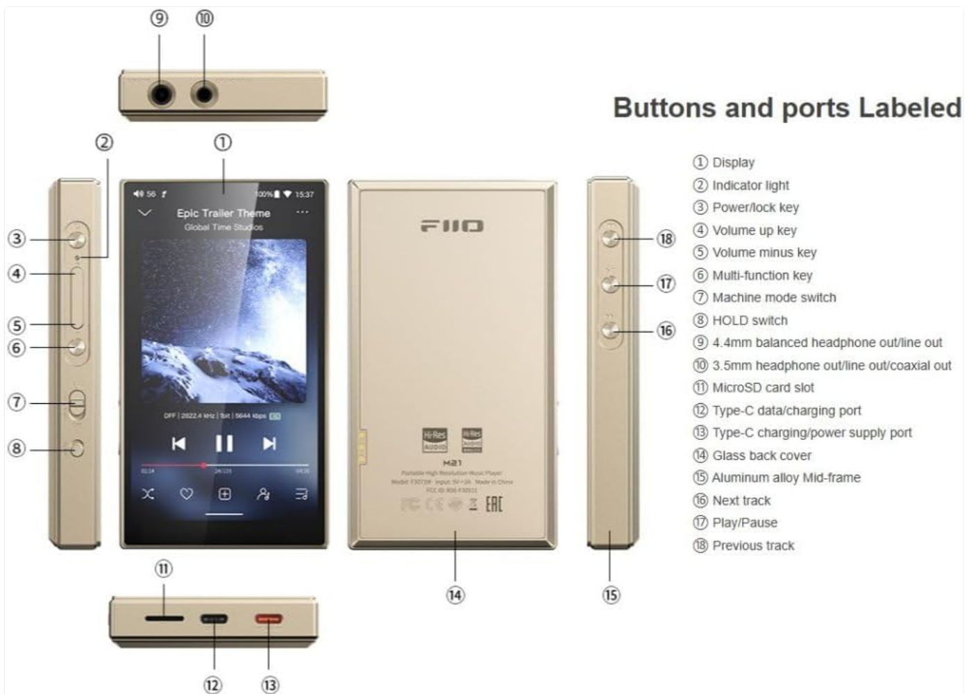
Figure 2.2.1: FiiO M21 with labeled buttons and ports for easy identification.

This image displays the FiiO M21 from multiple angles, highlighting its various buttons, ports, and features. Key components are numbered and correspond to a legend for easy identification. These include the display, indicator light, power/lock key, volume up/minus keys, multi-function key, machine mode switch, HOLD switch, 3.5mm headphone/line out, 4.4mm balanced headphone/line out/coaxial out, microSD card slot, Type-C data/charging port, Type-C charging/power supply port, glass back cover, aluminum alloy mid-frame, next track, play/pause, and previous track buttons.