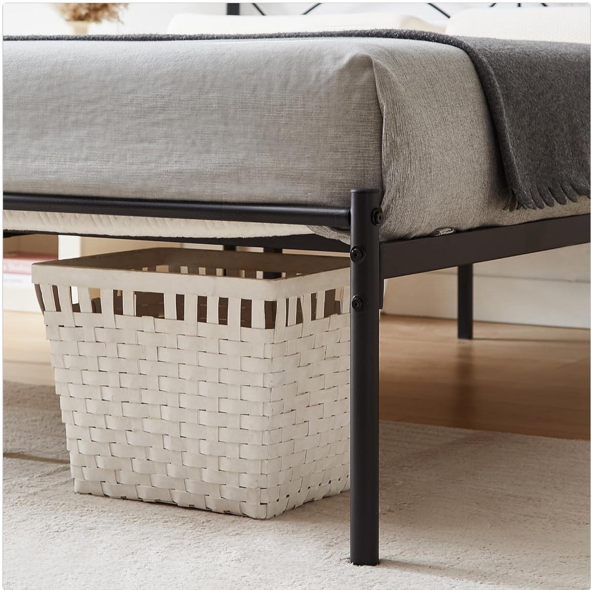
Image: A view of the under-bed storage space, showing a woven basket fitting comfortably beneath the frame.