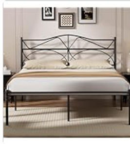
Image: Illustration showing the anti-slip feature of the bed frame, designed to prevent the mattress from sliding.

Image: Close-up view of a bed frame leg with a round, smooth top, highlighting the absence of sharp edges for safety.