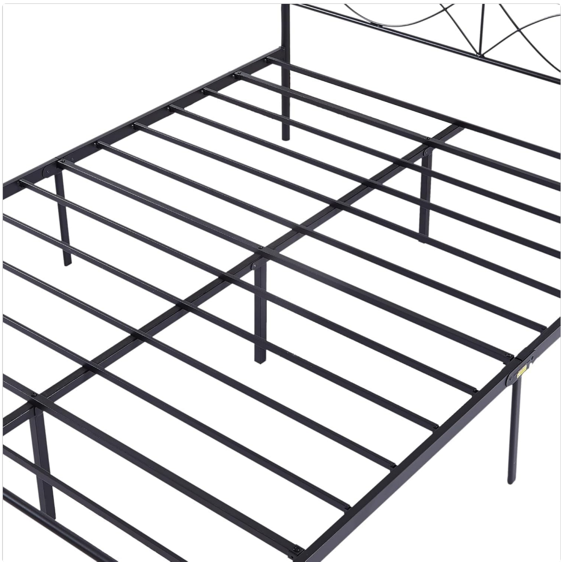
Image: Close-up view of the metal slat support system of the bed frame, showing the sturdy construction.