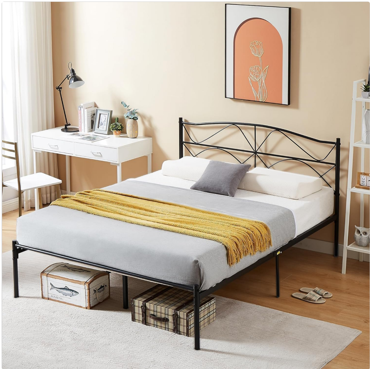
Image: Fully assembled VECELO Full Size Metal Bed Frame with a mattress and bedding in a bedroom setting.