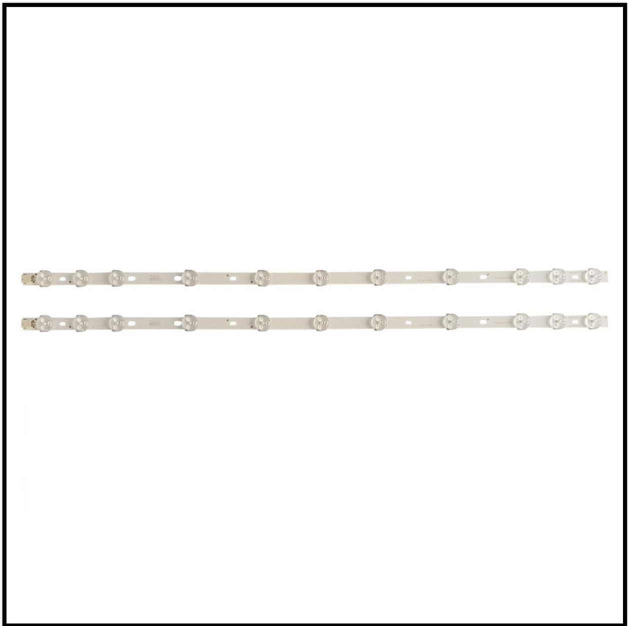
Image 1.1: The Generico LED TV Backlight Bar Replacement Kit, showing the two individual LED bars included in the package.