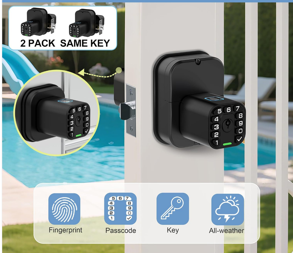
Image: The Richelock IU53 lock showcasing dual-sided smart access features including fingerprint, passcode, key, and all-weather capability.