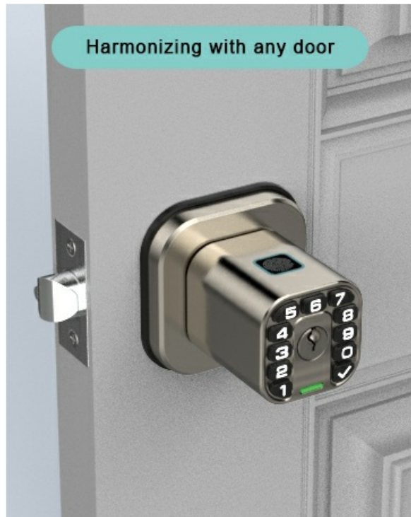
Image: A detailed view of the lock's keypad and fingerprint sensor, highlighting its robust construction.