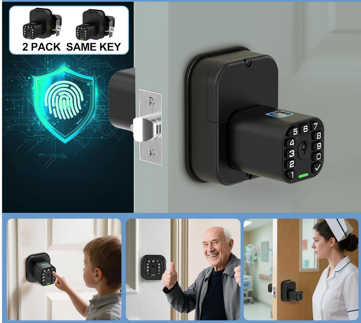
Image: Illustrates the lock's benefit for families, showing a child using the fingerprint scanner, an elderly person, and a caregiver, highlighting its use for securing vulnerable individuals.