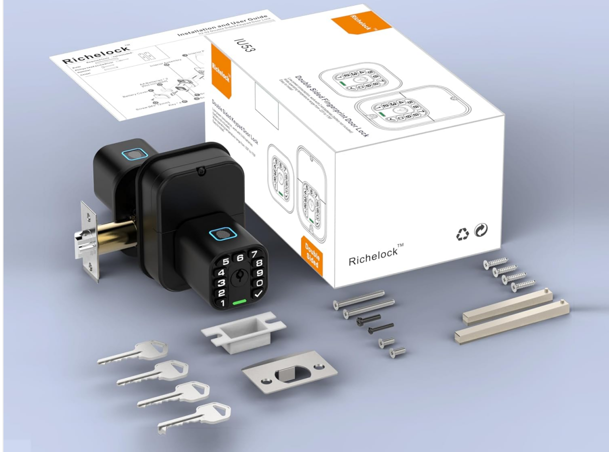
Image: A visual representation of all items included in the Richelock IU53 package, such as the lock units, keys, screws, and manuals. Note: 2 AA batteries are not included.