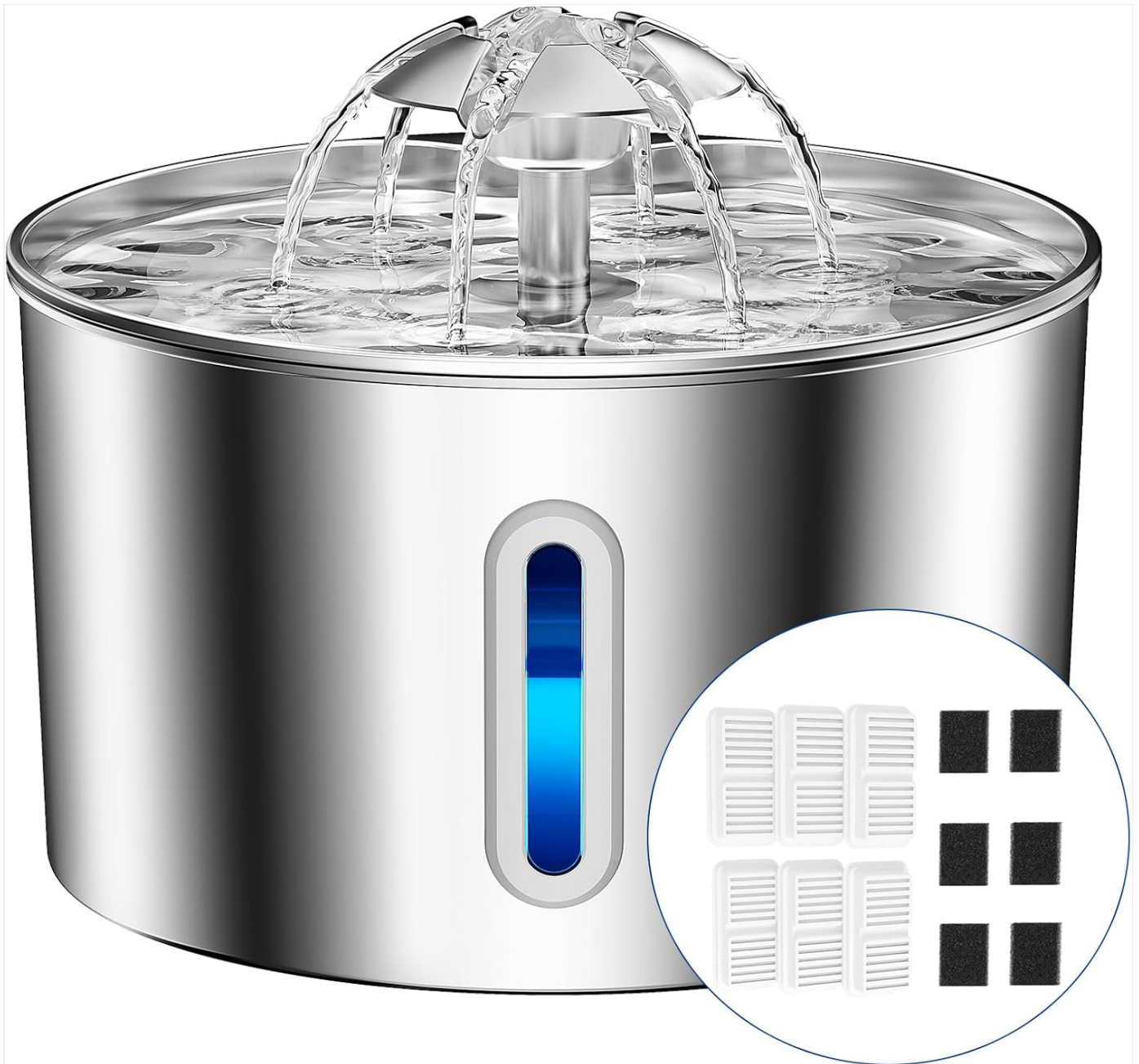
Image: BalimoPet Stainless Steel Cat Water Fountain with flower spout and included filter sponges.