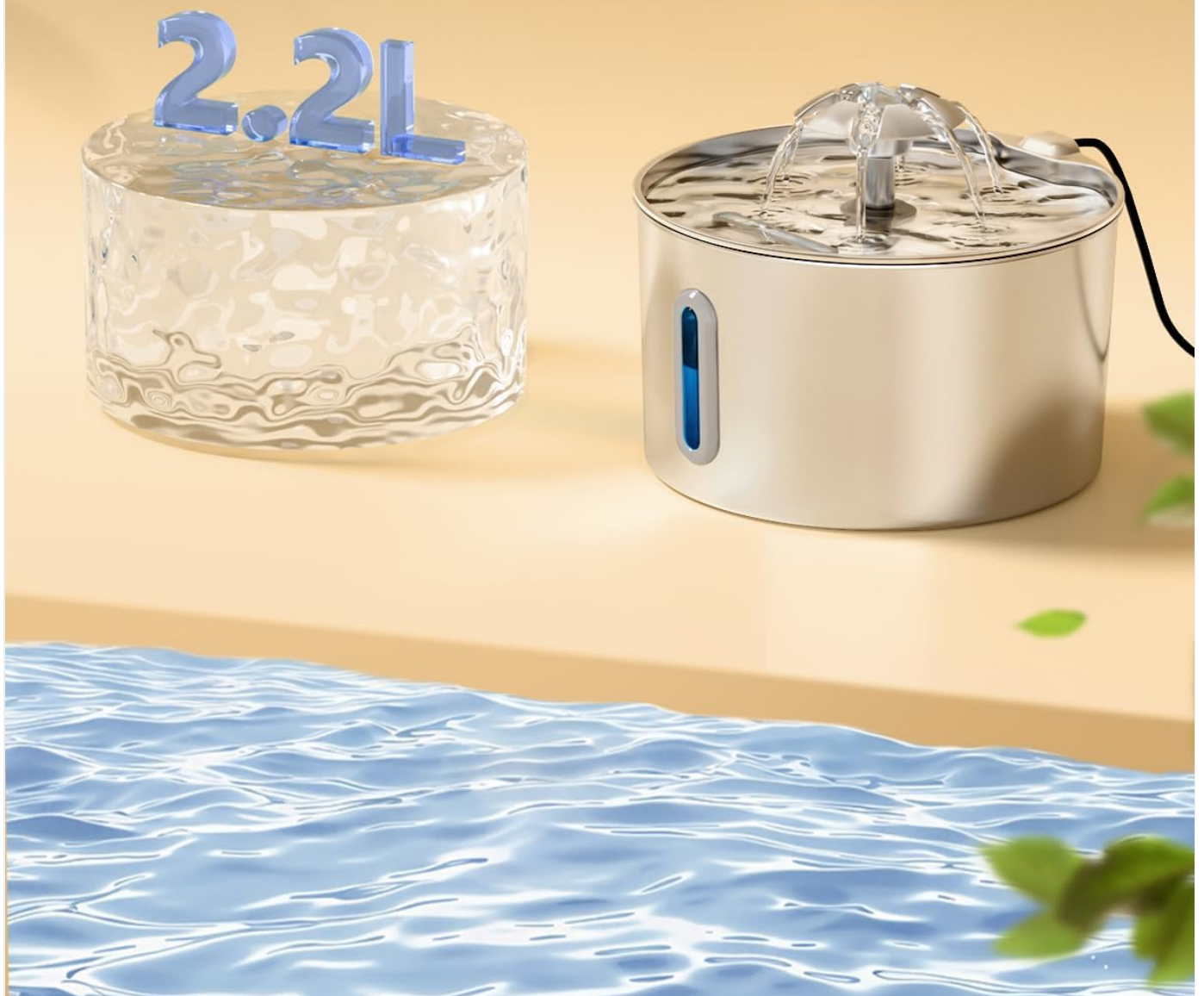
Image: The 2.2L capacity ensures a sufficient water supply for your pet.

Support a 5kg adult cats drinking water for 7 day