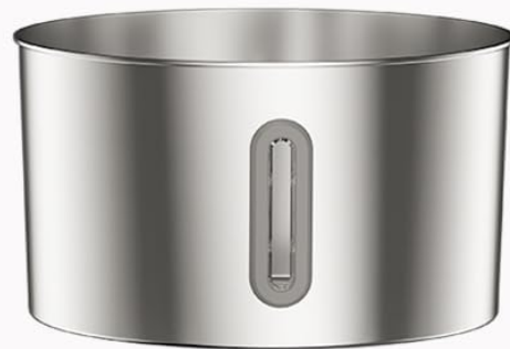
Stainless Steel Water Tank