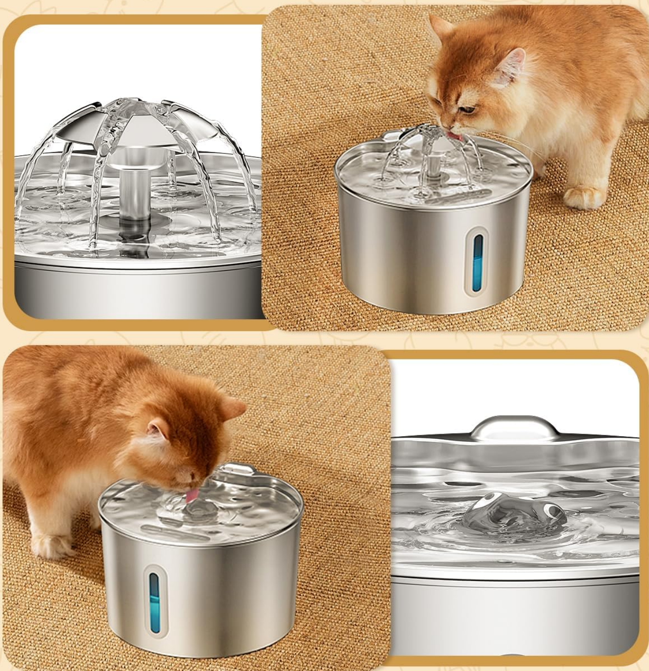
Image: The fountain offers dual water flow modes to encourage pets to drink more.

Flowing water can attract cats to drink more water