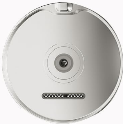
Stainless Steel Water Tray