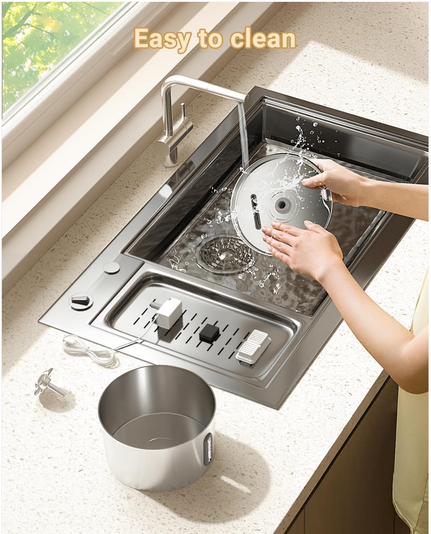
Image: The fountain's components are designed for easy disassembly and cleaning.