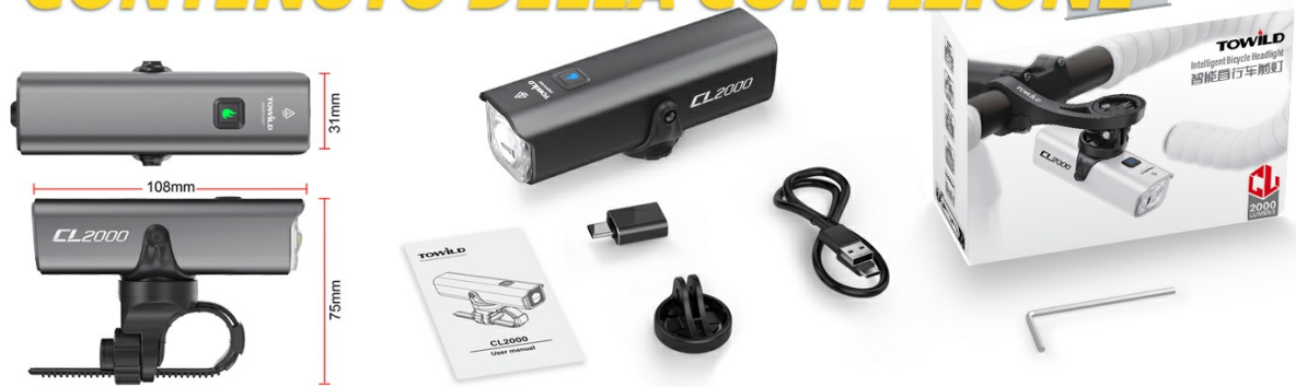
Visual representation of the CL2000 package contents, including the light, cable, mount, and manual.