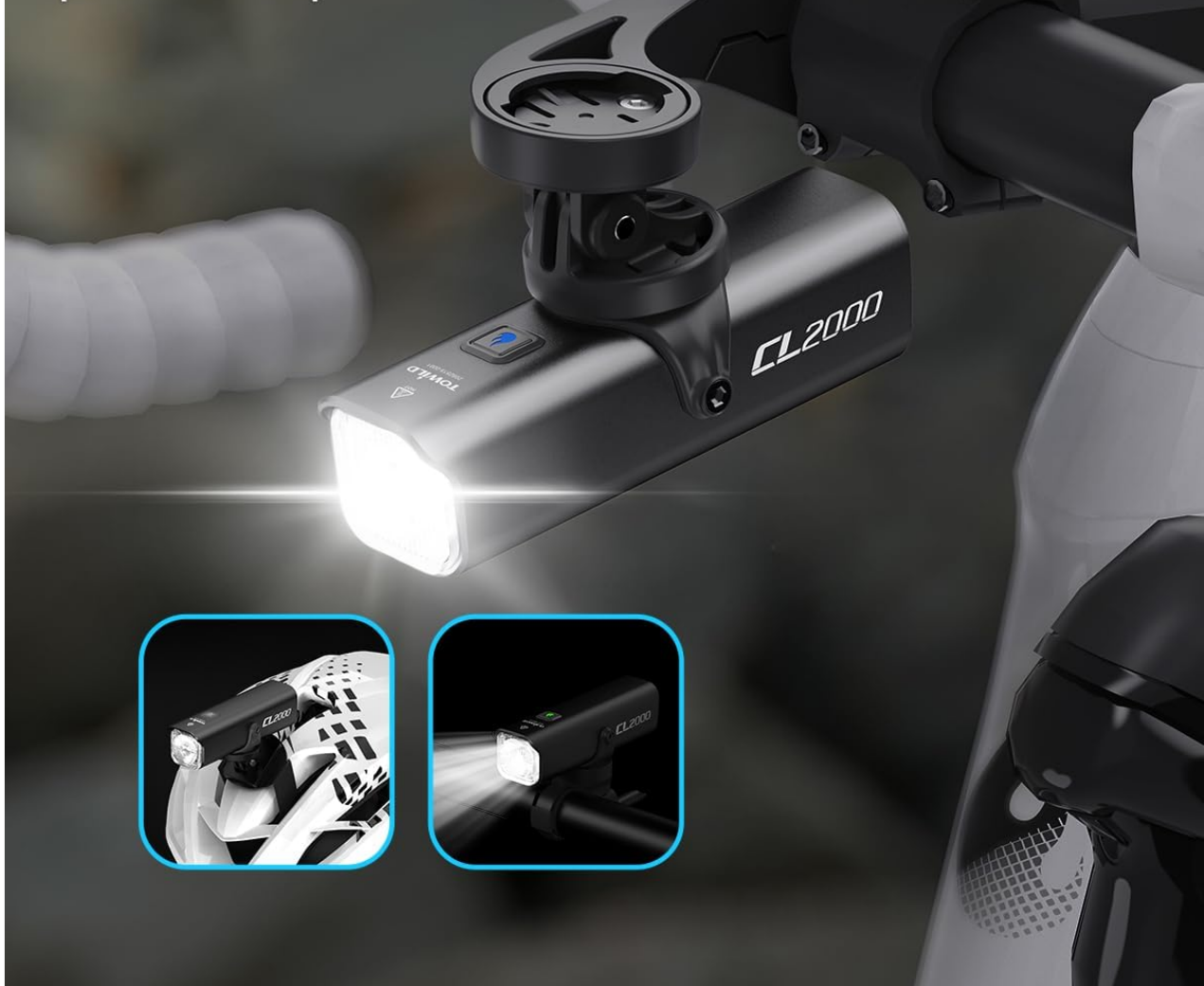
Image showing the versatile mounting options, including suspension mounting under the handlebar or on a helmet.

Installazione manuale senza attrezzi, adatta a posizioni superiore/inferiore del manubrio e casco.