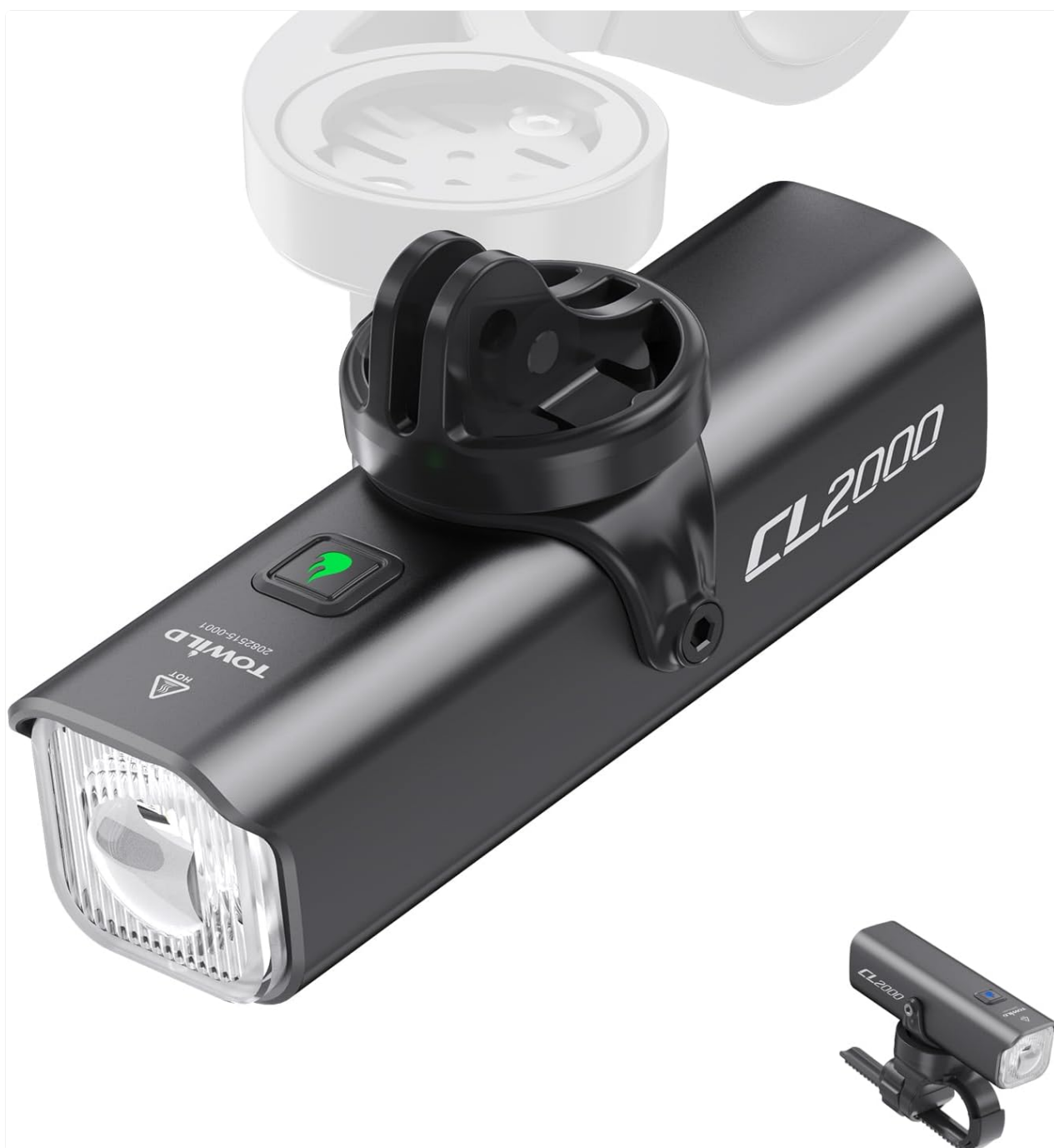
The TOWILD CL2000 bicycle light with its mounting bracket.