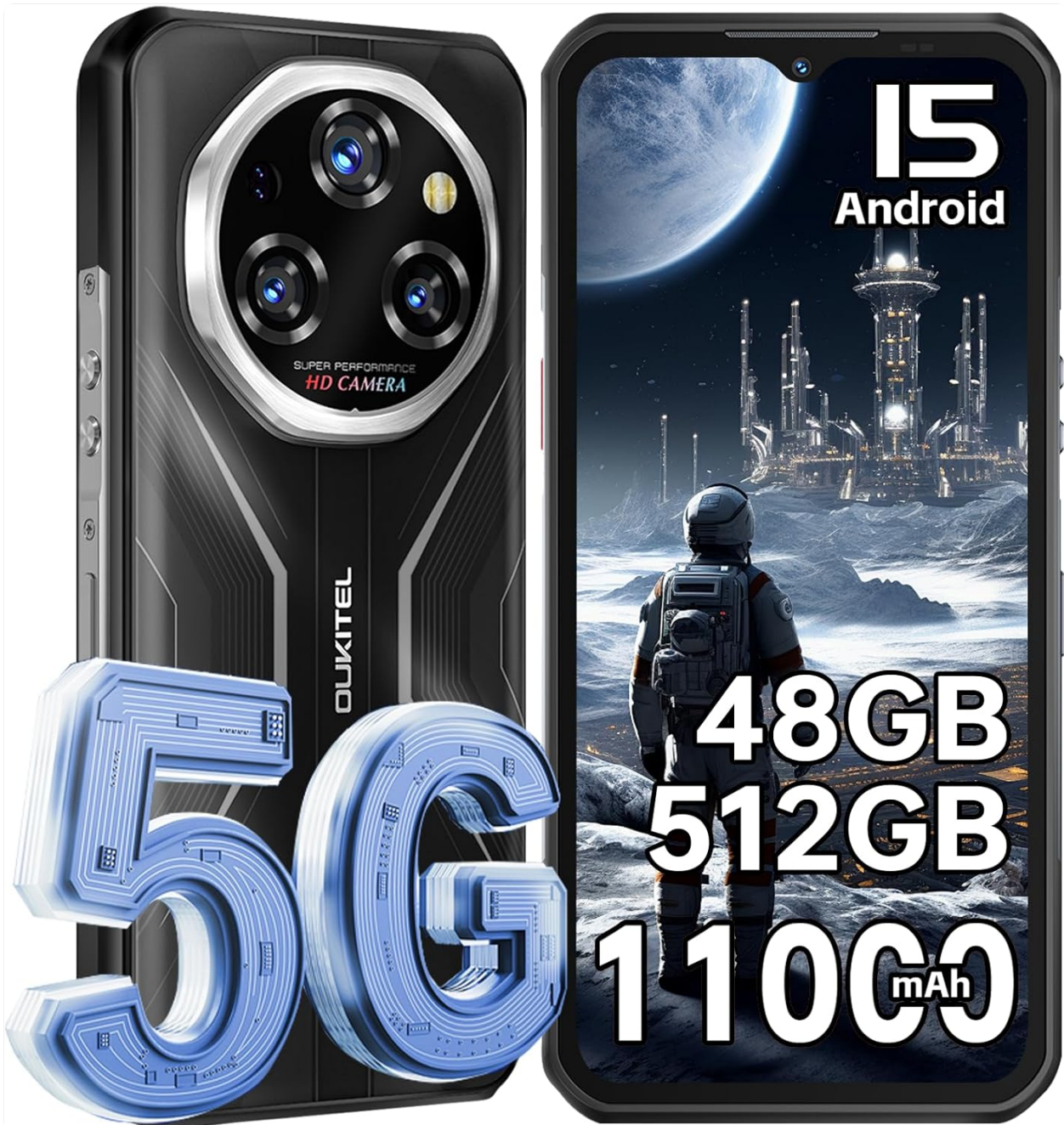
Image: Front and rear view of the OUKITEL WP55 Pro 5G Rugged Smartphone, highlighting its robust design and camera module.

Familiarize yourself with the physical components of your OUKITEL WP55 Pro.