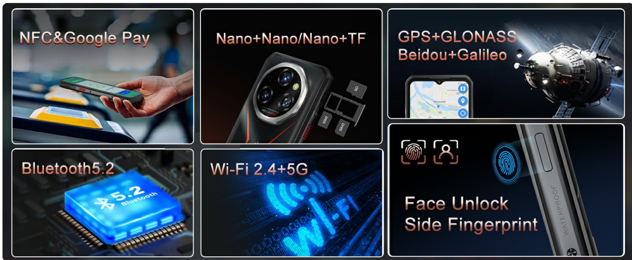
Image: Icons and illustrations representing the OUKITEL WP55 Pro's connectivity features such as NFC, GPS, Bluetooth 5.2, Wi-Fi 2.4/5G, and security options like Face Unlock and Side Fingerprint.