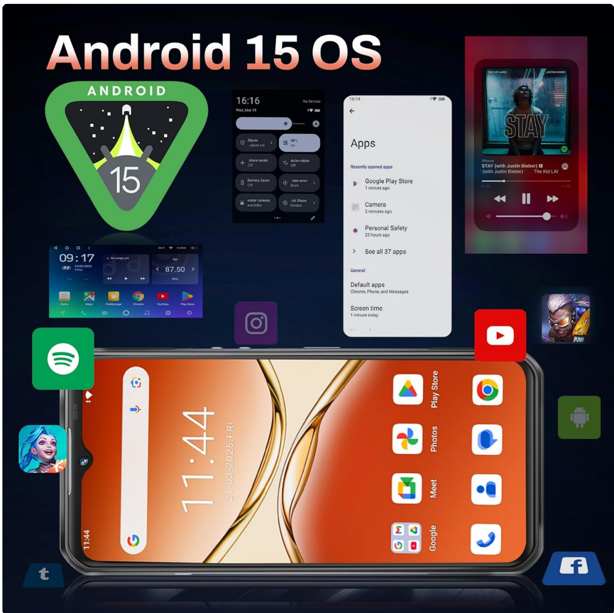
Image: Screenshots of the Android 15 operating system interface on the OUKITEL WP55 Pro, showing various apps and settings.