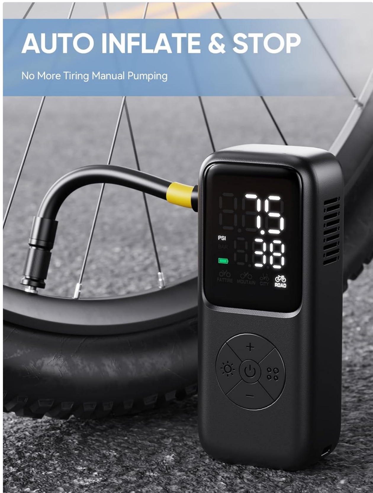
Image: The GPUTEK BL02 pump is compact and lightweight, measuring approximately 13 x 5.3 x 3.5 cm and weighing 230g, making it easy to carry in a pocket or bike bag.

The GPUTEK BL02 pump is designed for portability and ease of use, featuring a clear digital display and intuitive controls.