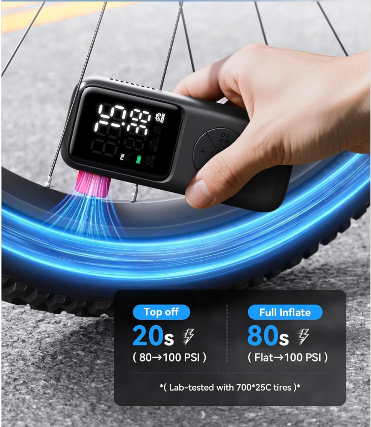
Image: The pump comes with adapters for both Schrader and Presta valves, allowing for hose-mode or direct-fit connections.