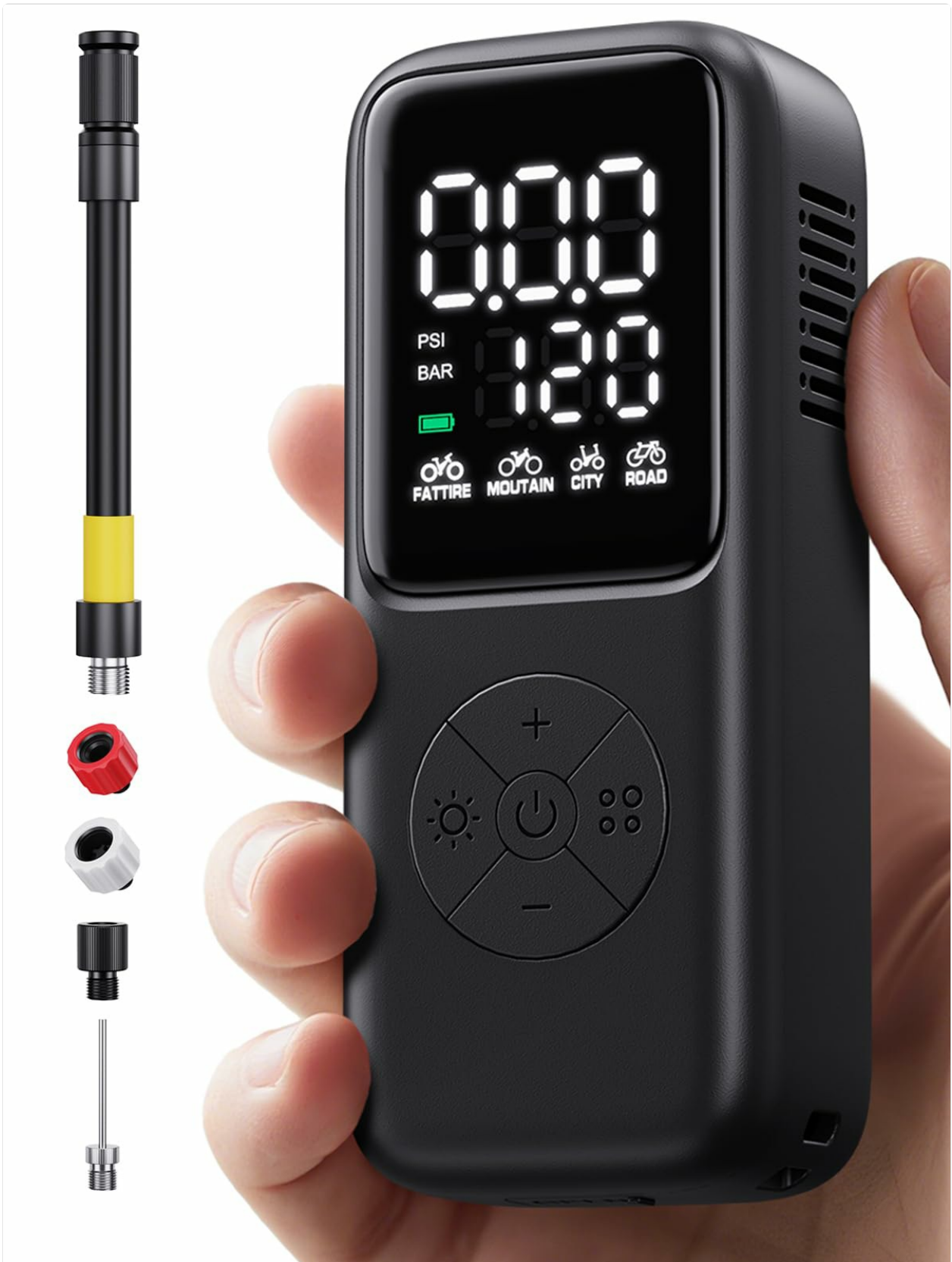
Image: The pump provides powerful and fast inflation, capable of topping off a tire (80 to 100 PSI) in 20 seconds and fully inflating a flat tire (0 to 100 PSI) in 80 seconds (based on 700*25C tires).

Image: The GPUOTEK BL02 pump automatically inflates and stops once the preset target pressure is reached, eliminating manual effort.