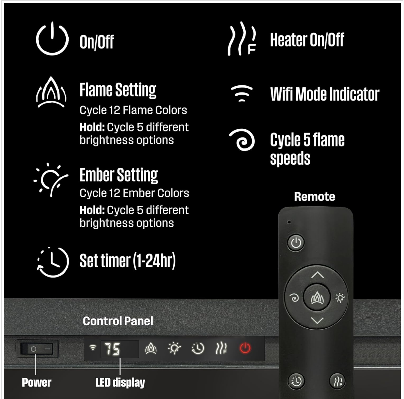
Image: A close-up of the fireplace's control panel and the remote control, detailing buttons for power, heater on/off, flame setting, ember setting, timer, WiFi mode indicator, and flame speed adjustment.

The Westinghouse Electric Fireplace offers multiple ways to control its functions: the control panel on the unit, the included remote control, and a smartphone app compatible with Alexa and Google Home.