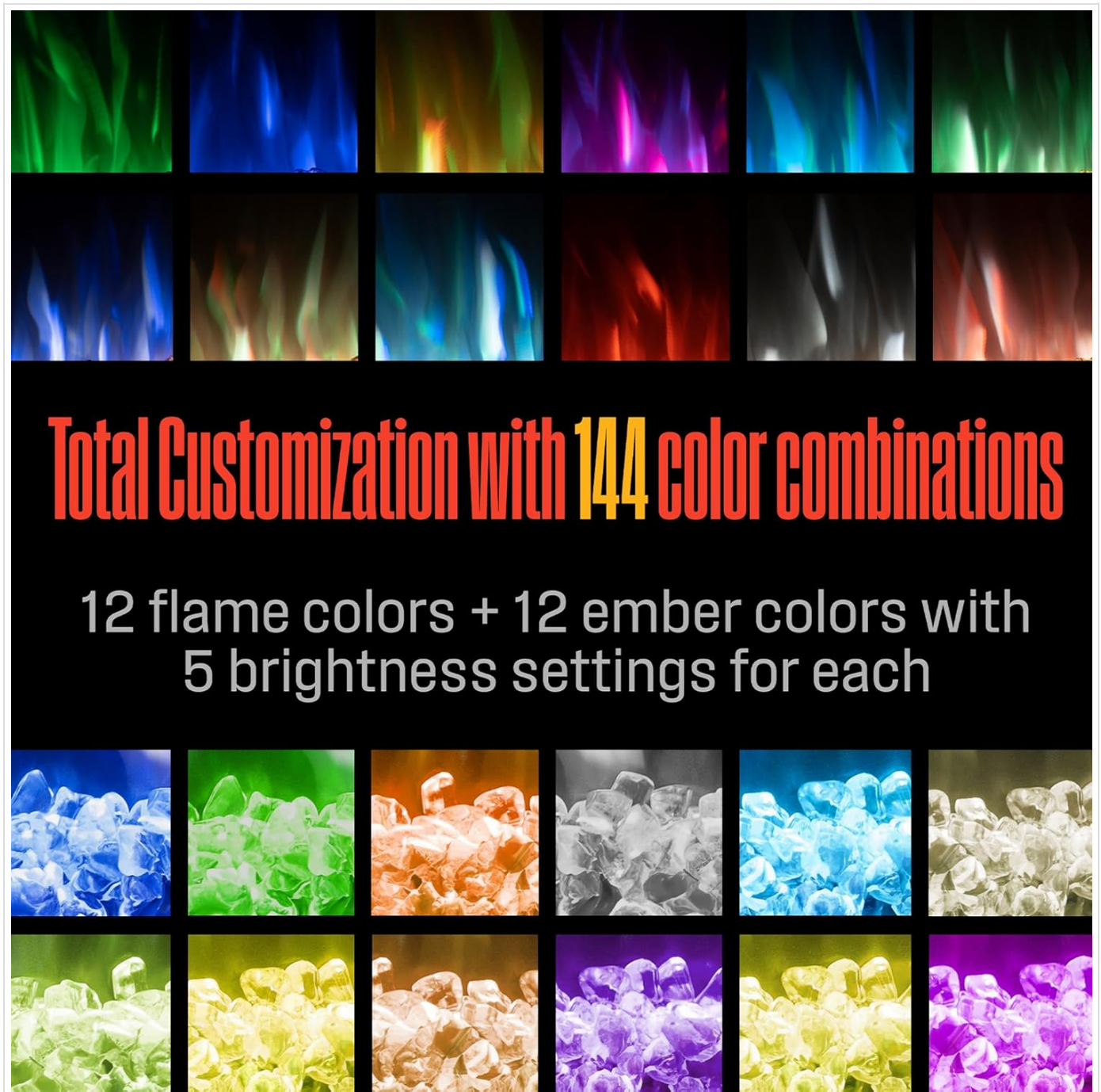
Image: A visual display demonstrating the extensive customization options, showing a grid of various flame and ember color combinations, highlighting the 12 flame colors, 12 ember colors, and 5 brightness settings for each.