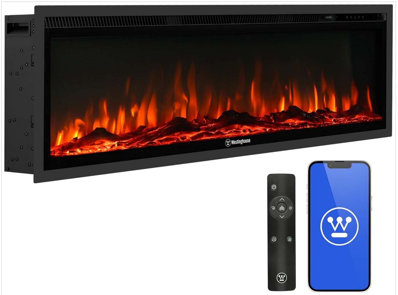
Image: The Westinghouse 50 Inch Electric Fireplace Heater, showcasing its sleek design, accompanied by its remote control and a smartphone displaying the control app icon.