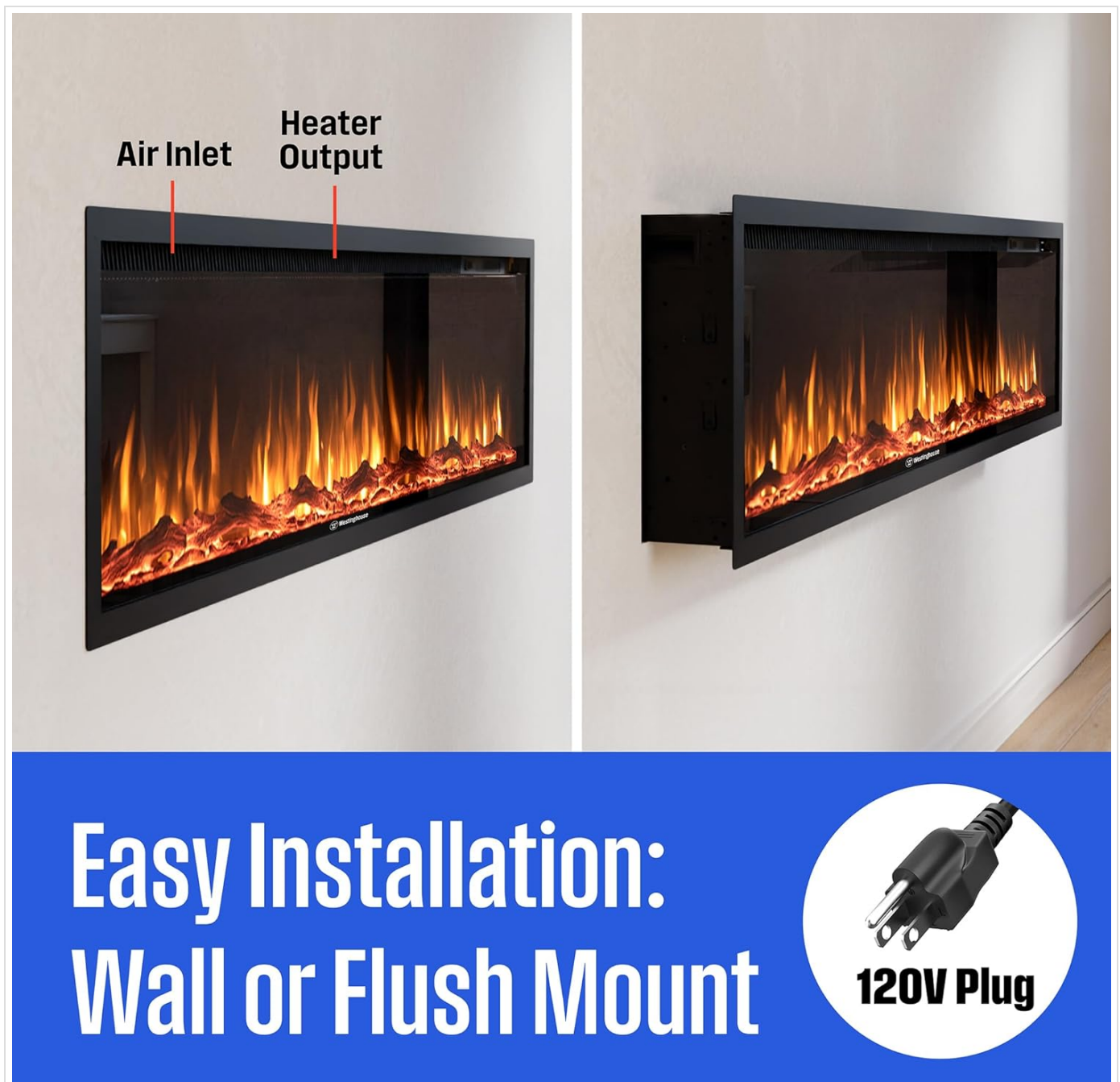
Image: Depiction of the electric fireplace installed in both a wall-mounted configuration and a flush-mounted recessed configuration, highlighting the air inlet and heater output locations, and the 120V plug.