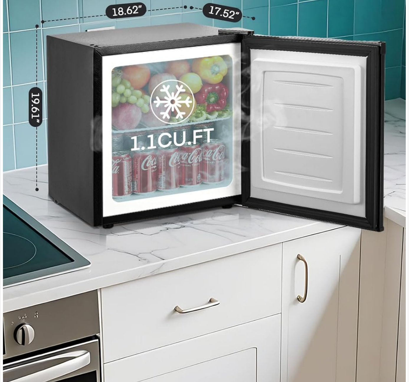
Figure 3: Product dimensions for proper placement: 19.61" H x 18.62" W x 17.52" D.