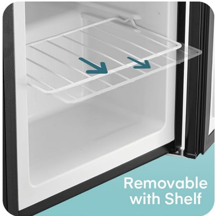
Figure 2: Illustration of key design advantages including the built-in handle, two layers of insulation, adjustable leveling legs, and the removable wire shelf.