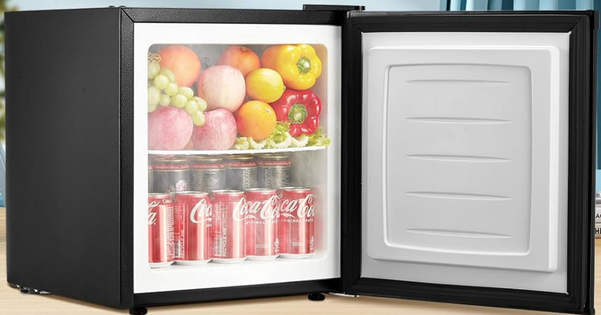
Figure 5: The interior of the freezer, demonstrating its capacity for various items like beverages and small food containers.