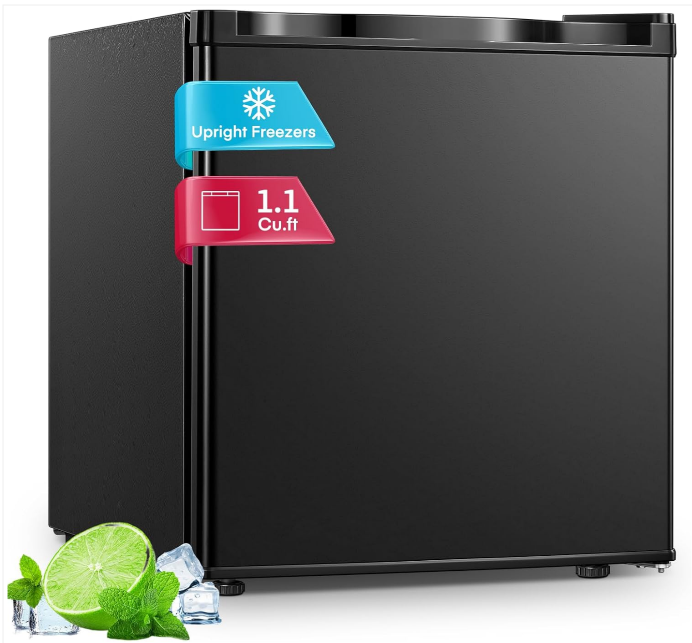
Figure 1: Front view of the FOHERE 1.1 Cu.Ft Mini Freezer, showcasing its compact black design.