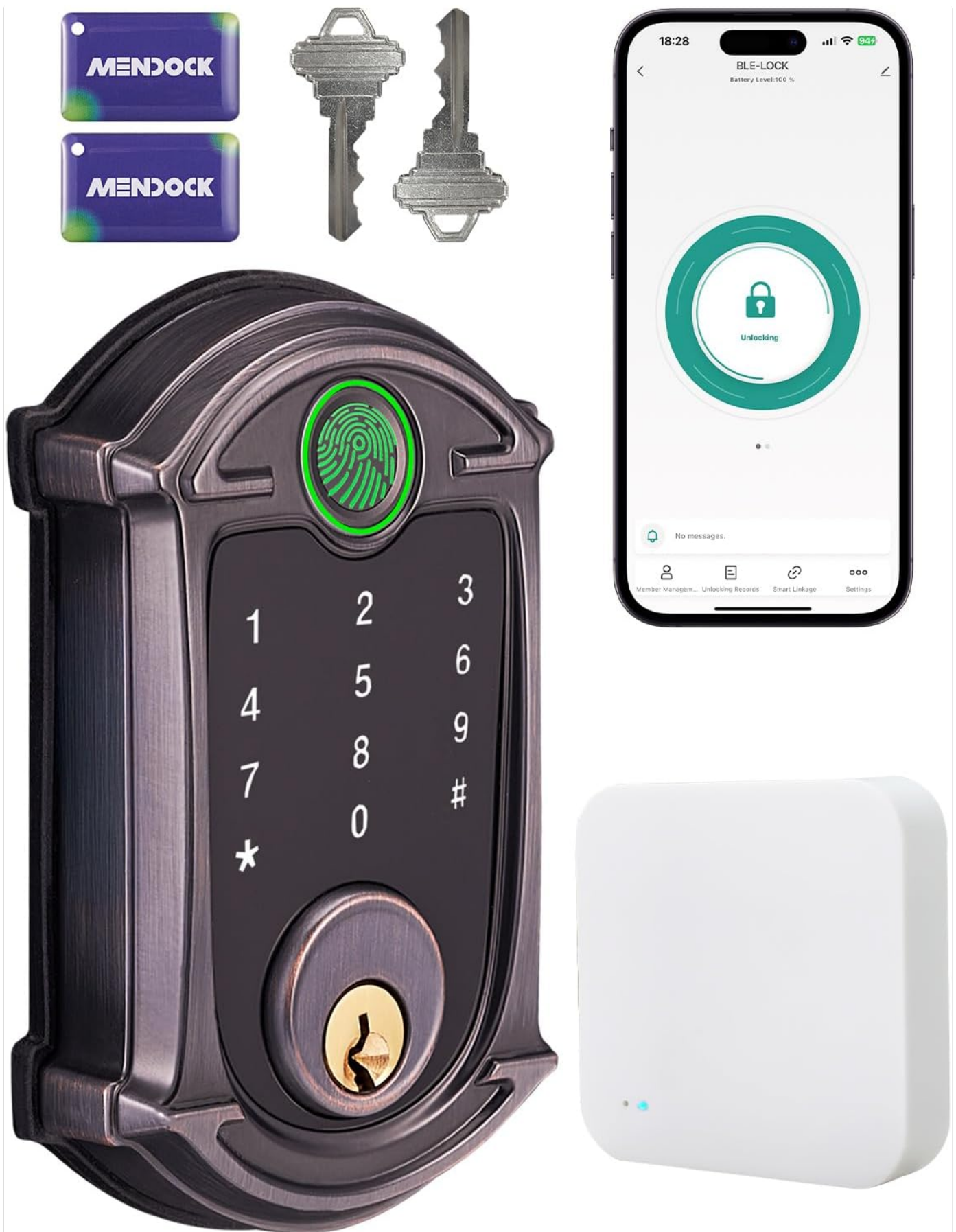
Image: Main components of the MENDOCK UF02L-GW-B Smart Lock, showing the exterior keypad unit, key fobs, physical keys, a smartphone displaying the lock's app interface, and the WiFi gateway.