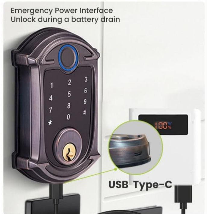
Image: A collage illustrating the smart lock's practical protection features, including its durable zinc alloy material, IP56 rain and dust resistance, and the emergency Type-C USB port for power during battery drain.