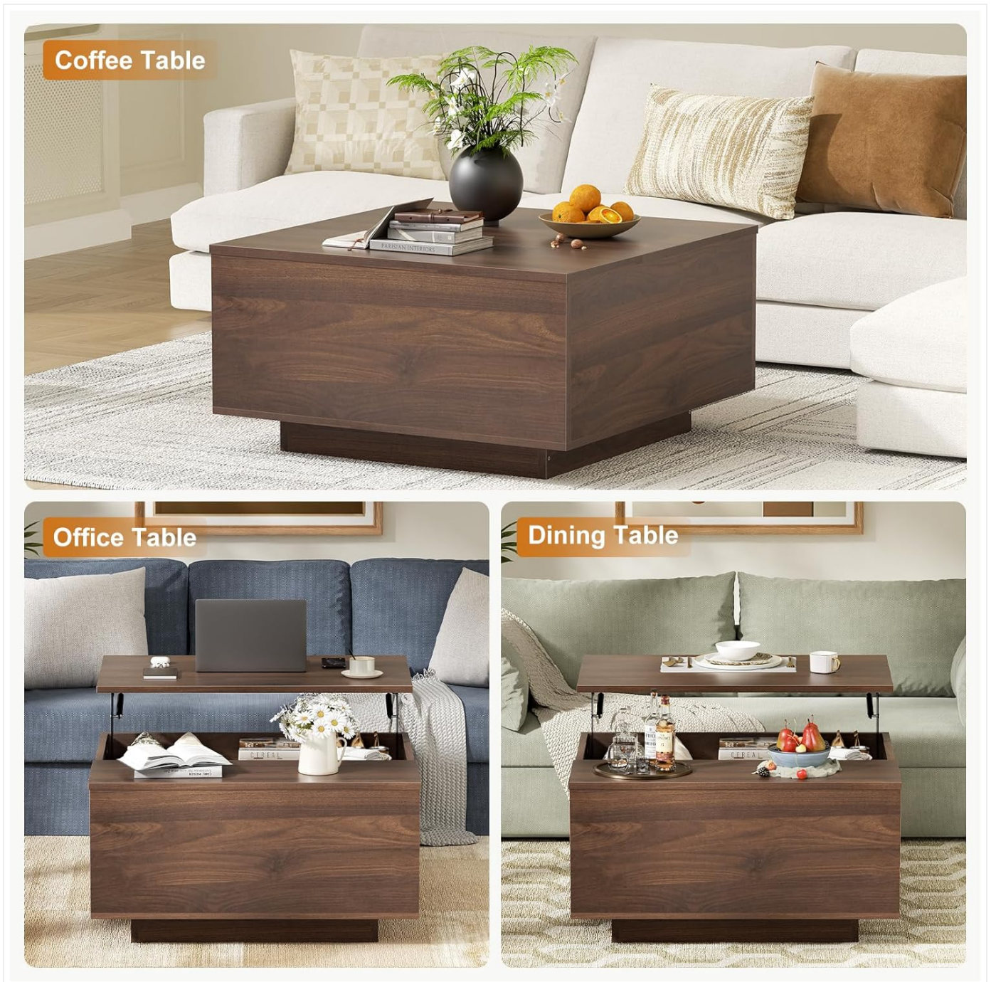
Figure 5.2: The table's versatility is demonstrated in its three primary modes: a standard coffee table, an elevated office table, and a dining table.