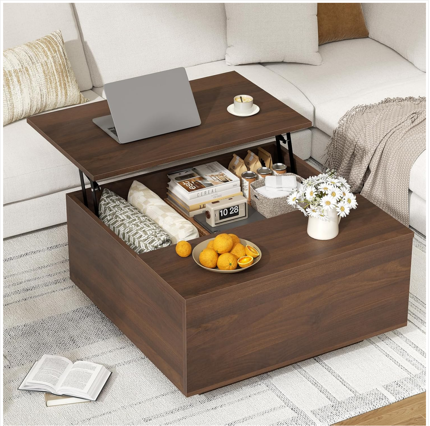
Figure 5.3: The hidden storage compartment offers ample space for various household items, keeping them out of sight and organized.