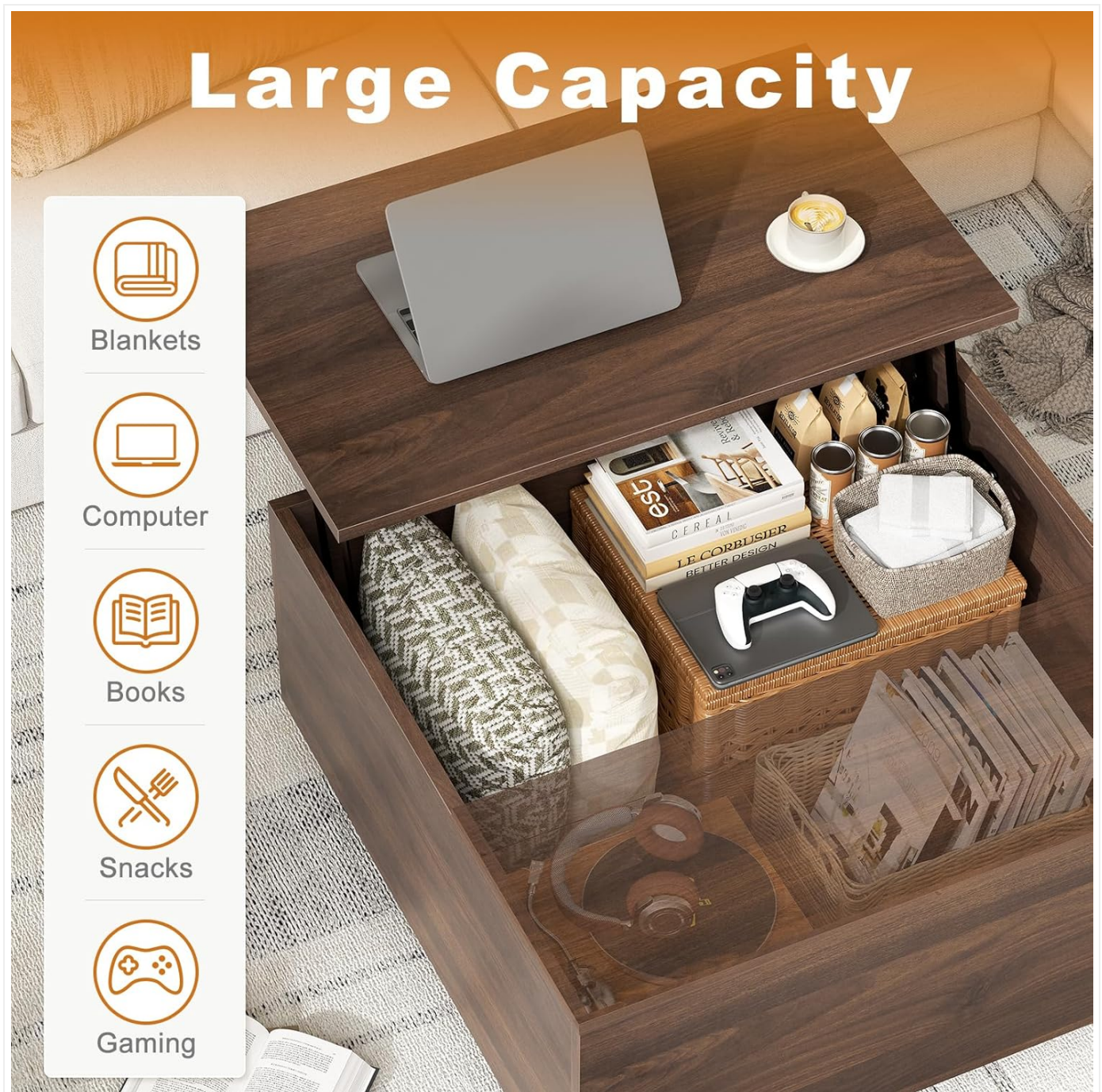
Figure 5.4: Visual representation of the diverse items that can be stored within the coffee table's large capacity compartment.