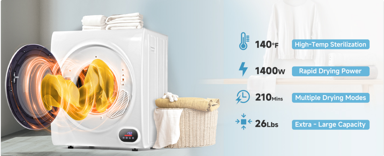
Image: The LED touch panel displaying drying time and options for different drying modes.

The dryer features forward and reverse tumbling action to prevent tangles, reduce wrinkles, and ensure even drying.