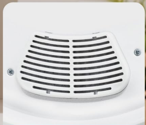
Air Intake Filter

Image: A detailed view of the air intake filter, which is part of the multi-filter system for lint collection.