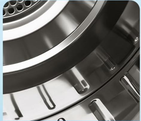
Stainless Steel Drum