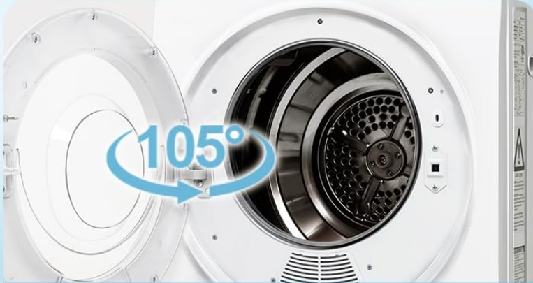
Automatic stop when the door is opened