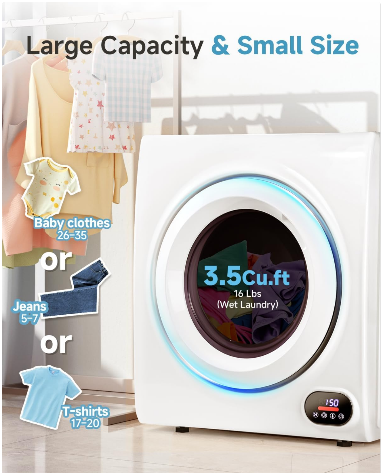
Image: The dryer's drum filled with clothes, demonstrating its capacity for a typical load.