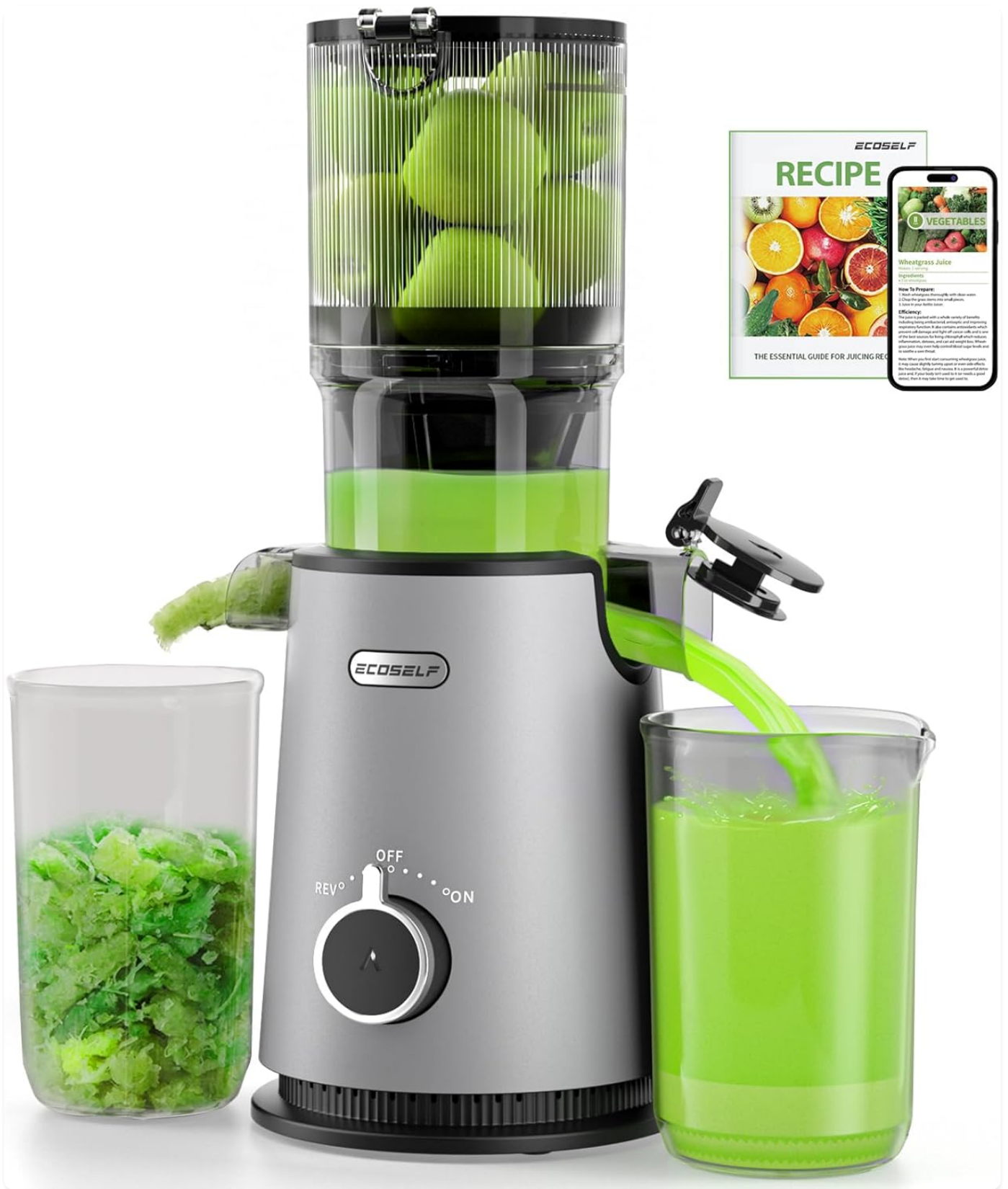
Image: The ECOSELF Cold Press Juicer in light gray, shown with a full feed chute of green apples, a glass of fresh green juice, and a container of pulp. A recipe book is visible in the background.