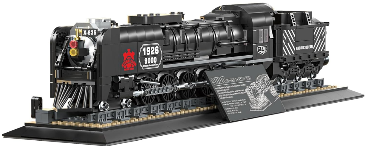
Image 4.1: The fully assembled Reobrix Steam Train Model 66801 on its display base.