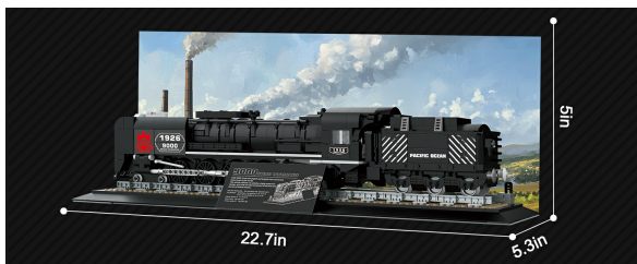
Image 5.4: The historical plaque providing details about the 9000 Steam Locomotive.