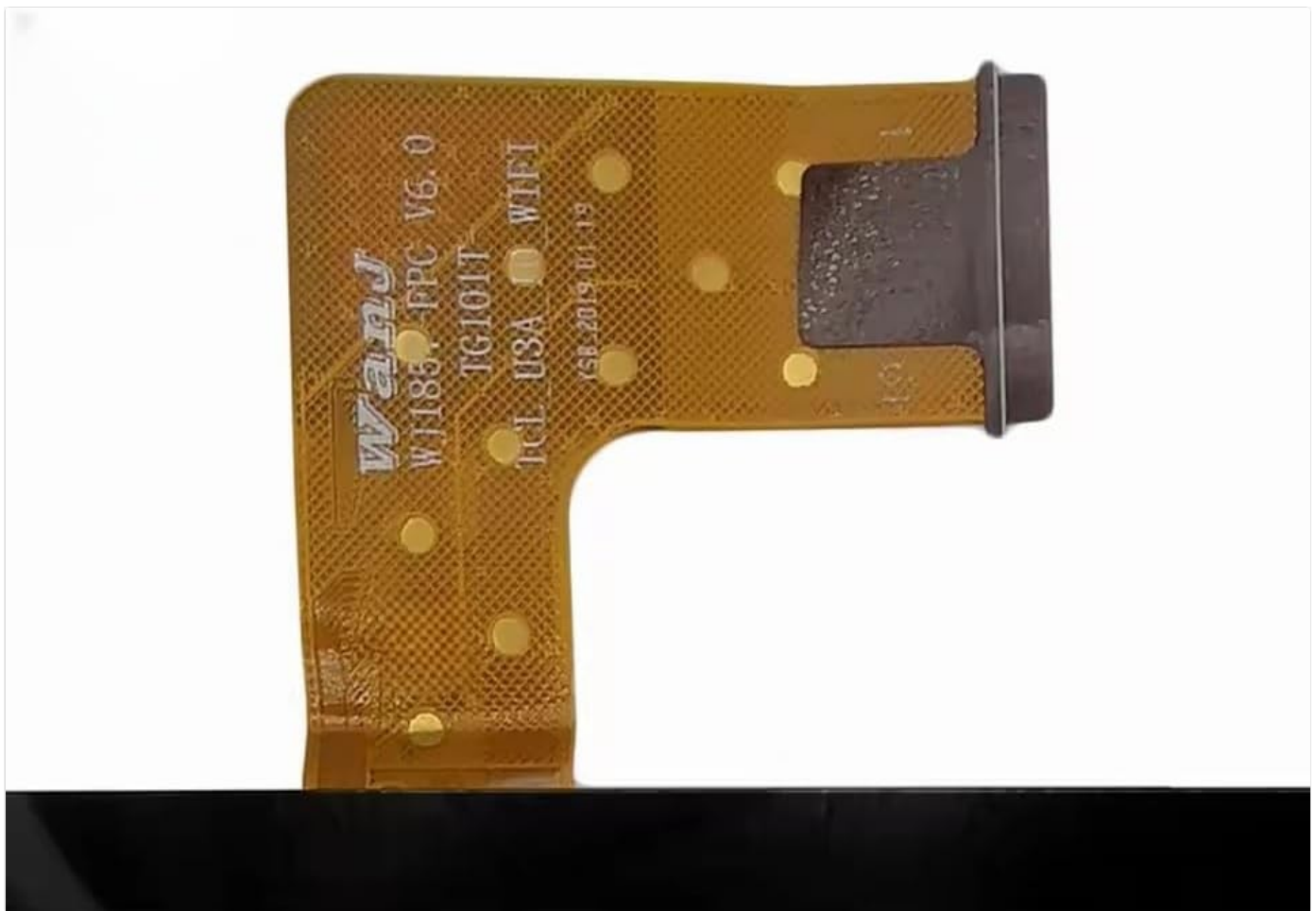
Image 3: Detailed view of the flex cable connector, showing part numbers WJ1857-FPC V6.0 and TG101T-TCL, crucial for verifying compatibility.