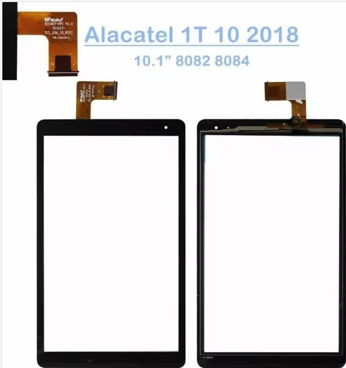
Image 2: Visual comparison of the touch screen panel, confirming compatibility with Alcatel 1T 10 2018 models (8082, 8084).