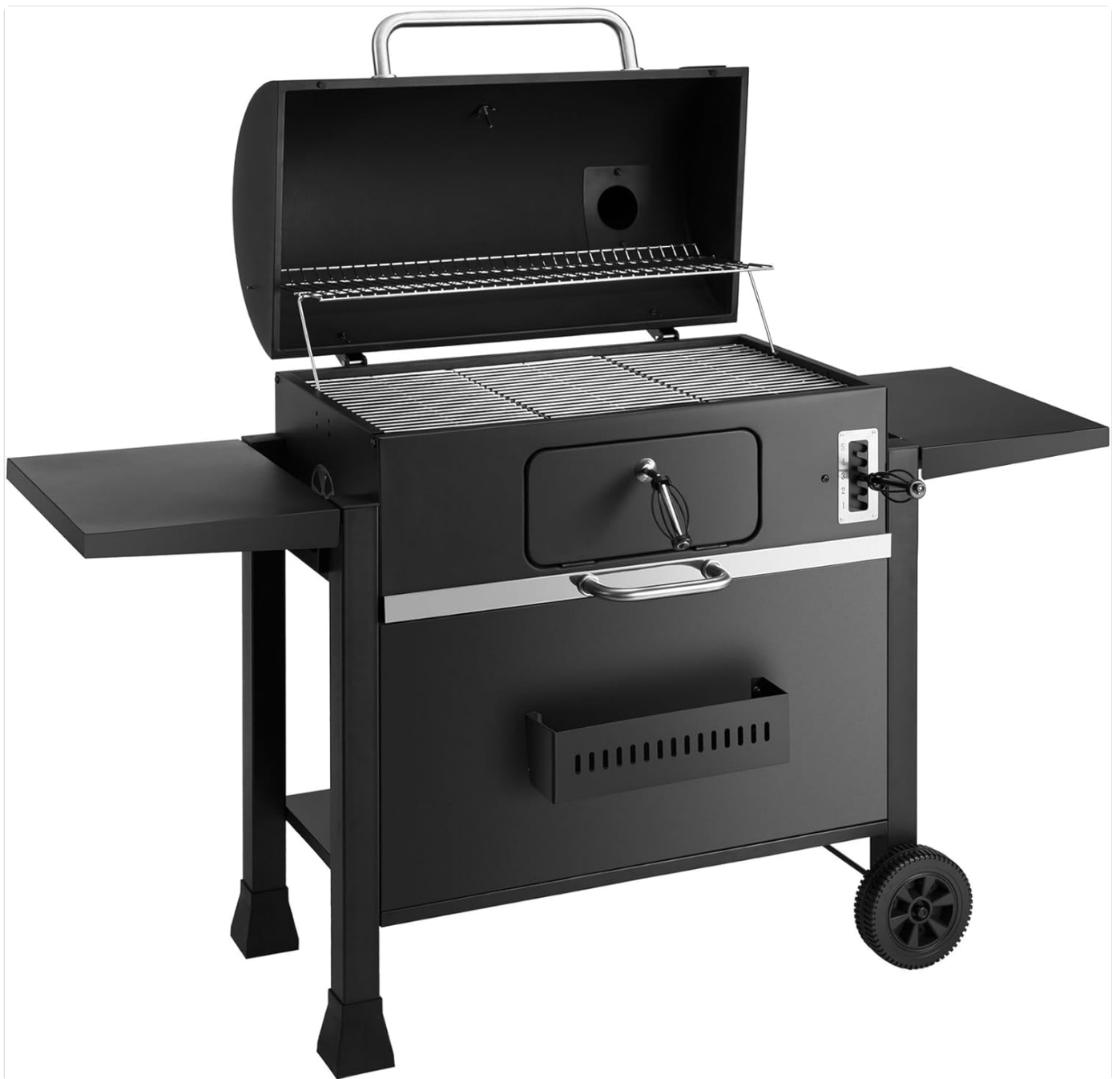
Figure 1: Fully assembled KCT XXL Charcoal BBQ Grill with lid open, showcasing the main cooking grate and warming rack, along with extended side shelves.