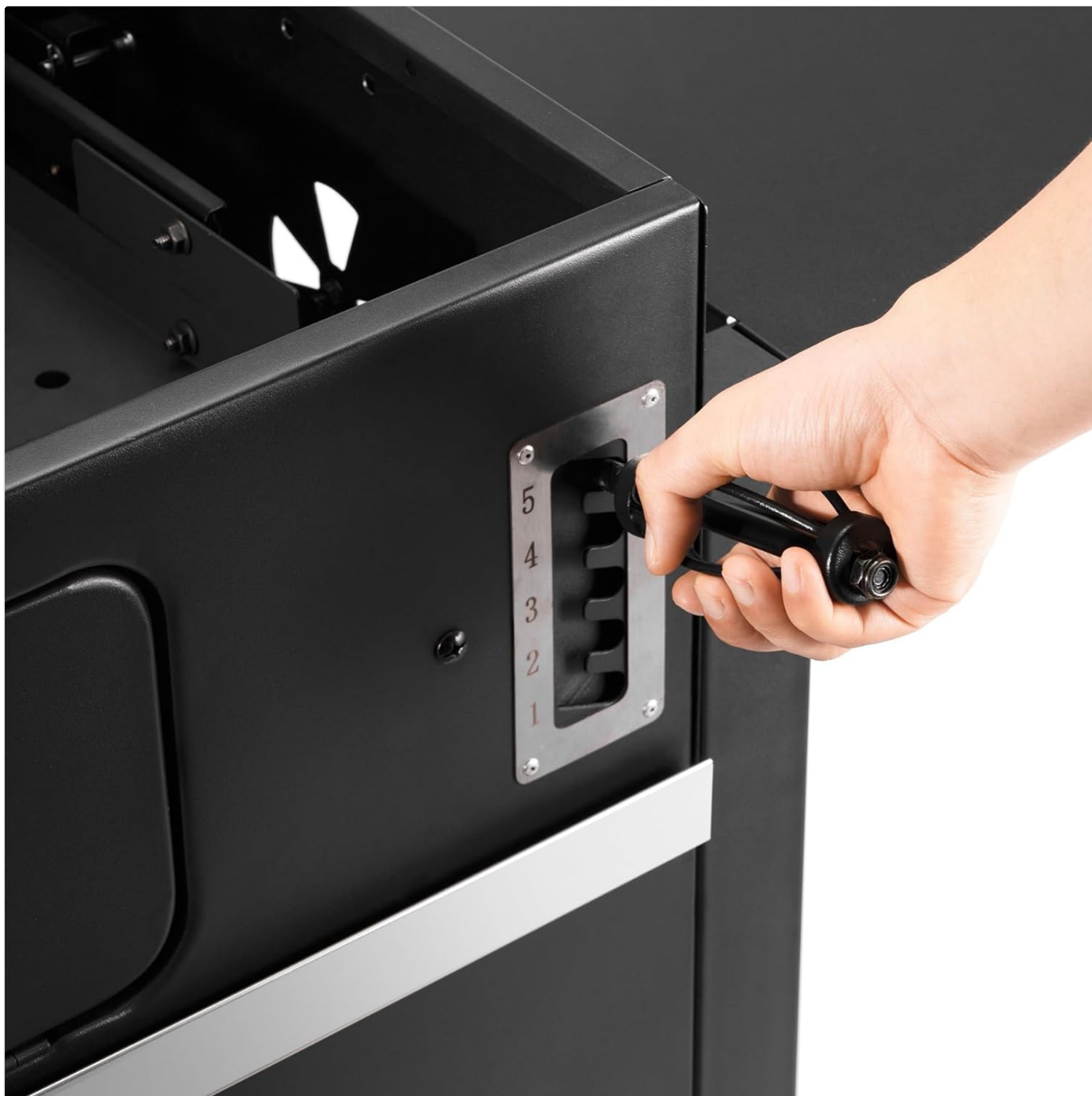
Figure 4: A hand operating the side crank mechanism to adjust the height of the charcoal tray, allowing for precise control over cooking temperature.