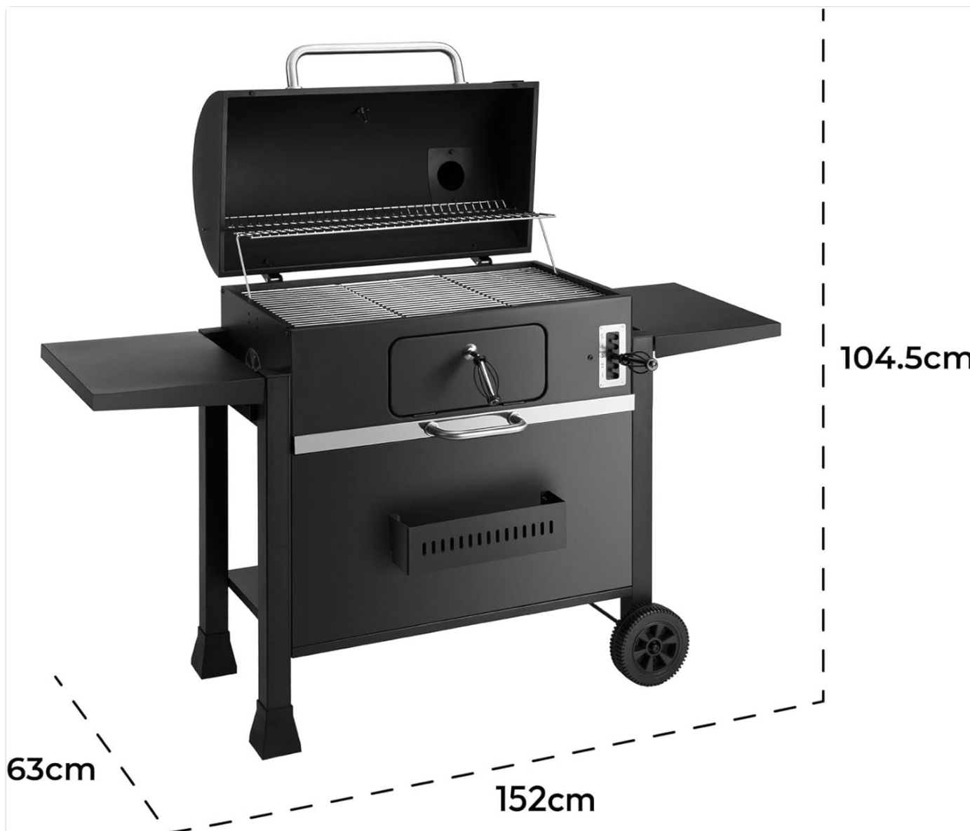
Figure 2: Diagram illustrating the overall dimensions of the KCT XXL Charcoal BBQ Grill: 152cm length, 63cm width, and 104.5cm height.