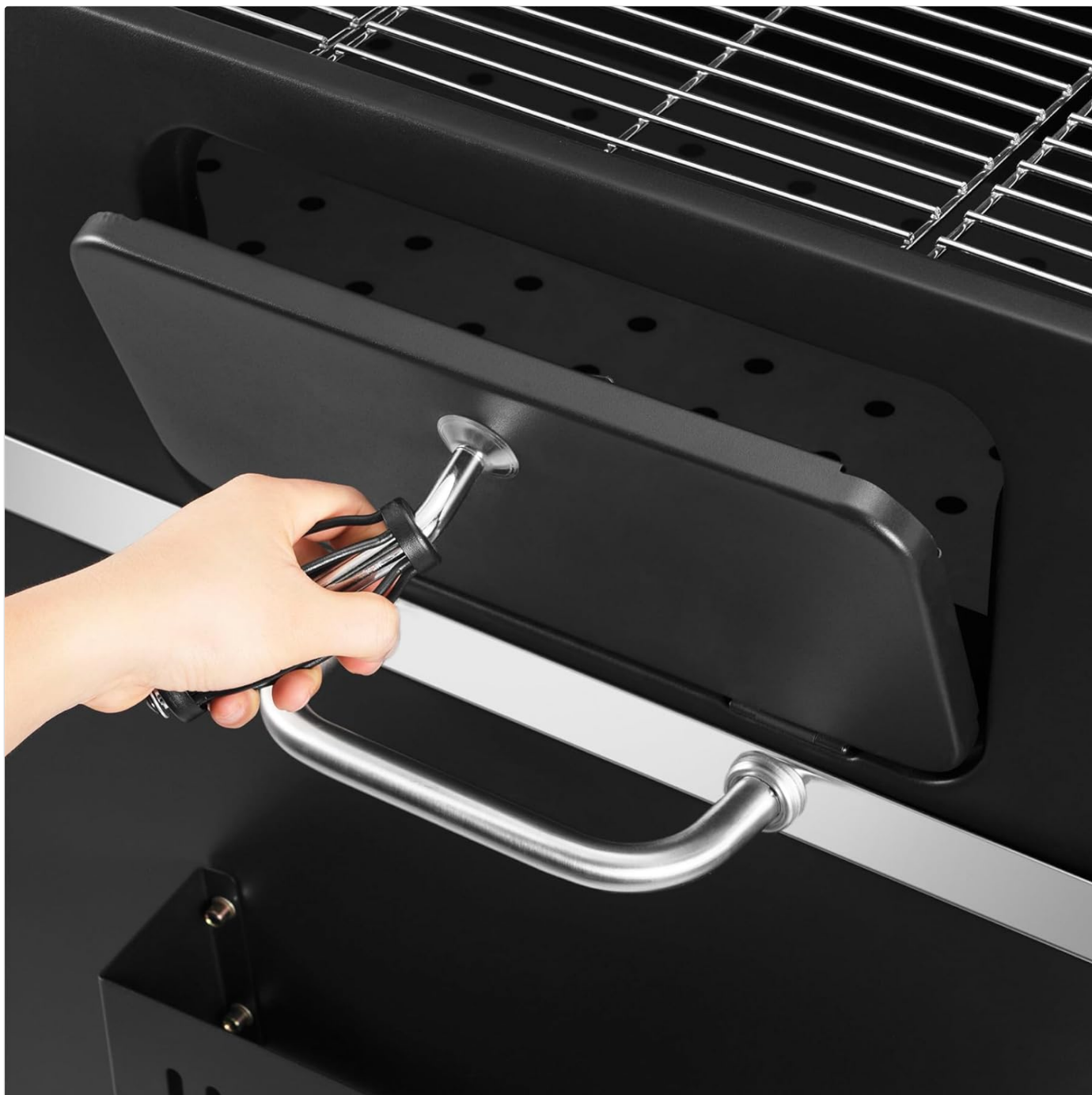
Figure 3: Close-up view of a hand opening the front charcoal access door, allowing for easy addition of charcoal without disturbing the cooking surface.