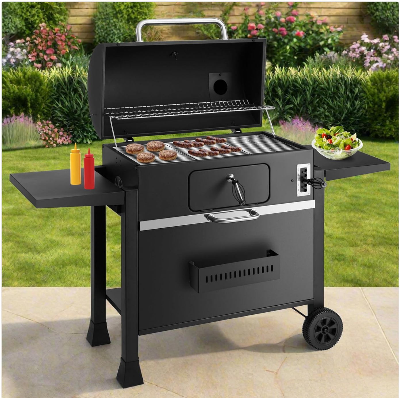
Figure 5: The KCT XXL Charcoal BBQ Grill in an outdoor setting, actively cooking various foods on its spacious grates, with condiments and a salad bowl on the side shelves.