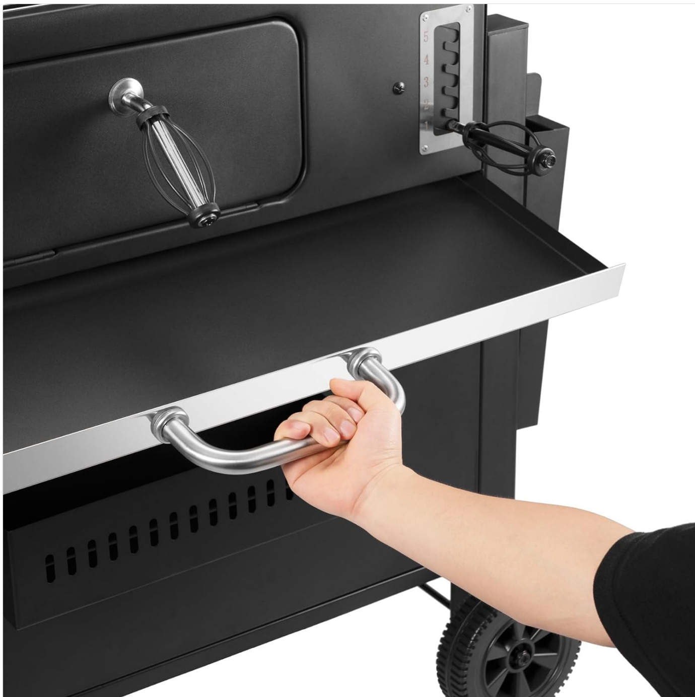
Figure 6: A hand demonstrating the removal of the integrated ash tray from the bottom of the grill, facilitating easy disposal of charcoal ash.