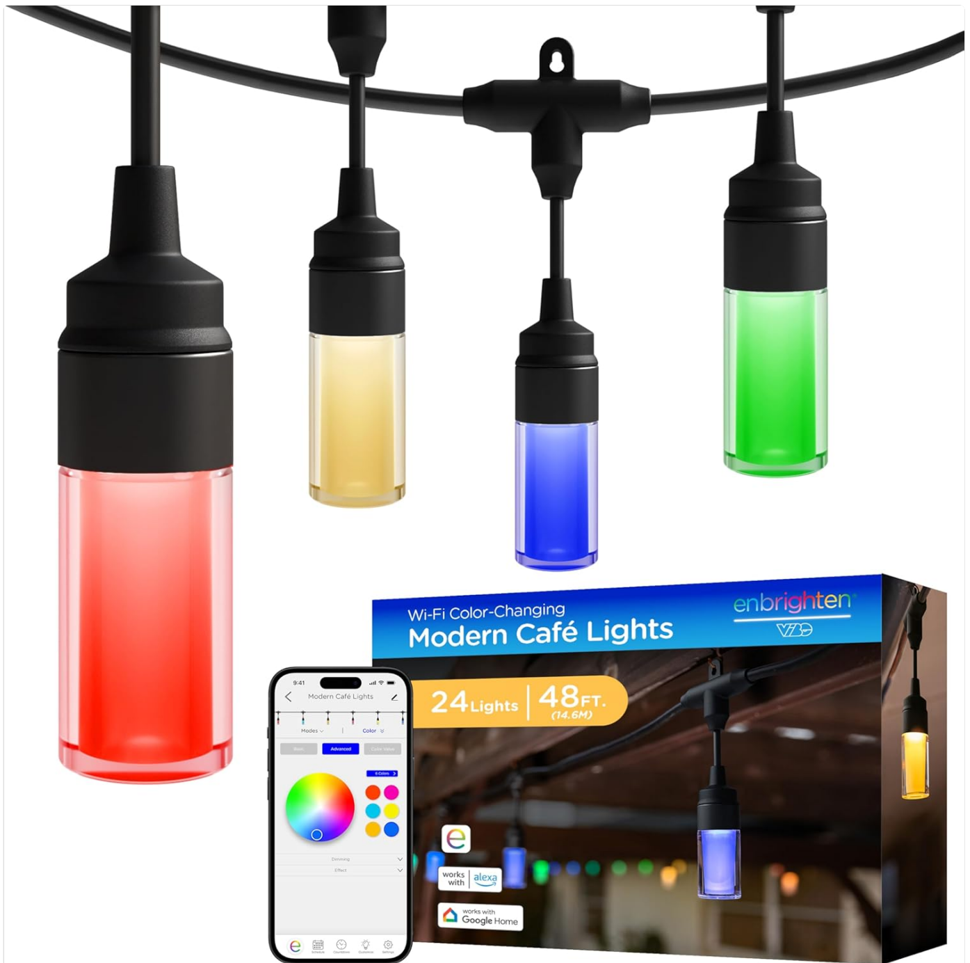
Image: Enbrighten Vibe Modern Outdoor String Lights, showing the 48ft string with multiple colored bulbs and a smartphone displaying the control app.