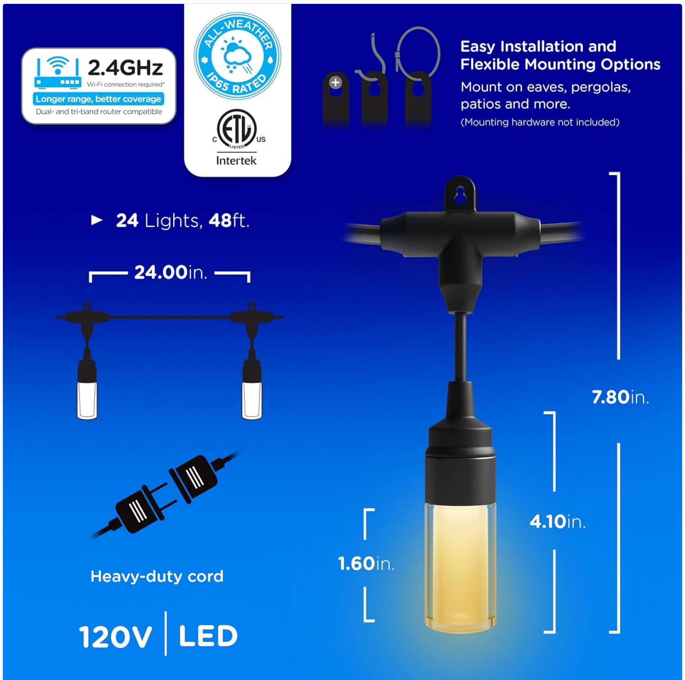
Image: Diagram illustrating the dimensions of the lights and bulbs, along with icons indicating all-weather rating (IP65), ETL certification, and Wi-Fi compatibility. It also shows the heavy-duty cord and 120V LED power.

The strands are linkable, allowing you to connect multiple sets of Enbrighten smart café lights up to a total length of 750 feet for larger installations.