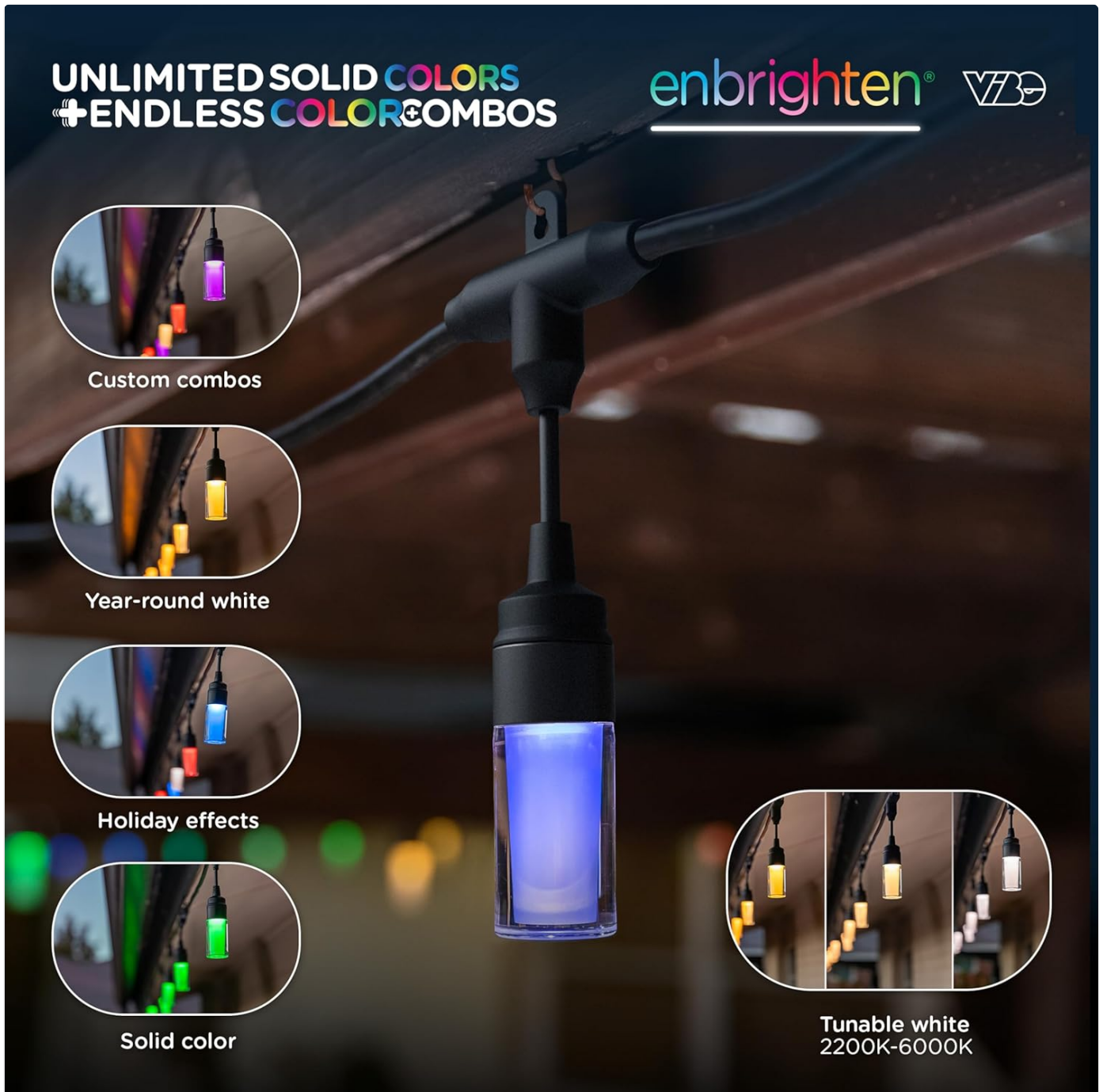
Image: Enbrighten string lights showcasing different lighting possibilities, including unlimited solid colors, endless color combinations, year-round white light (2200K-6000K), holiday effects, and custom combos.