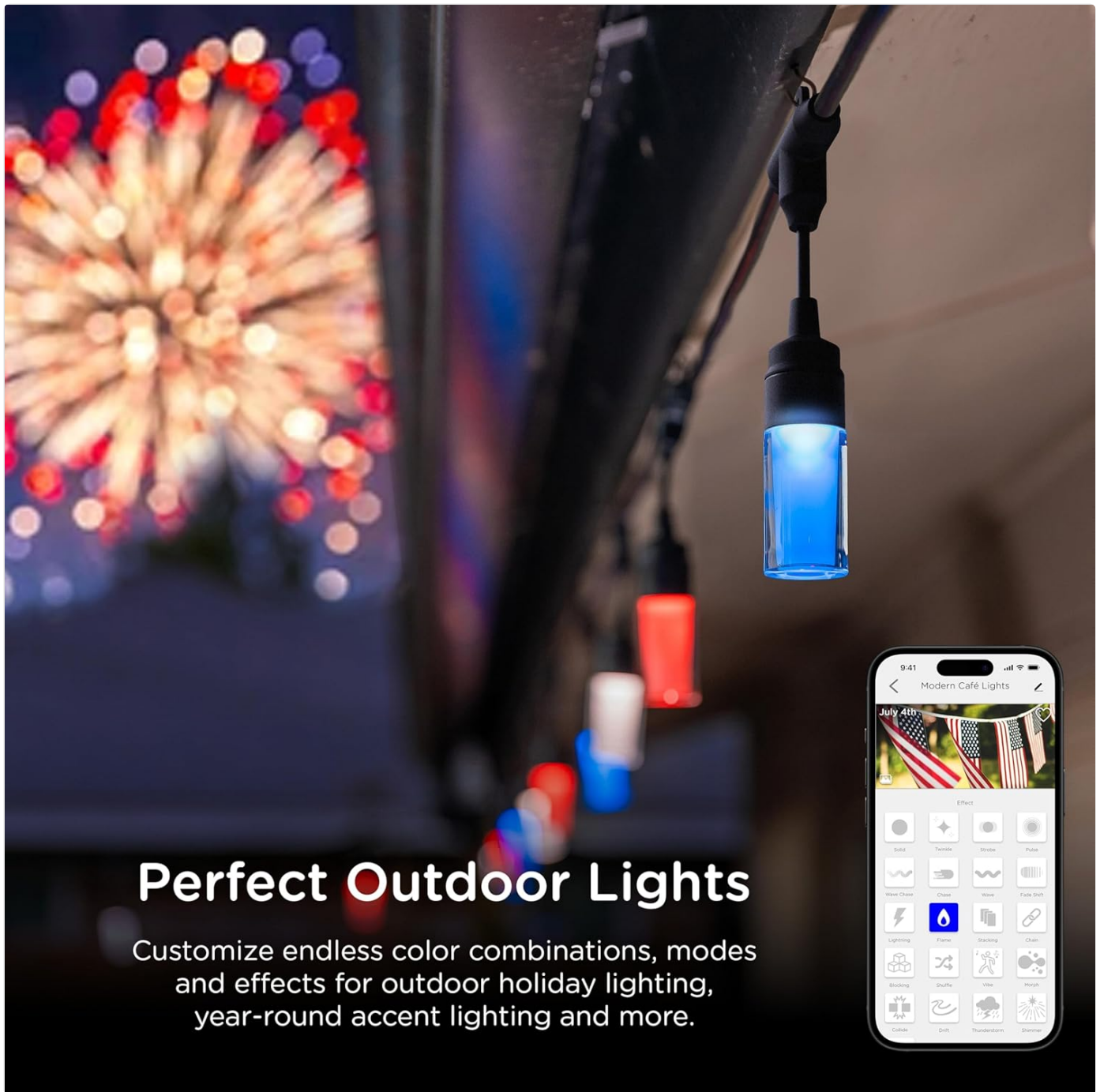
Image: Enbrighten string lights installed outdoors, providing colorful illumination with fireworks visible in the background, illustrating their use for special occasions and outdoor ambiance.