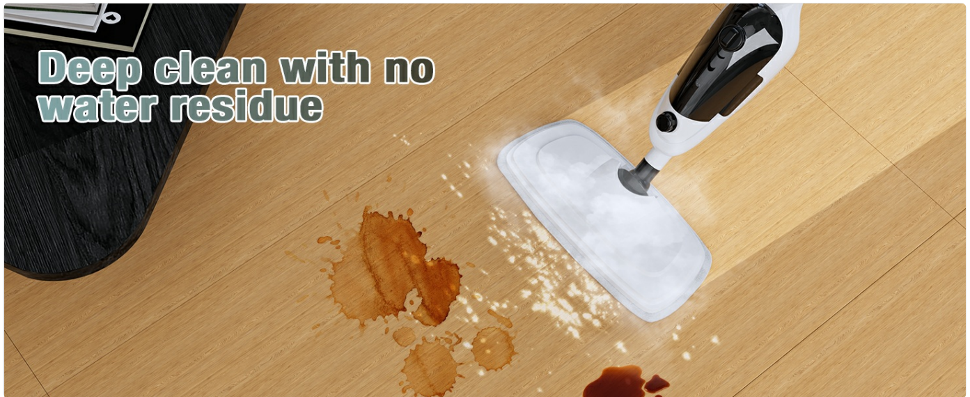
Figure 9: The Sprobil 11-in-1 Steam Mop provides quick drying and leaves no water stains, effectively removing tough water stains from floors compared to conventional methods.