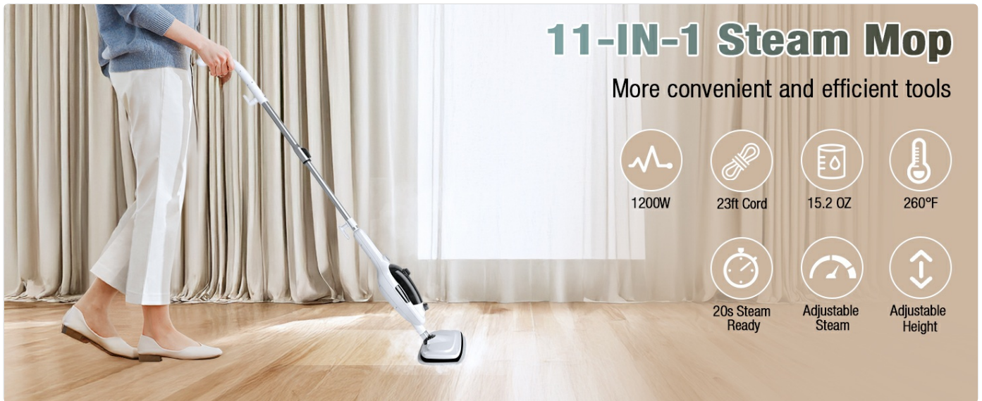
Figure 3: Key features of the Sprobil 11-in-1 Steam Mop, including 20s rapid heating, 99% stain removal, 260°F deep cleaning, and chemical-free operation.