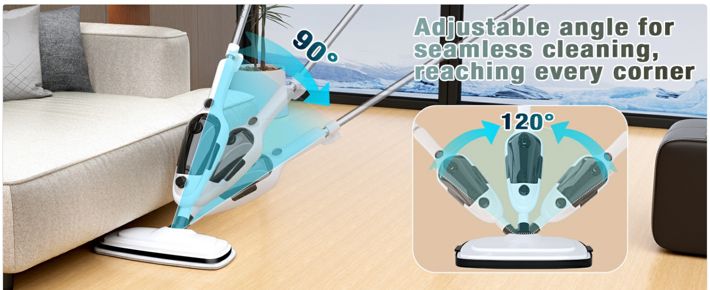
Figure 7: The steam mop head demonstrating its 120° and 90° adjustable angles for seamless cleaning and reaching every corner, along with its self-standing capability.

Rotate the steam control knob (located on the main body) to select your desired steam output.