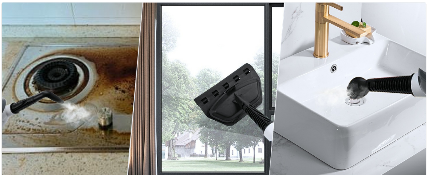
Figure 10: The Sprobil 11-in-1 Steam Mop transforms into a multi-purpose steam cleaner, effectively cleaning various items such as toys with a large round brush, sinks with a round and flat brush, clothes with an ironing brush, windows with a window cleaning tool, sofas with a small cloth, and stovetops with a cramping tool and angle nozzle.