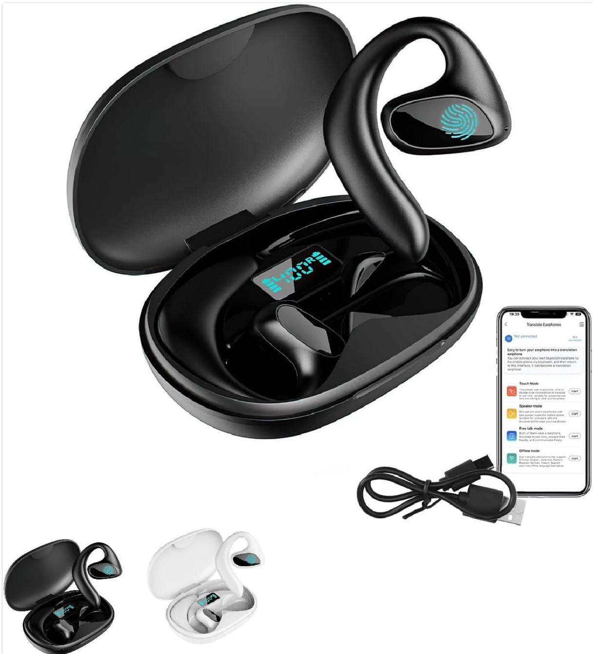
Image: The Talkbuds Translator Earbuds, their charging case, and the included USB charging cable. The earbuds are shown nestled within the open charging case, which displays a digital battery indicator. An app interface is also visible, illustrating the translation functions.