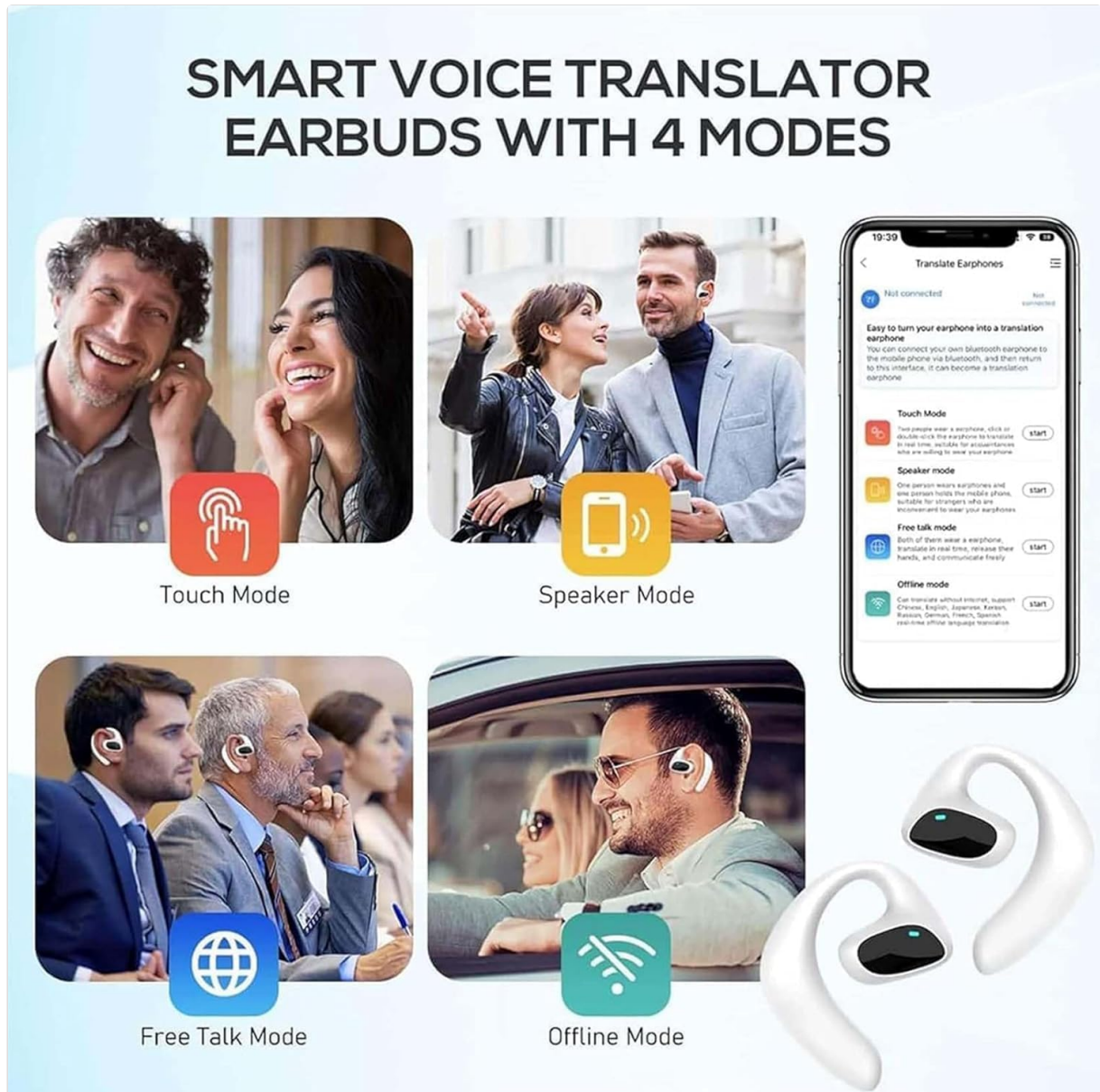
Image: A collage demonstrating different scenarios where the Talkbuds Translator Earbuds are used for communication. It highlights "Touch Mode," "Speaker Mode," "Free Talk Mode," and "Offline Mode," showing individuals interacting and translating in real-time.

Access and control translation modes through the "Translate Earphones" application on your paired device.