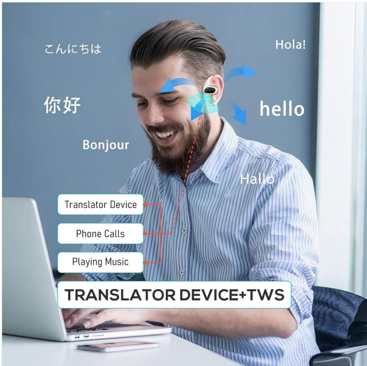
Image: A man wearing a Talkbuds Translator Earbud while working on a laptop, with speech bubbles in various languages (Japanese, Chinese, French, English, German) indicating real-time translation. The graphic labels the device as a "Translator Device + TWS," illustrating its dual function as a translator and true wireless stereo earbuds.