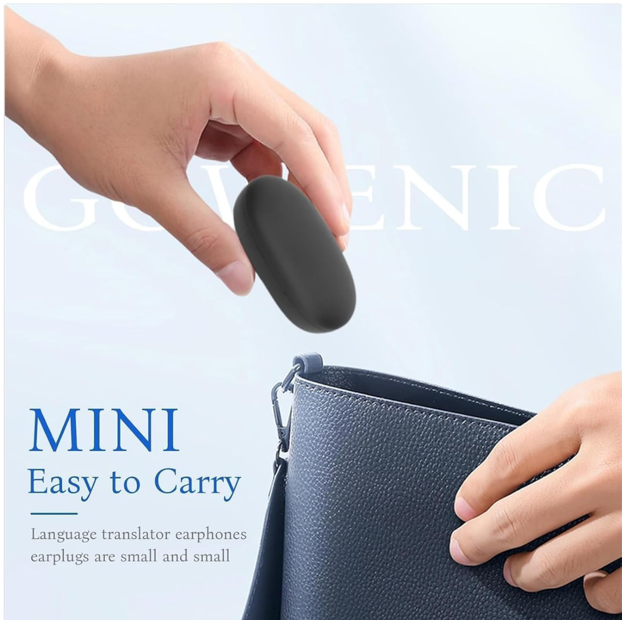
Image: A hand demonstrating the compact size of the Talkbuds Translator Earbuds charging case by placing it into a small bag, emphasizing its portability and ease of carrying.