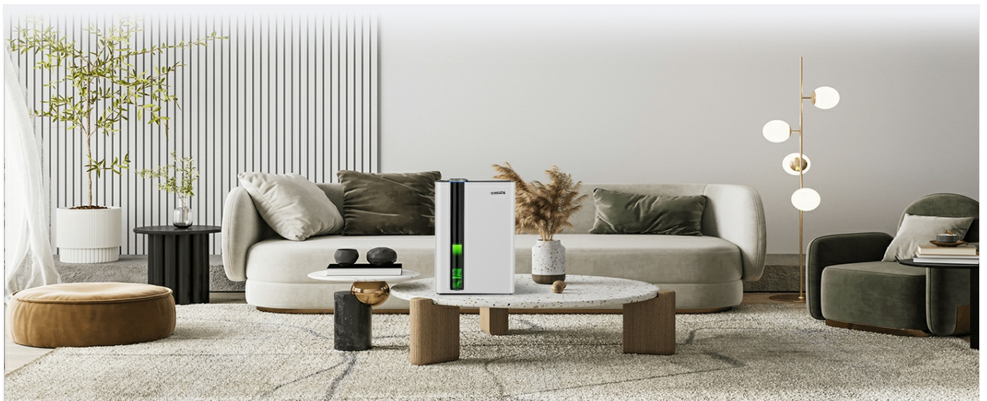
Image: The ionizer purification system, which helps to keep the room dry and release fresh air.