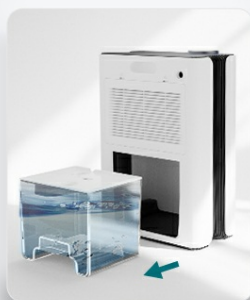
Remove the water tank