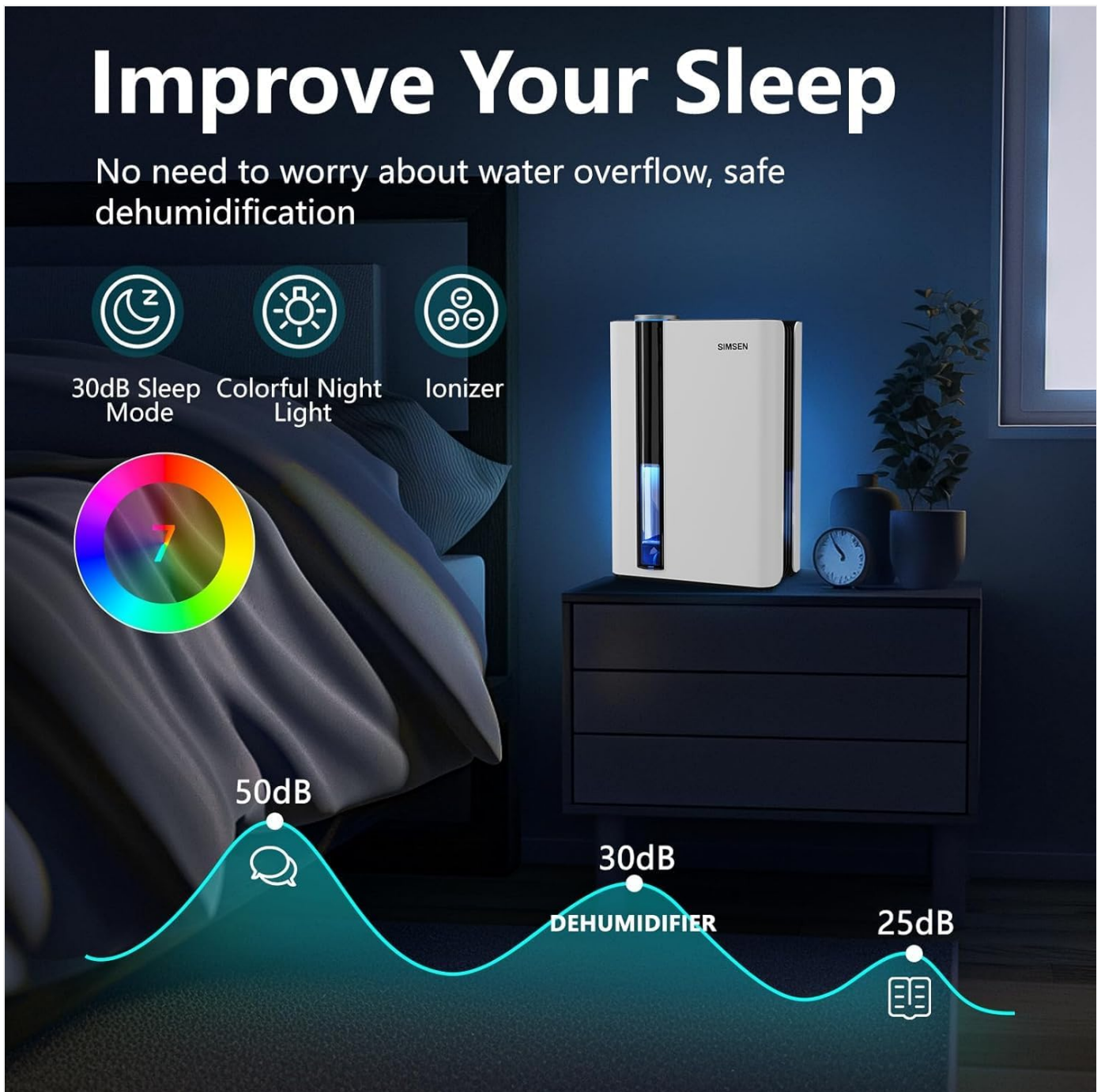
Image: The dehumidifier operating in a bedroom, highlighting its quiet sleep mode.