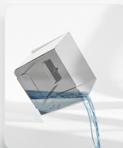
Pour out the water