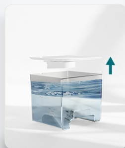
Take out the tank lid