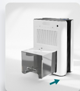
Close the Cover and place the tank completely in the dehumidifier

Image: Steps for setting up the continuous drainage feature.