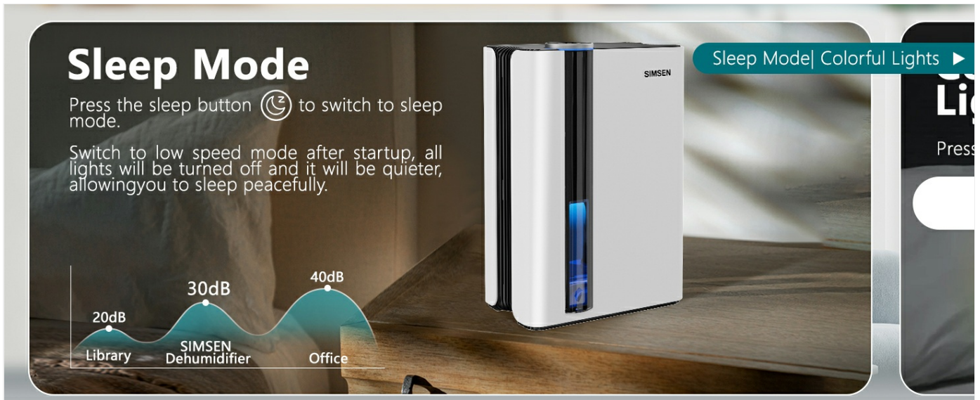
Image: Noise level comparison for the dehumidifier's sleep mode.