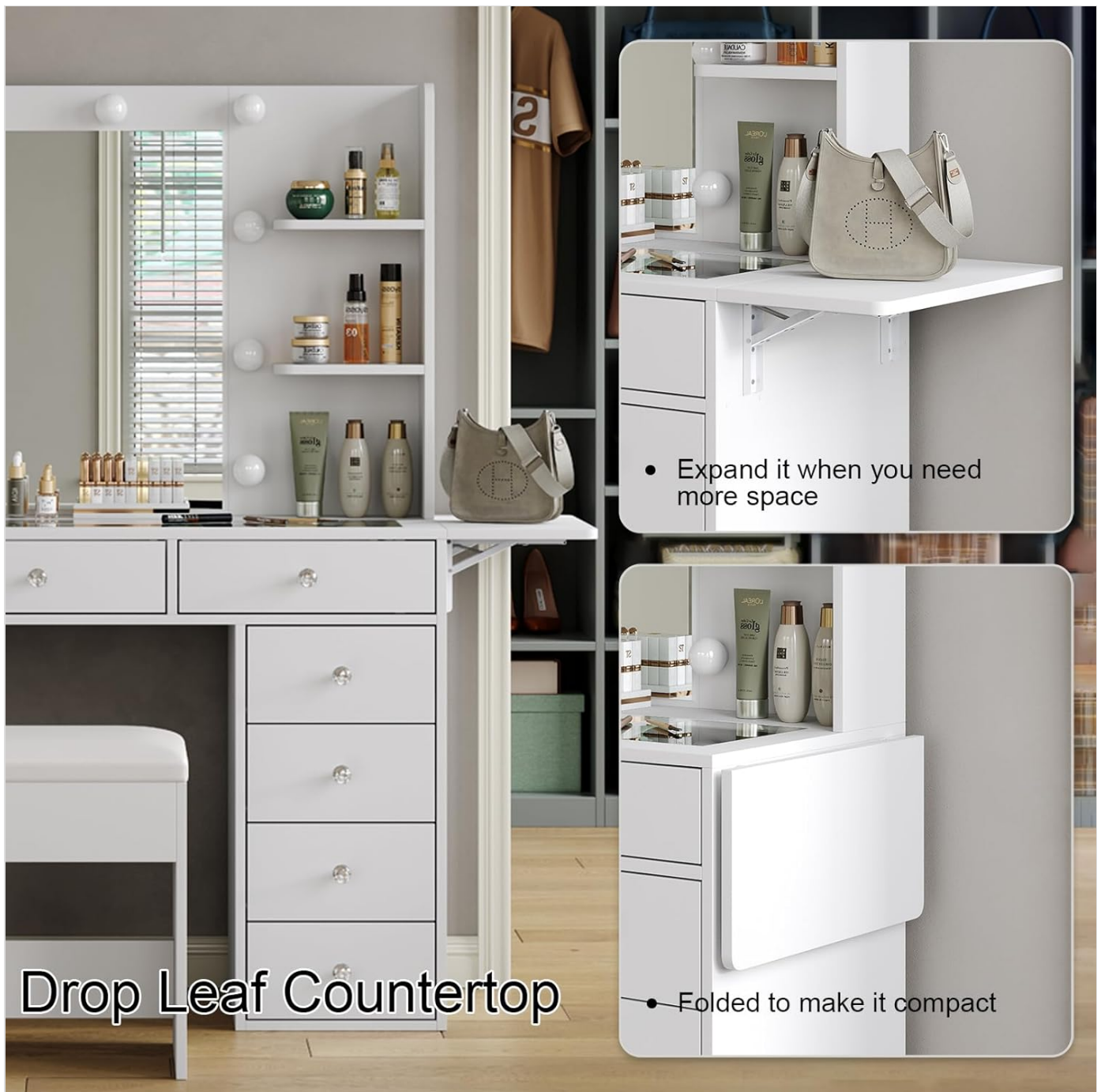
Image 4.4: Demonstration of the fold-up side panel, showing it expanded for extra space and folded for compactness.