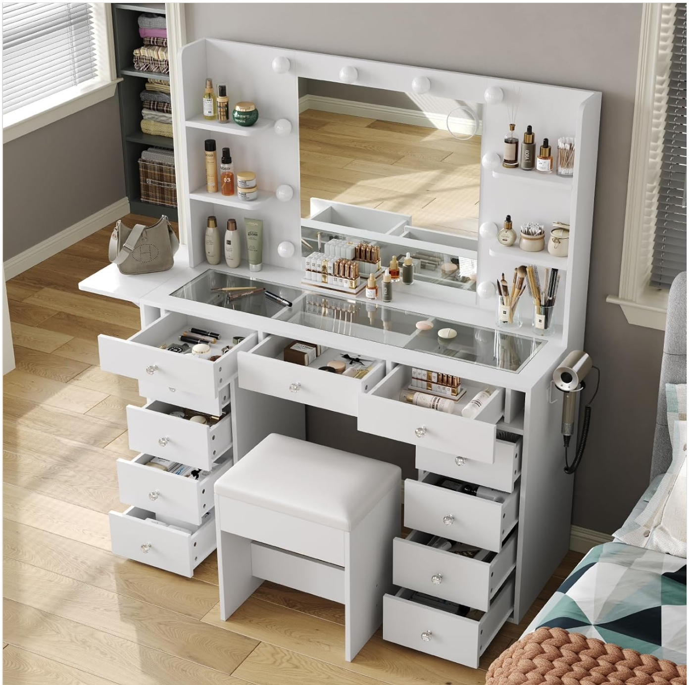
Image 4.3: Top-down view of the vanity desk with drawers and shelves open, demonstrating the storage capacity and glass top.