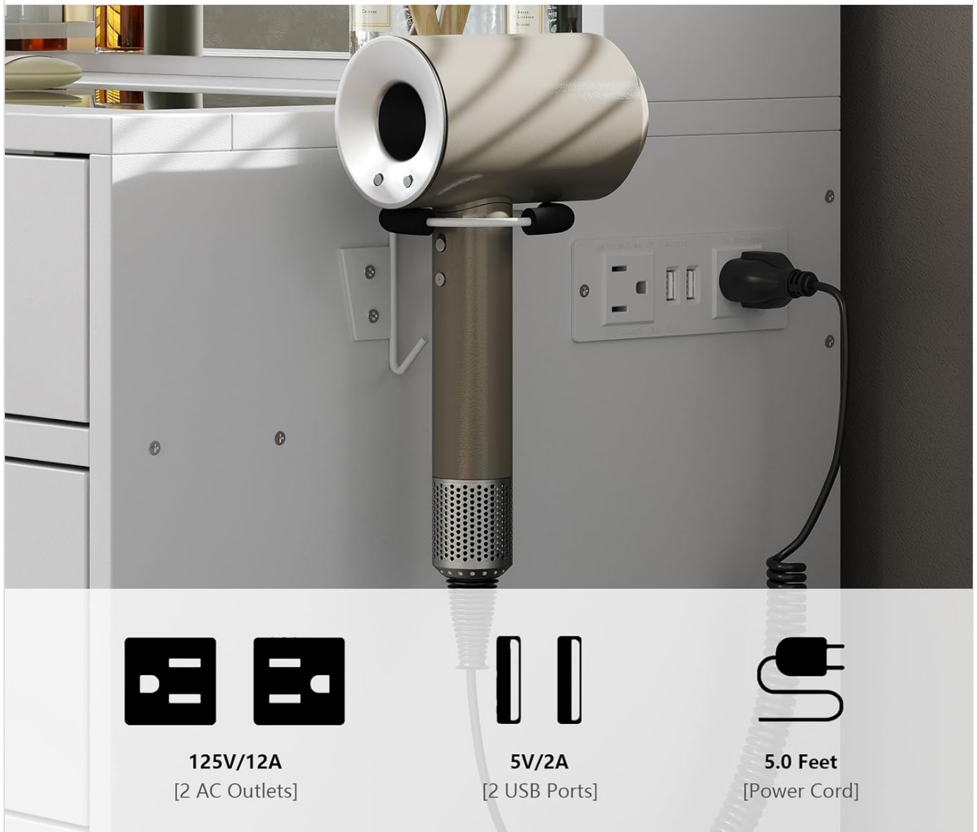
Image 4.2: Close-up of the integrated power strip with AC outlets and USB ports, along with a hair dryer holder.

Convenient for phone charging & hair dryer use