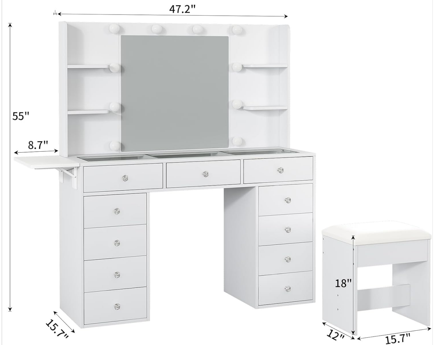
Image 2.1: Front view of the Yanosaku Vanity Desk, showcasing the mirror, LED lights, and overall structure.