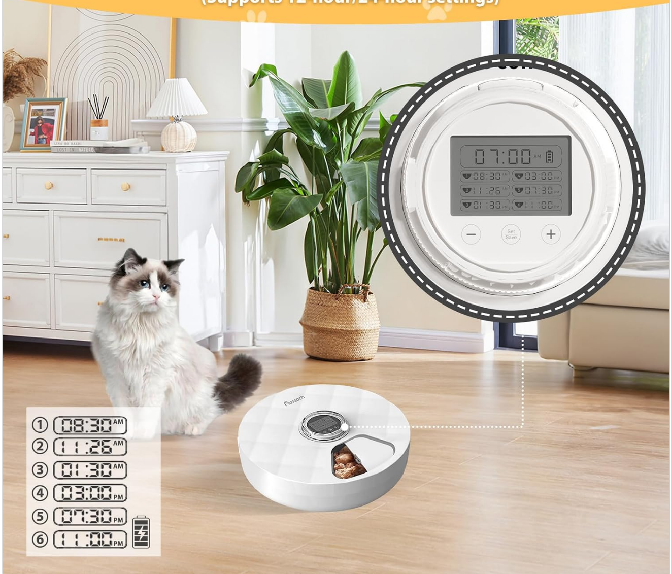
Image: A close-up of the Auveach F19-L's LED touch panel, displaying time and programmed meal schedules, with a cat in the background.

New LED touch panel, new operating logic, easy to operate (Supports 12-hour/24-hour settings)