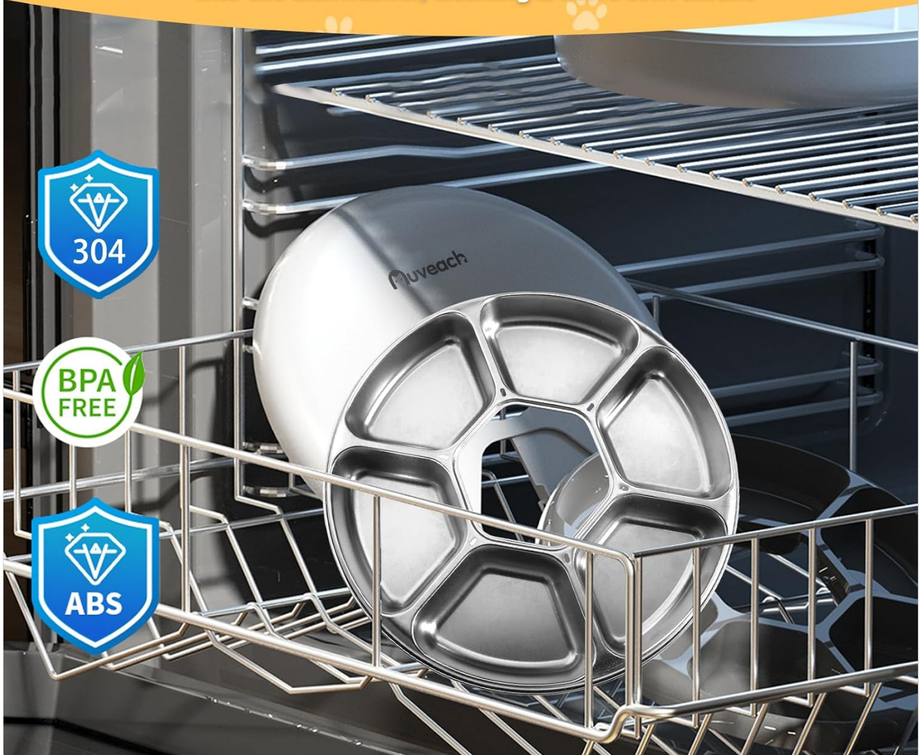
Image: The food tray of the Auveach F19-L dispenser placed in a dishwasher, demonstrating its dishwasher-safe design for convenient cleaning.

80% of the parts of the whole machine can be put into the dishwasher, cleaning is more convenient