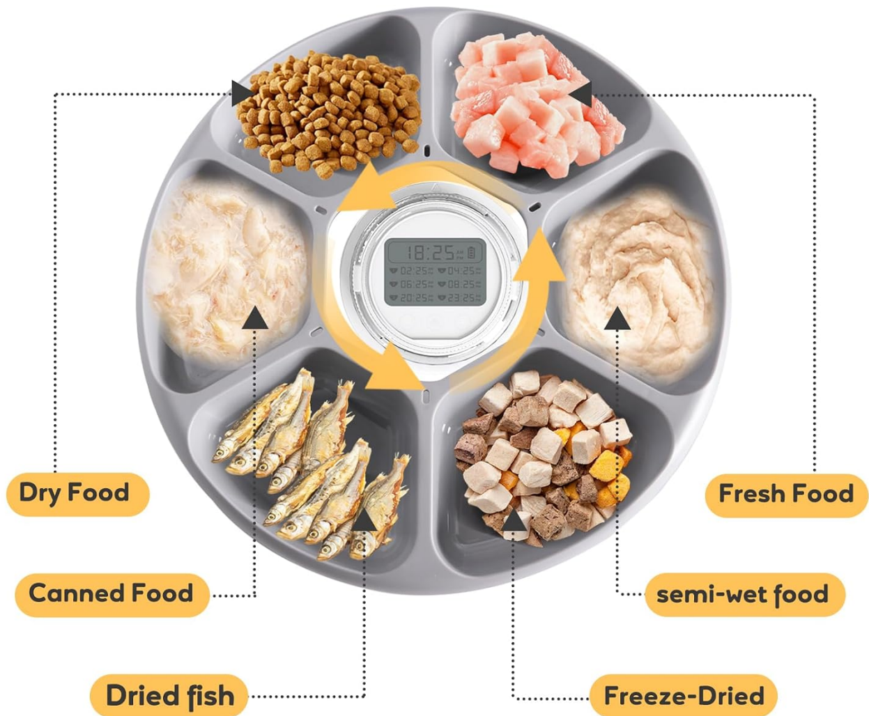
Image: Top-down view of the Auveach F19-L food tray, illustrating different types of food (dry, wet, freeze-dried, fresh, semi-wet, dried fish) in its six compartments.

Supports 6 meals/day, balanced nutrition and scientific feeding 200ml/slot (about 90g-100g dry food)