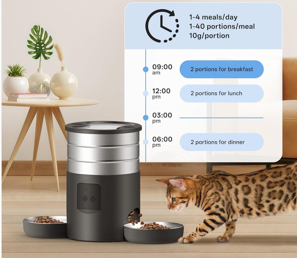
Image: Illustration of the feeder's scheduling capabilities, showing 1-4 meals per day, 1-40 portions per meal, and 10g per portion, with an example schedule for breakfast, lunch, and dinner.