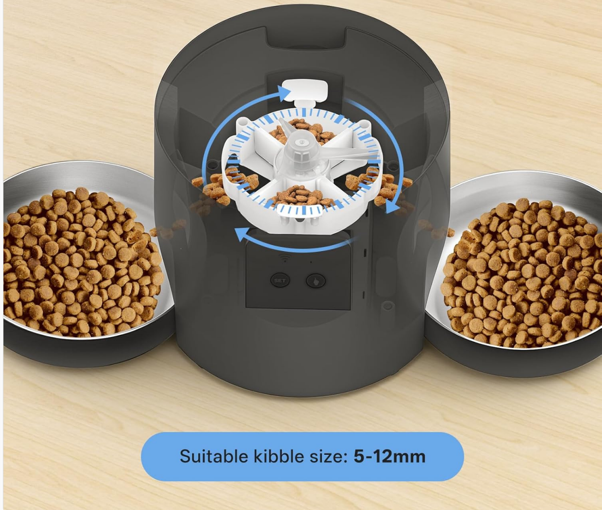
Image: Close-up view of the feeder's internal anti-block rotor design, showing how it dispenses kibble into the dual bowls. Suitable kibble size is indicated as 5-12mm.