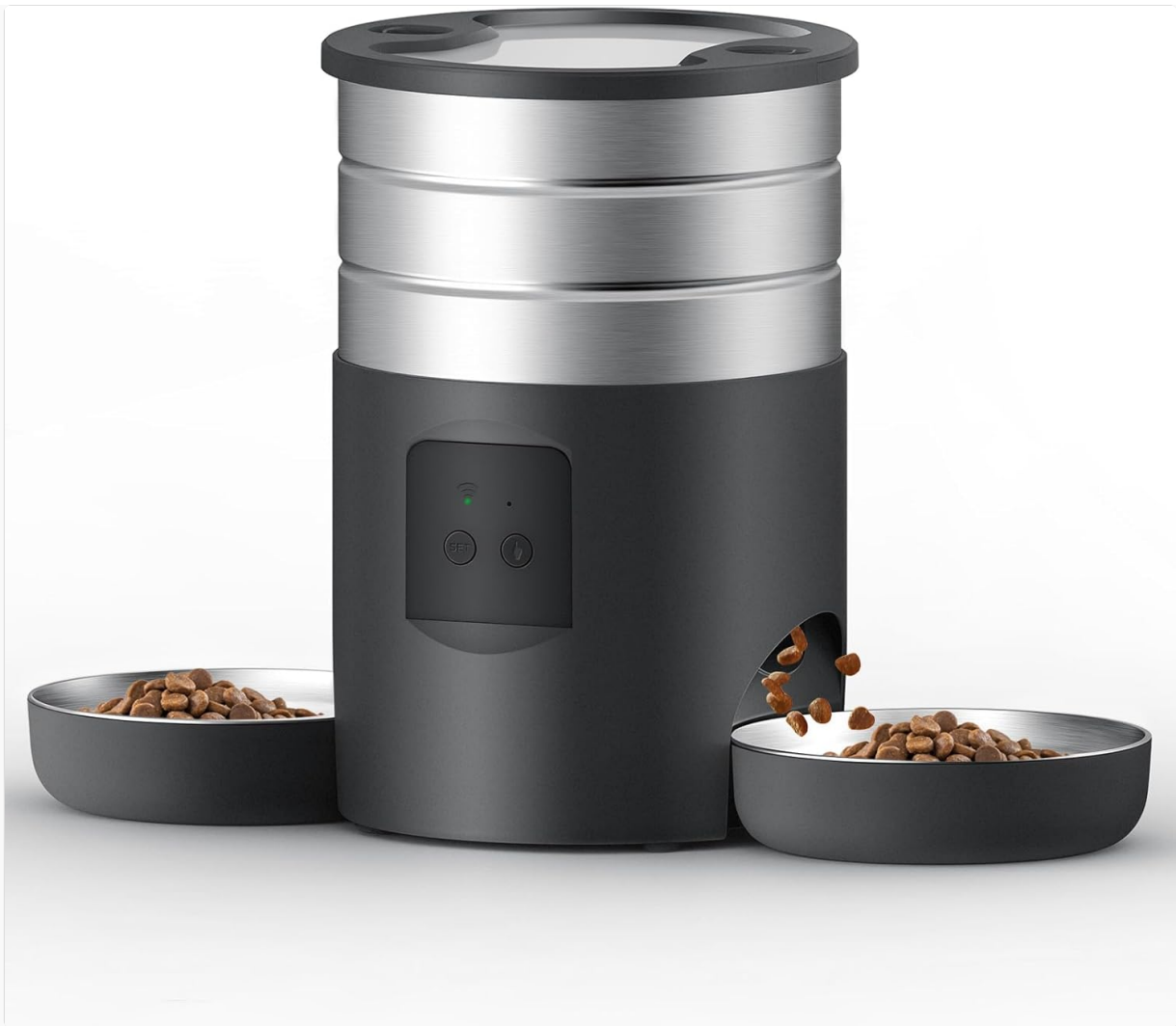
Image: KutoraWorks Automatic Cat Feeder with dual bowls, dispensing dry food.