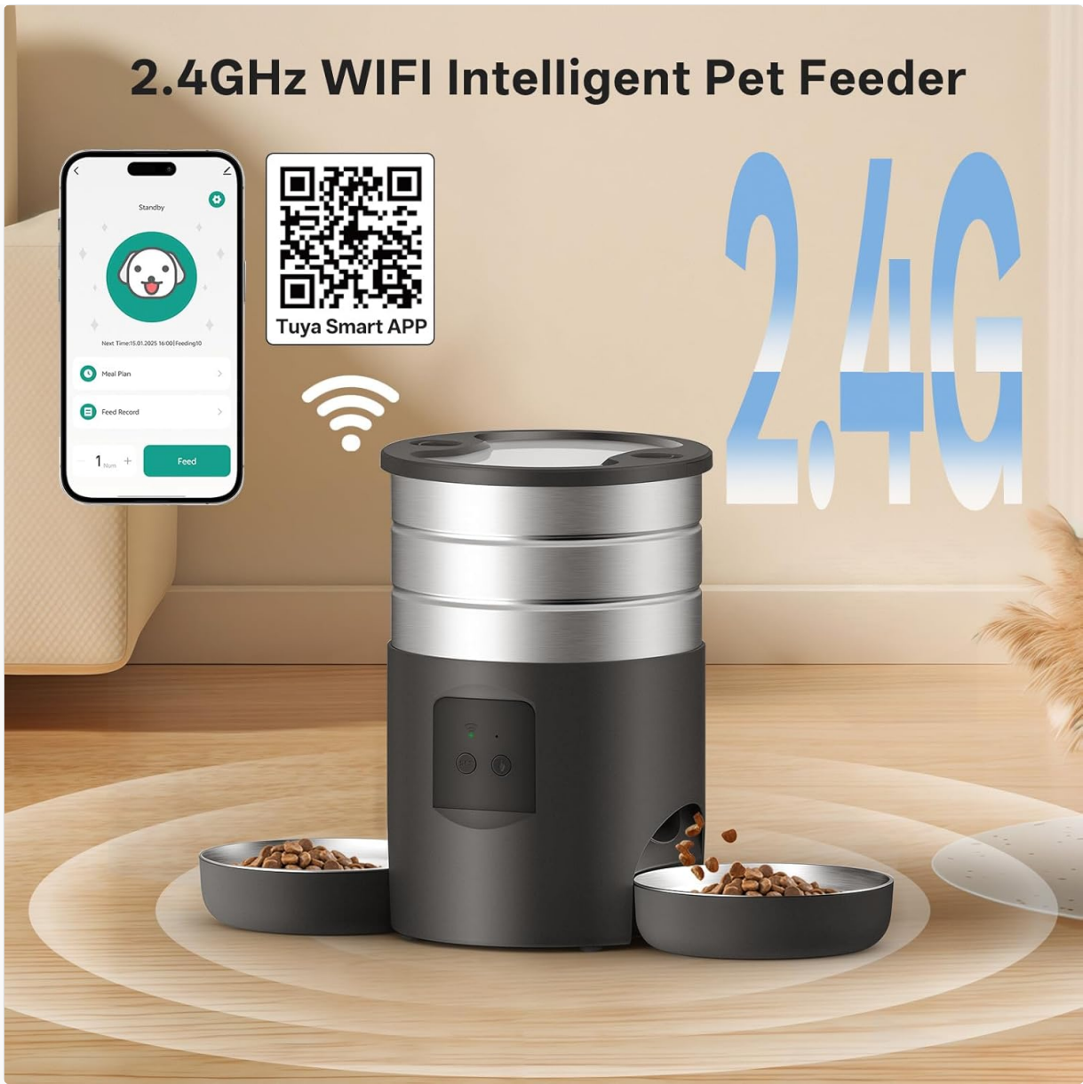
Image: The KutoraWorks automatic pet feeder with a smartphone displaying the Tuya Smart app interface and a QR code for app download. The text '2.4GHz WIFI Intelligent Pet Feeder' is prominent. Download the app here: smartapp.tuya.com/tuyasmart