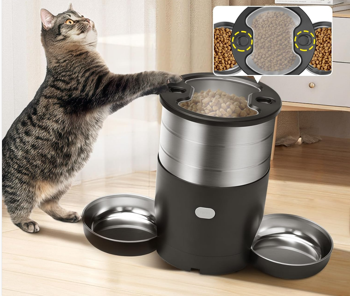
Image: A cat attempting to open the feeder's lid, demonstrating the safety locking mechanism designed to prevent pets from accessing food prematurely.

Prevent Food Come off and Prevent cats from stealing food