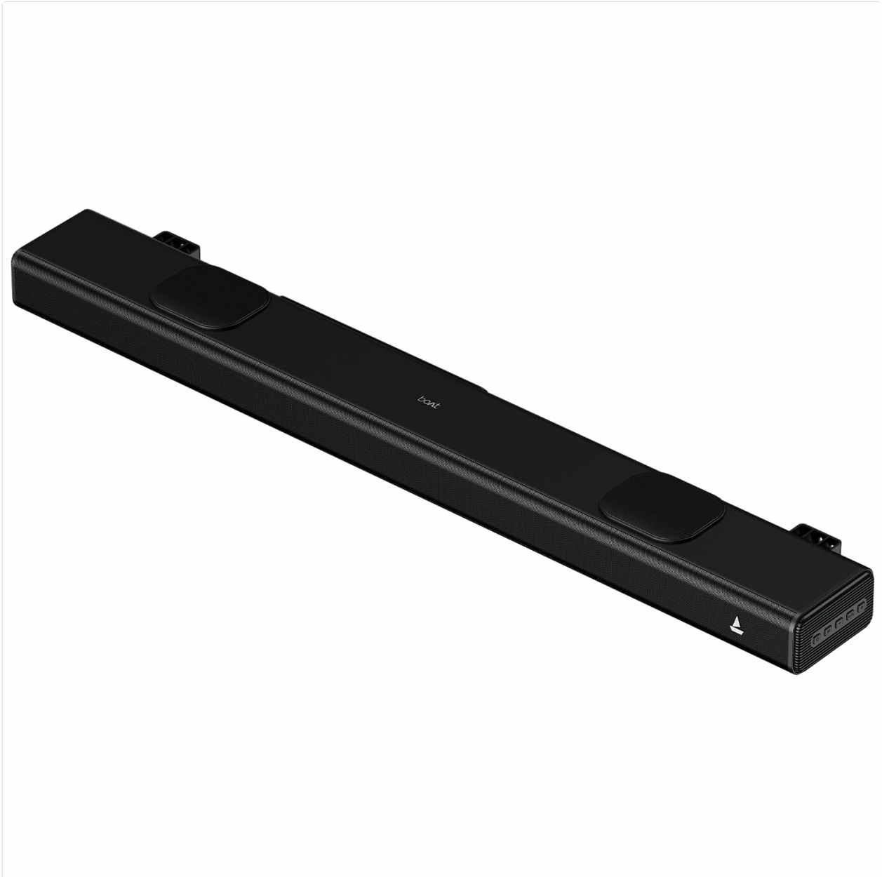
Image: Front view of the boAt Aavante 2.2 1400 Soundbar, showcasing its compact and elegant design.

The soundbar features a sleek design with integrated controls and various input ports on the rear panel.