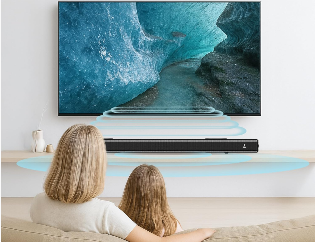
Image: The boAt Aavante 2.2 1400 Soundbar positioned below a television, illustrating its 2.2-channel audio with built-in subwoofer for an immersive experience.