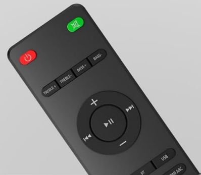
Image: Illustration showing the soundbar's easy access controls and the master remote control, along with icons for Music, Movies, and News EQ modes.