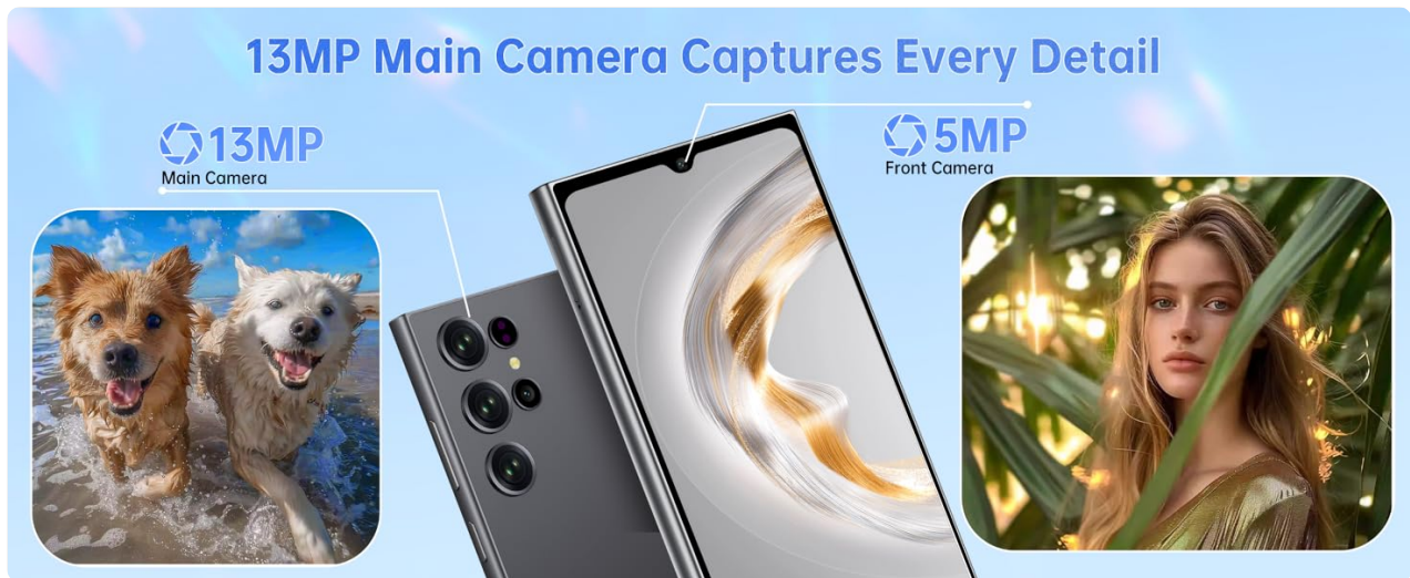
Image: 13MP Main Camera capabilities.

The 13MP main camera, enhanced with AI imaging algorithms, helps you take clear and natural photos. Open the Camera app and select various shooting modes such as Panorama, Portrait, Beauty, HDR, and Professional mode to suit different scenarios.