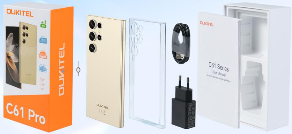
Image: Contents of the OUKITEL C61 Pro retail box.