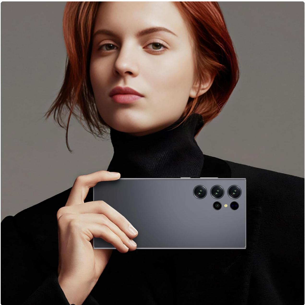
Image: Storage and RAM capabilities.