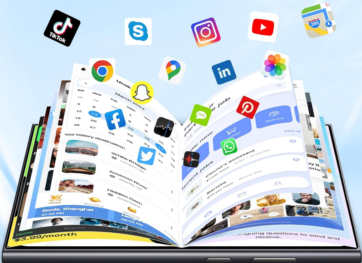
Image: Overview of key features of the OUKITEL C61 Pro.