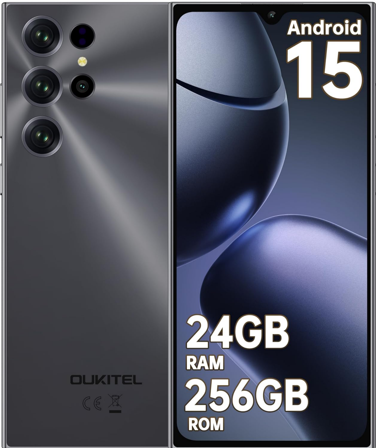
Image: Front and back view of the OUKITEL C61 Pro.