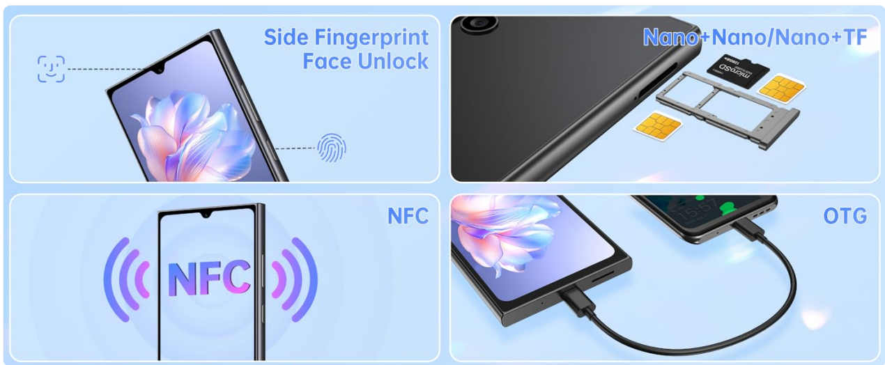
Image: SIM and TF card installation diagram.