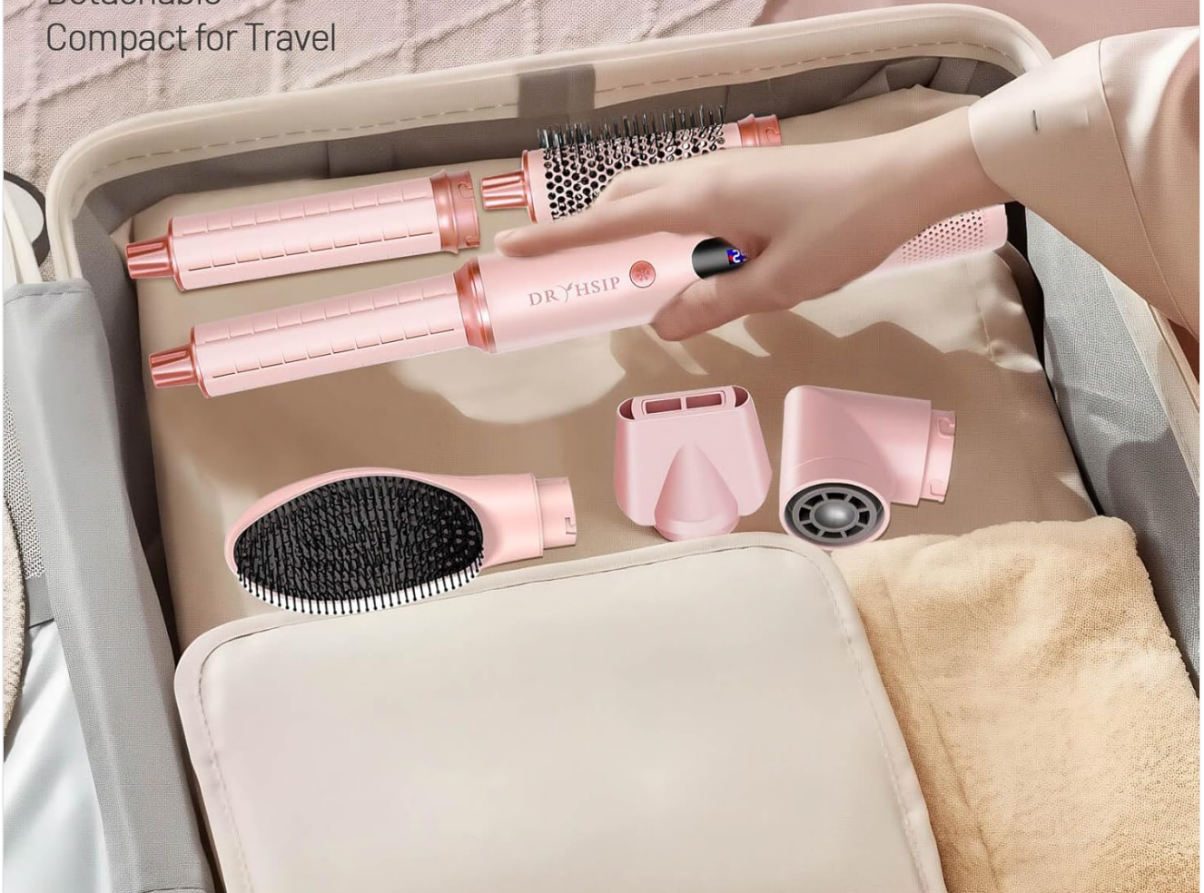
Figure 6.1: Portable Storage. This image demonstrates the compact and detachable nature of the styler, making it convenient for travel and storage.