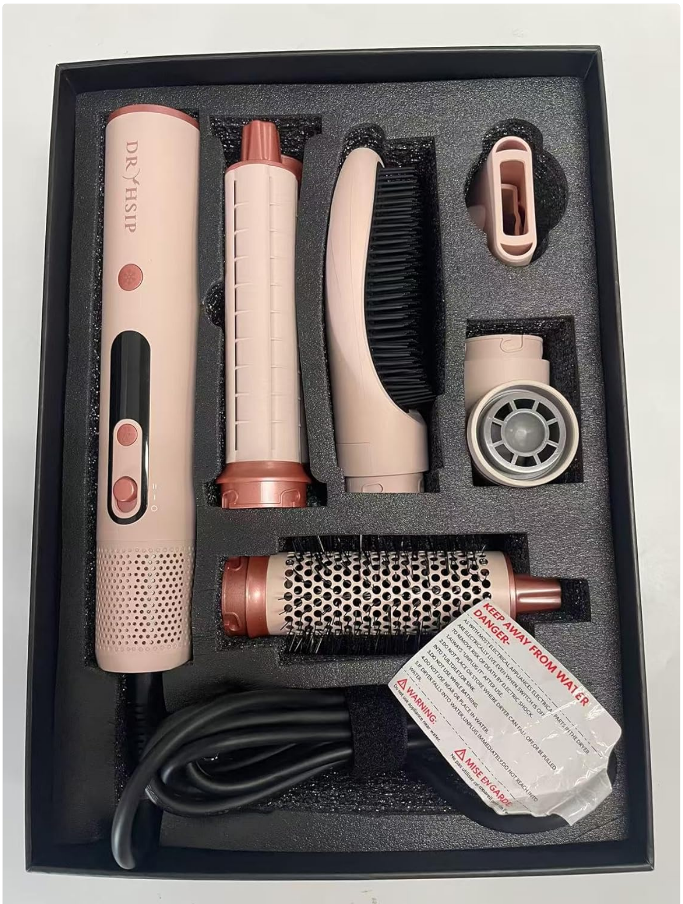
Figure 3.2: Styler Set in Packaging. The components are securely nested within the product's original packaging, demonstrating how they are received.