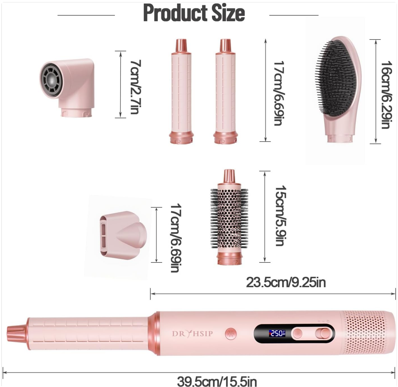
Figure 8.1: Product Dimensions. This diagram provides detailed measurements for the main styler unit and each of its attachments.