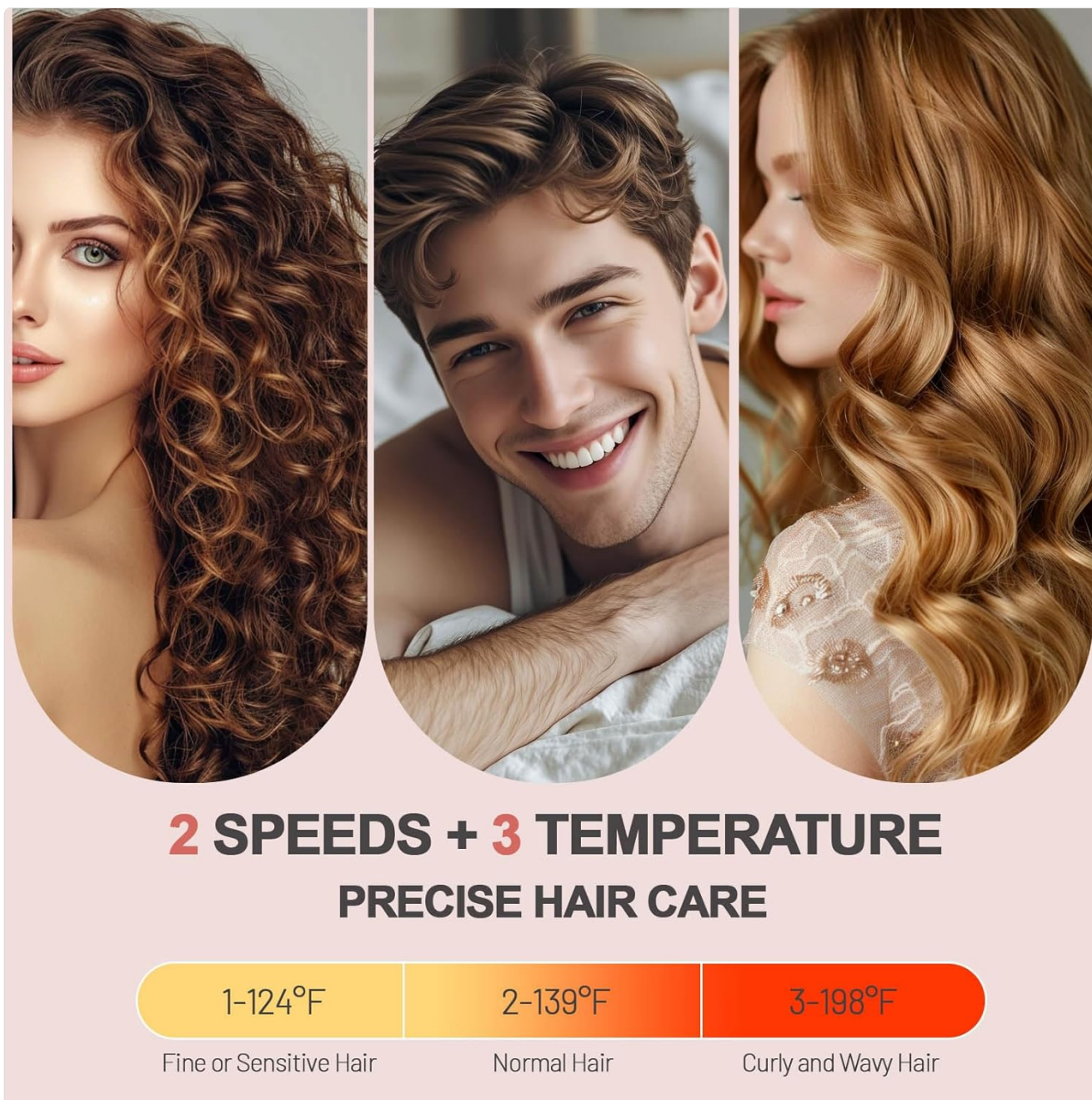
Figure 5.1: Temperature and Speed Control. This diagram illustrates the recommended temperature ranges for different hair types and the available speed settings.