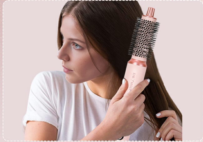
Figure 5.5: Volumizing with Round Brush. This image shows the round brush in action, illustrating its capability for wet-to-dry volumizing and styling without heat damage, suitable for bangs or inner buckle shapes.