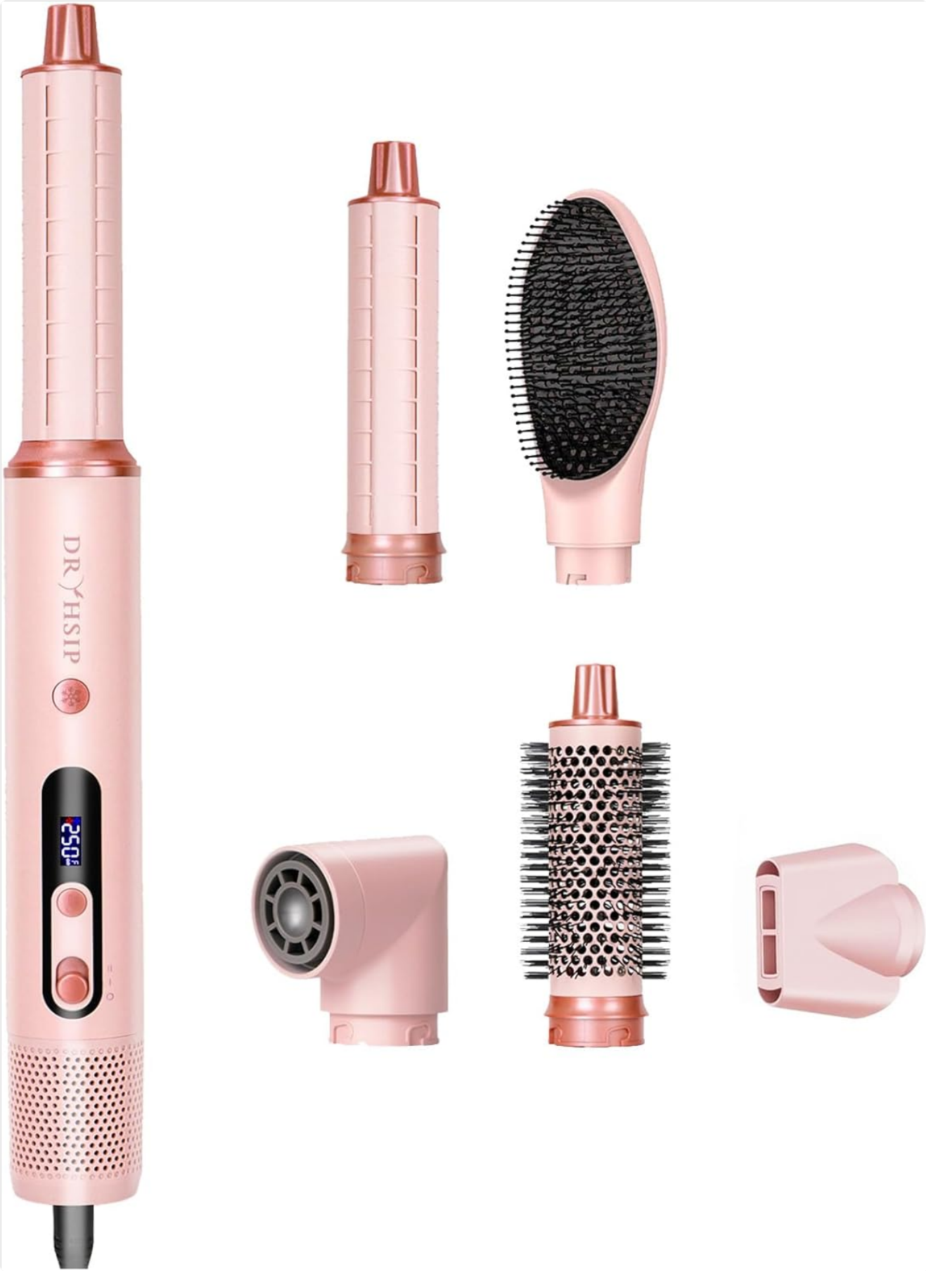
Figure 3.1: Complete Styler Set. This image displays the main styler unit and all included attachments: the curling wands, smoothing brush, round brush, and concentrator nozzle.

various styling needs. Familiarize yourself with each component: