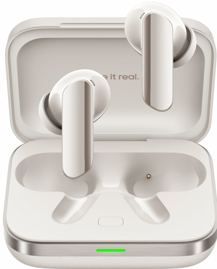
Image: realme Buds Air 7 Pro earbuds in Glory Beige color, shown with their charging case.