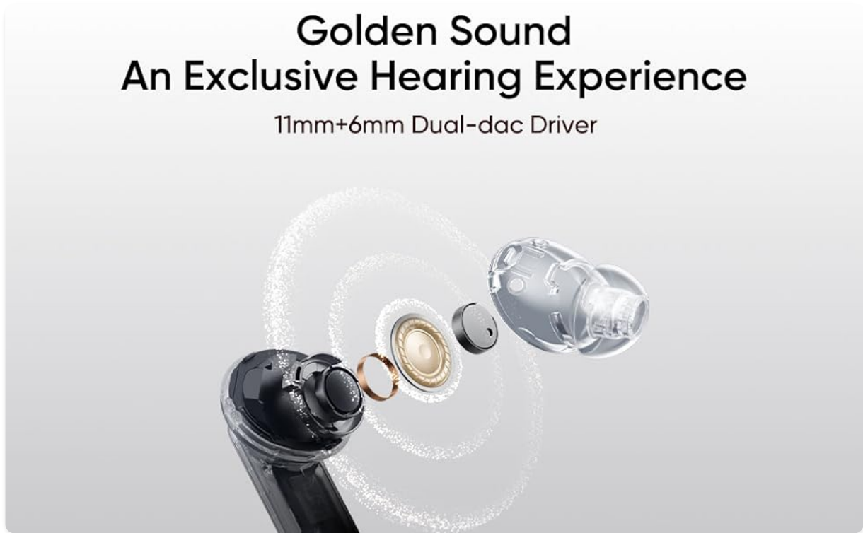
Image: Exploded view of an earbud, illustrating the 11mm and 6mm dual-dac drivers responsible for audio output.