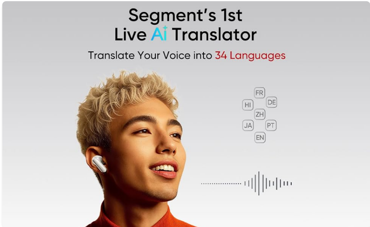
Image: A user demonstrating the AI Live Translation feature, with language options displayed on a screen.

Utilize the AI Live Translation feature for real-time language translation. This function requires the realme Link app and an active internet connection. Refer to the app for supported languages and usage instructions.