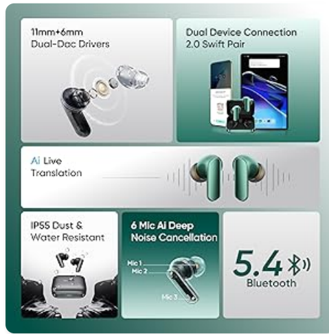
Image: A visual summary of the realme Buds Air 7 Pro's main features, including dual device connectivity.