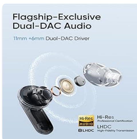
Image: Detailed view of the earbud's internal structure, highlighting the dual-dac drivers for superior sound quality.

The realme Buds Air 7 Pro features 53dB Real-Time Noise Cancellation to reduce ambient sounds. Cycle through ANC On, Transparency Mode, and ANC Off by pressing and holding one earbud.