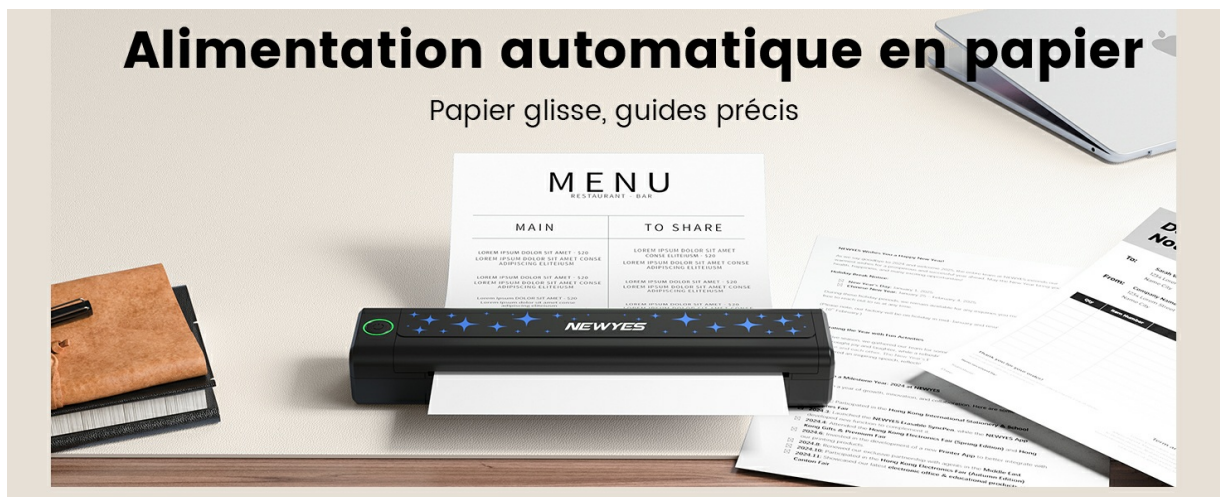
Image: The NEWYES LD0803 printer showcasing its high-resolution printing capabilities, wireless and portable design, low noise operation, a print speed of 15mm/s, a print volume of 100,000 sheets, and support for A4/US Letter paper sizes.

This manual provides essential information on setting up, operating, maintaining, and troubleshooting your printer to ensure optimal performance.