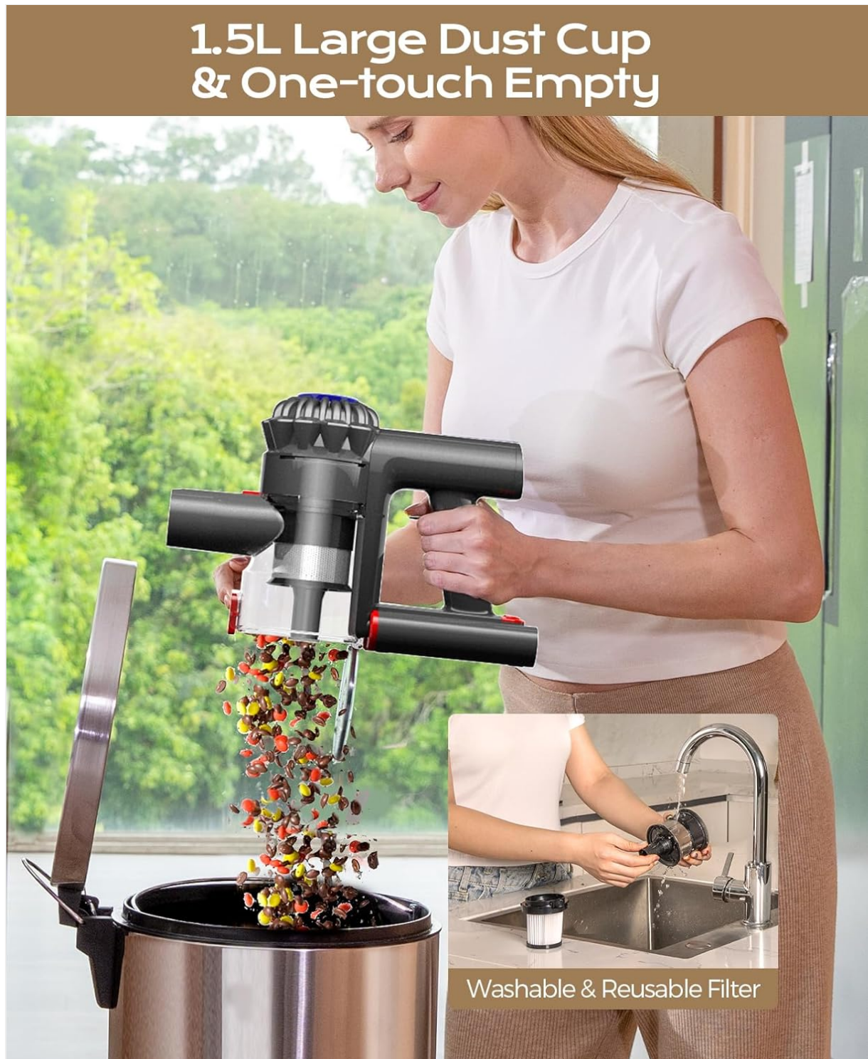
Image: A woman emptying the vacuum's dust cup into a trash bin.