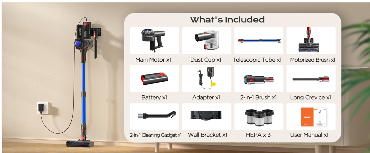
Image: A visual representation of all parts included in the package.