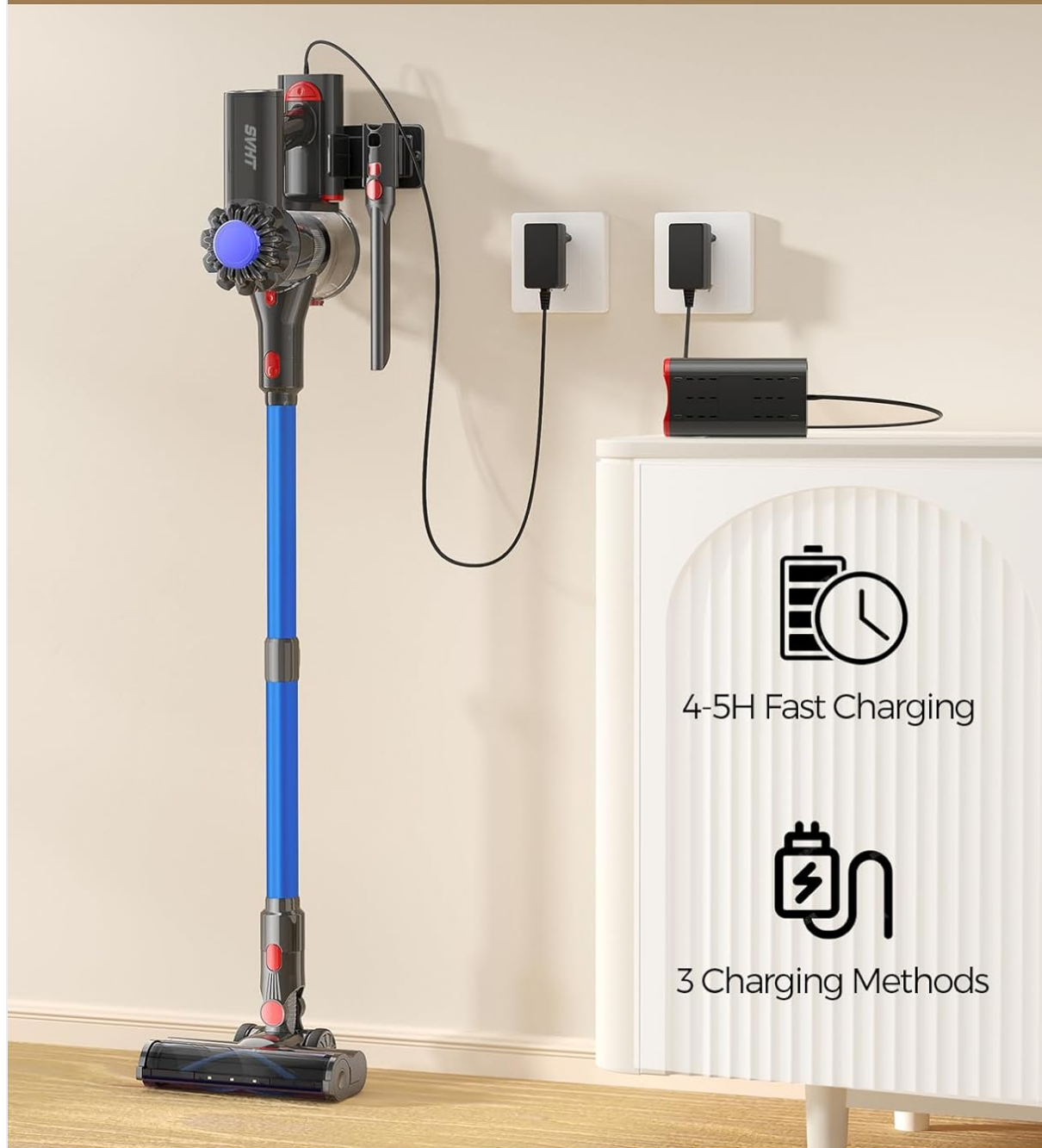
Image: The vacuum cleaner mounted on the wall for storage and charging.

Your browser does not support the video tag.