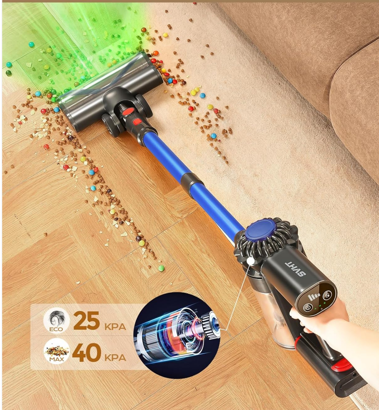
Image: The vacuum cleaner in action, highlighting its powerful suction on various debris.