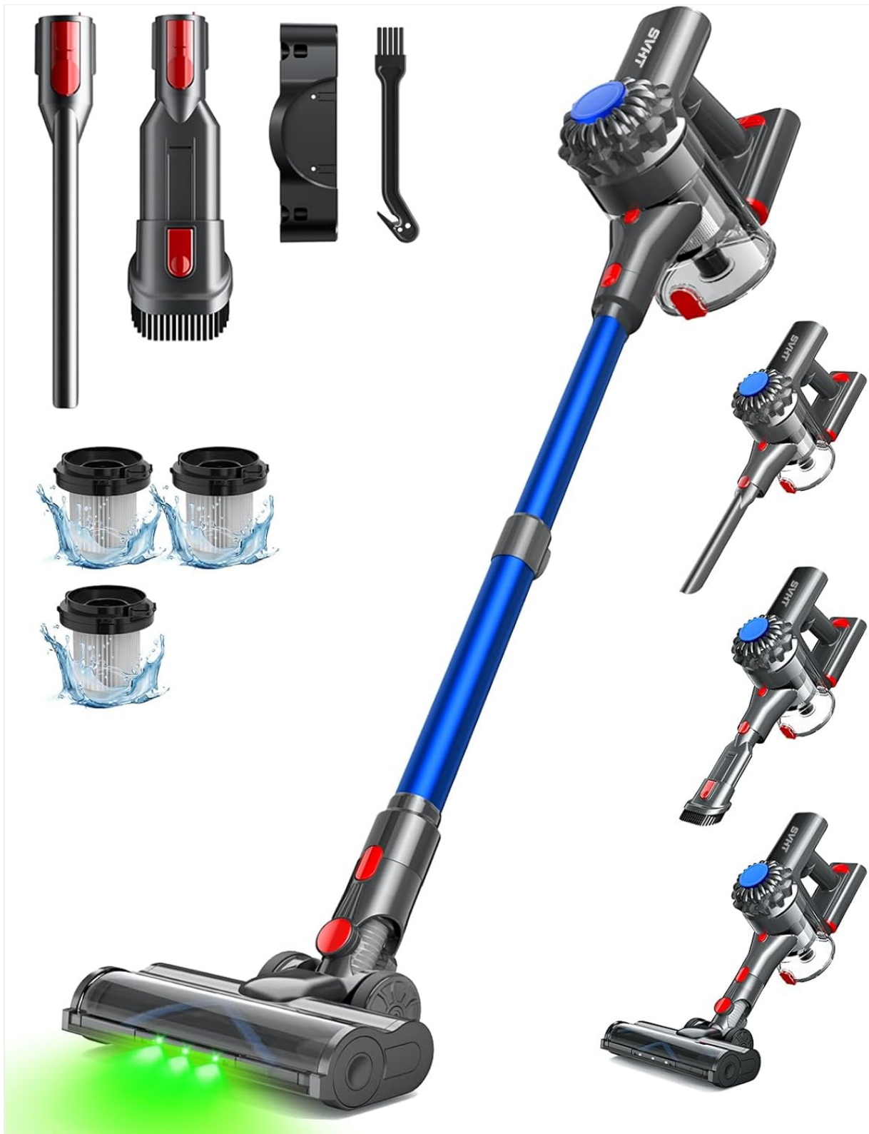
Image: All components included with the SVHT Cordless Vacuum Cleaner.