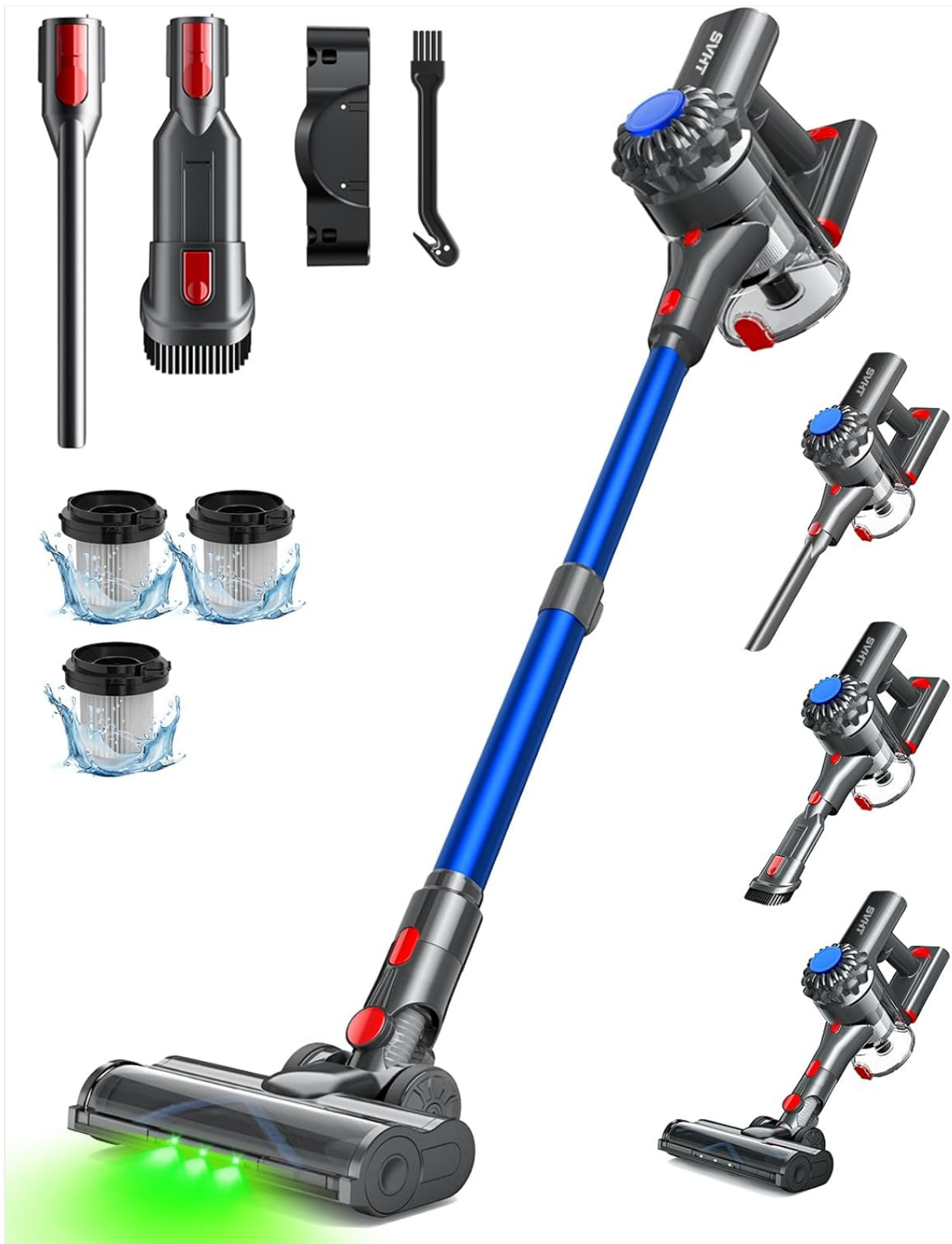
Image: The SVHT Cordless Vacuum Cleaner fully assembled.