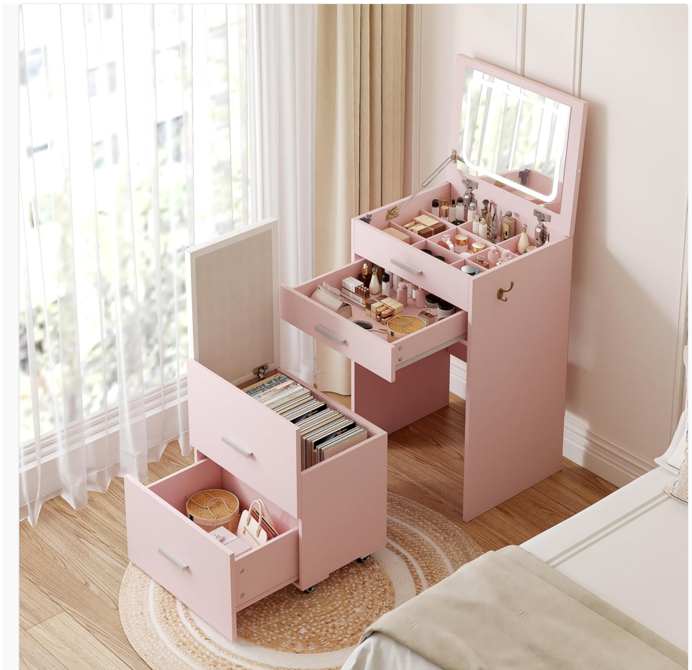
Image 1.1: The PulseFay 3-in-1 Compact Vanity Desk in its open configuration, showcasing the flip-up mirror and storage options.