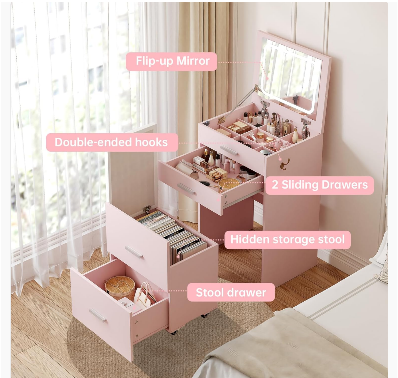
Image 4.1: Components of the vanity desk, including the flip-up mirror, sliding drawers, and the storage stool.