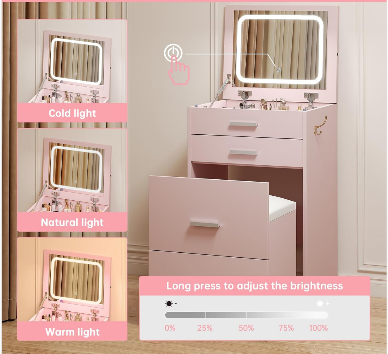
Image 5.1: Demonstration of the three color lighting modes and brightness adjustment for the LED mirror.