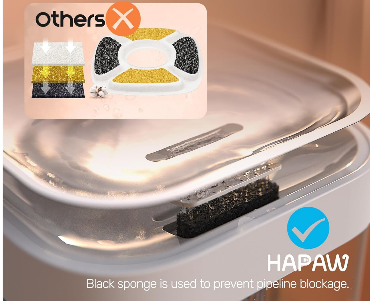
Image 1.2: The fountain utilizes a durable, reusable black sponge to trap pet hair and food residue, eliminating the need for traditional filter cotton.