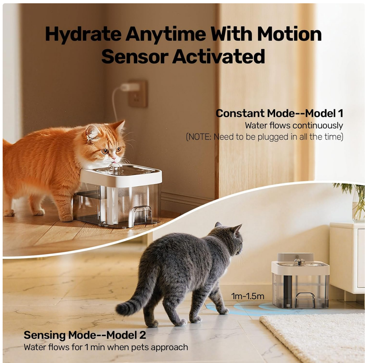
Image 4.1: The fountain supports both continuous flow (Mode 1) and sensor-activated flow (Mode 2) for flexible use.

To switch between Mode 1 and Mode 2, press the mode button on the control panel.