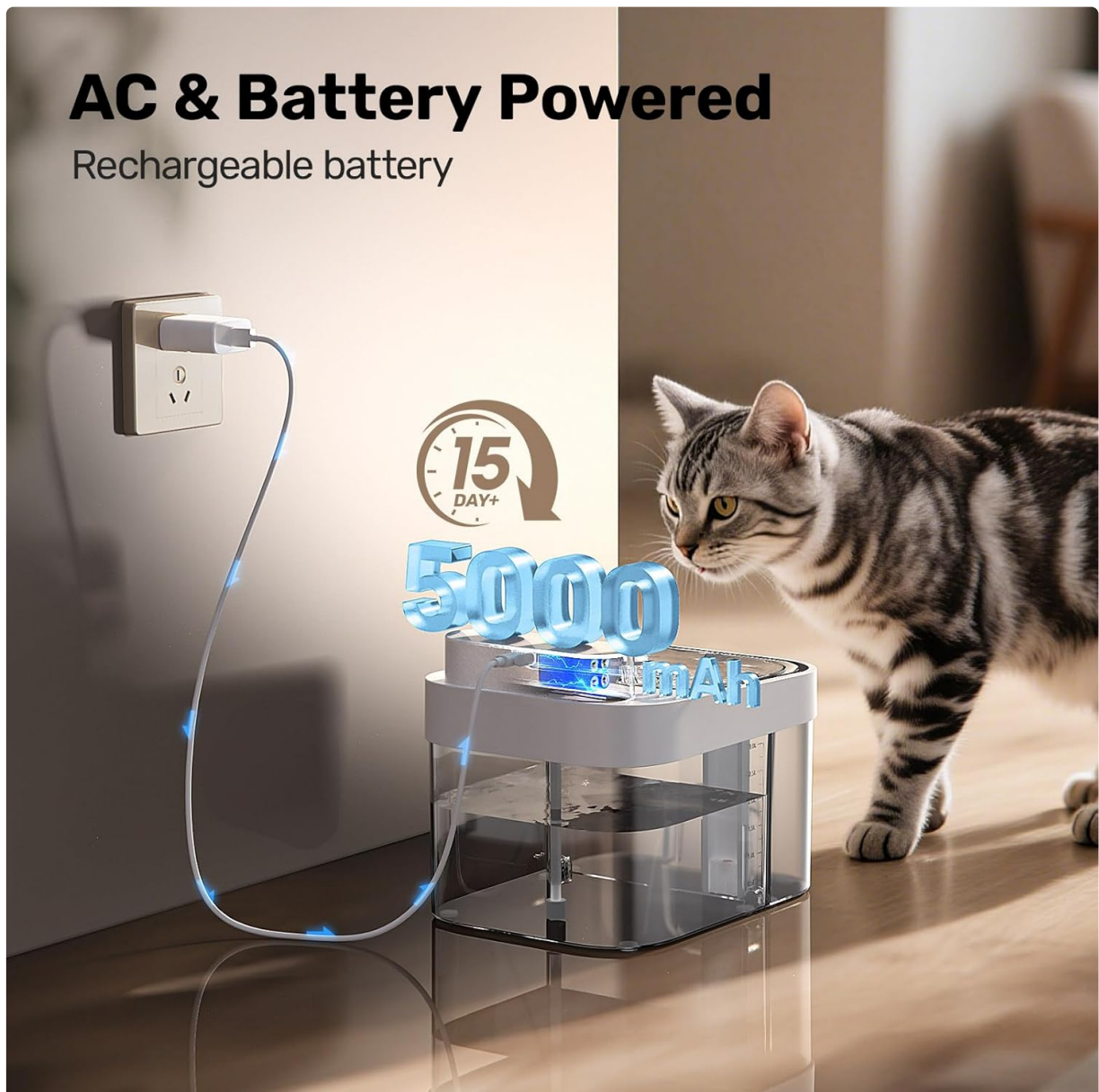
Image 3.1: The HAPAW P003 can be powered by AC or its internal 5000 mAh rechargeable battery.

Video 3.1: Step-by-step assembly guide for the HAPAW P003 Cat Water Fountain.