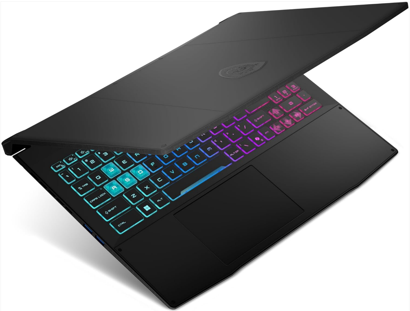
Figure 3: Top-down view of the laptop, showcasing the RGB keyboard.