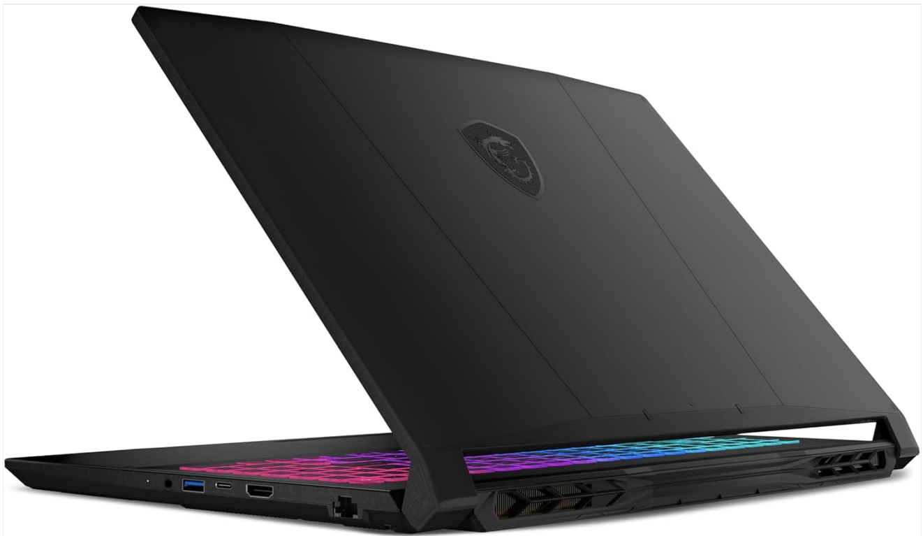
Figure 6: Rear view of the laptop, showing the cooling vents and some rear ports.