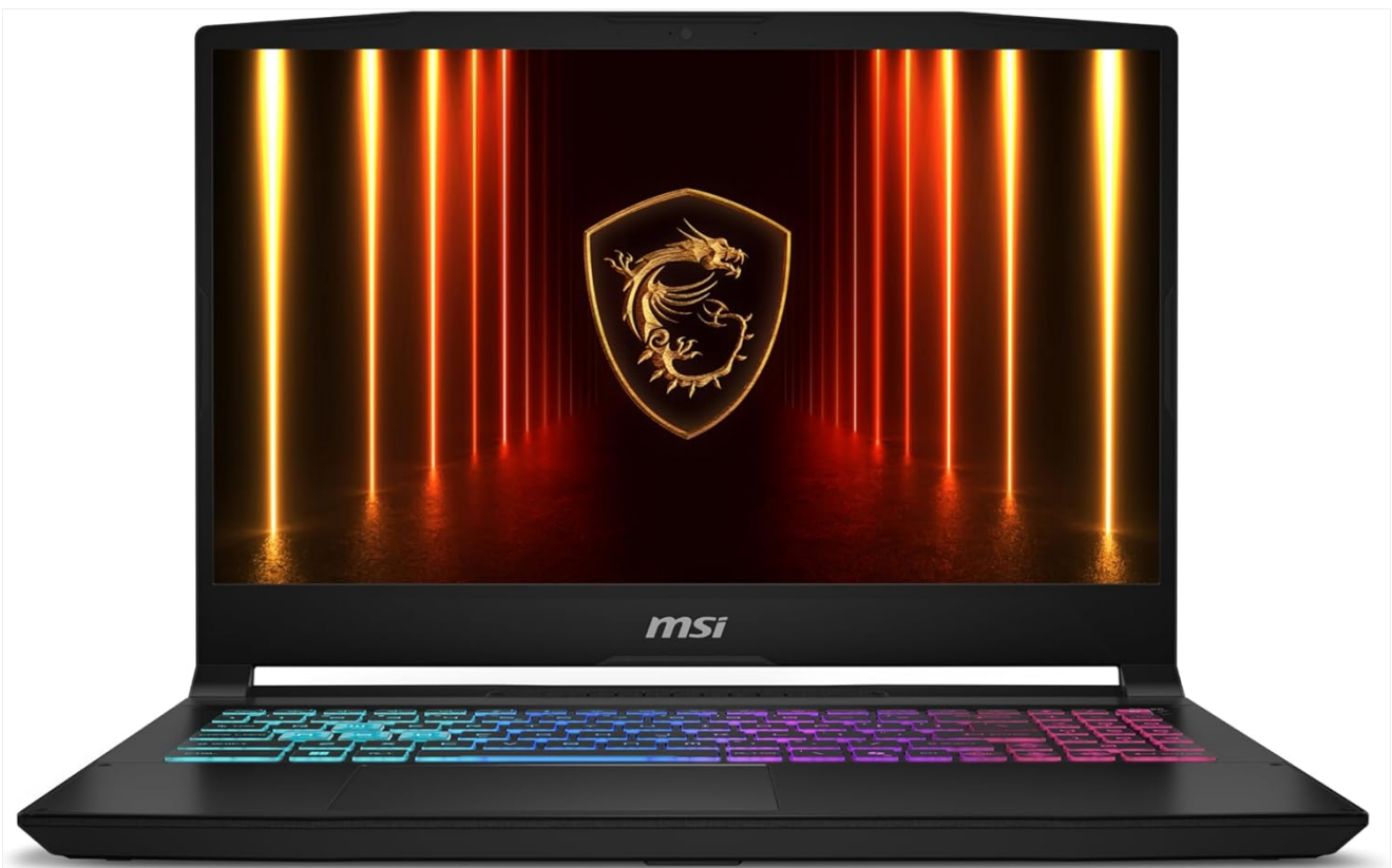
Figure 1: Front view of the MSI Katana 15 HX B14WGK-248CA Gaming Laptop.

This manual provides essential information for the proper use and maintenance of your MSI Katana 15 HX B14WGK-248CA gaming laptop. Please read this guide thoroughly before operating your device to ensure optimal performance and longevity. This laptop is designed for high-performance computing, featuring an Intel Core i7-14650HX processor, NVIDIA GeForce RTX 5070 Laptop GPU, and a 15.6-inch QHD 165Hz display with 4-zone RGB keyboard.