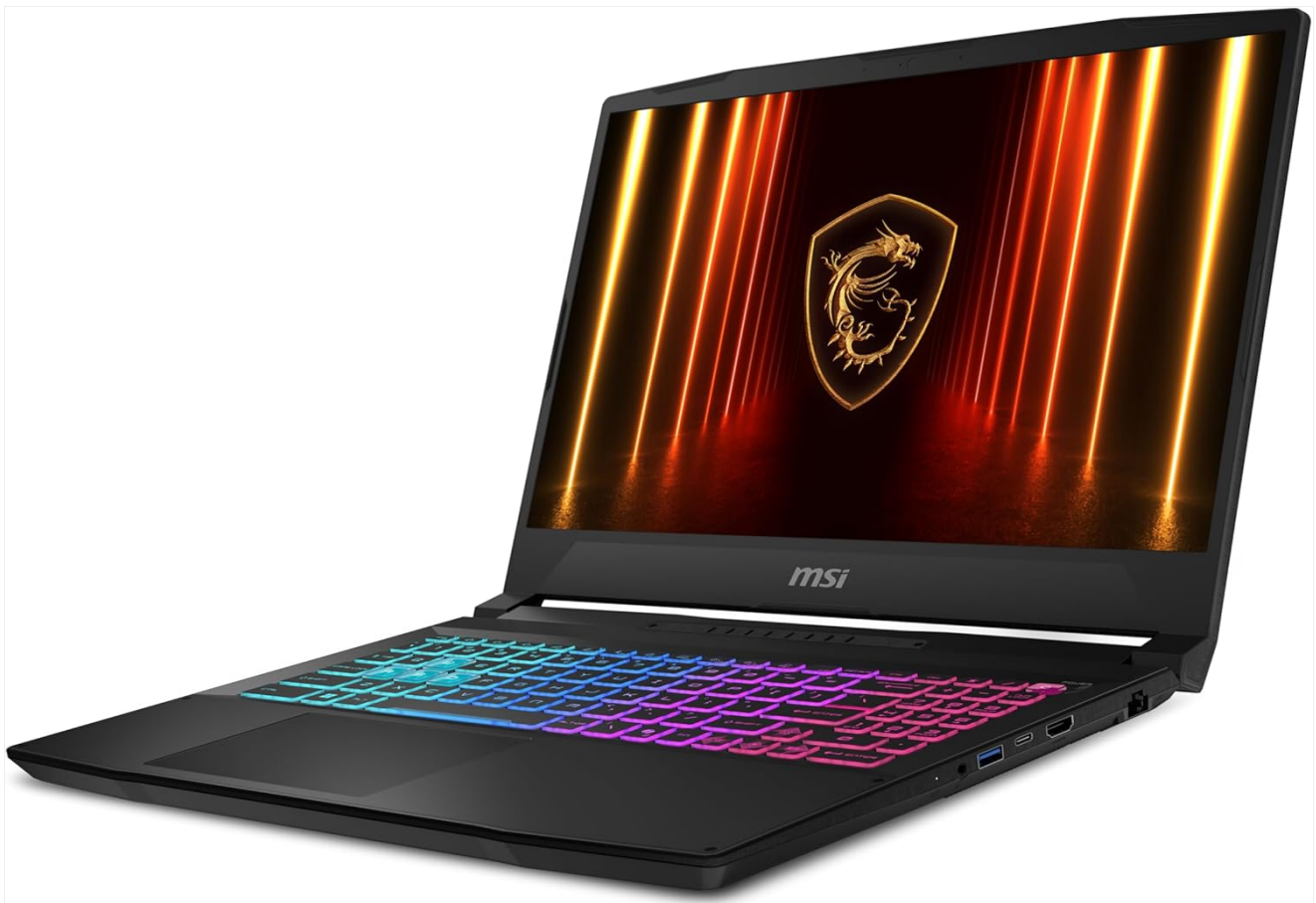
Figure 2: Front-right view of the laptop, illustrating the keyboard and display.