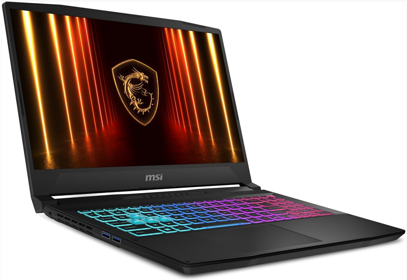
Figure 4: Left side view of the laptop, highlighting available ports.

For wireless connectivity, the laptop supports Wi-Fi 6E (802.11ax) and Bluetooth 5.3.